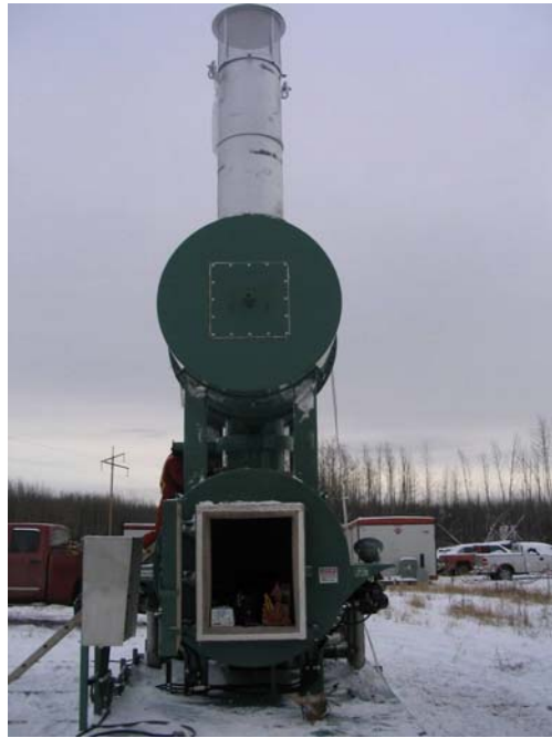
Figure 2.2 Typical Controlled Air Dual Chamber Incinerator