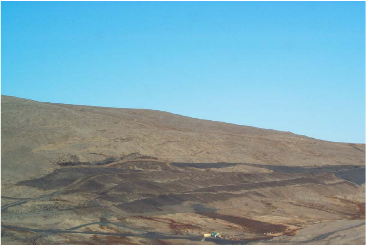
View of the reclaimed East Open Pit