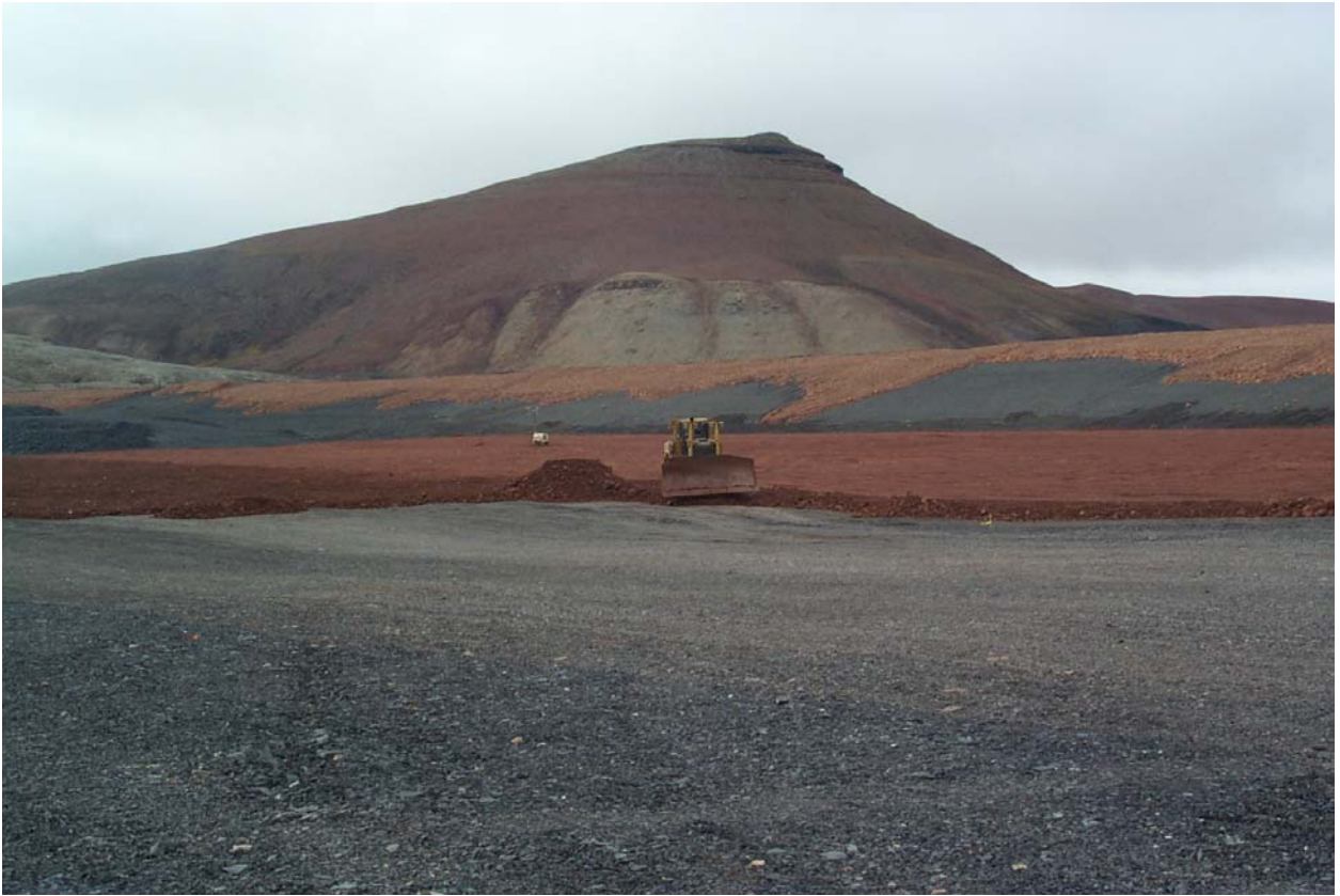
Sand and Gravel Cover in progress at the Test cell