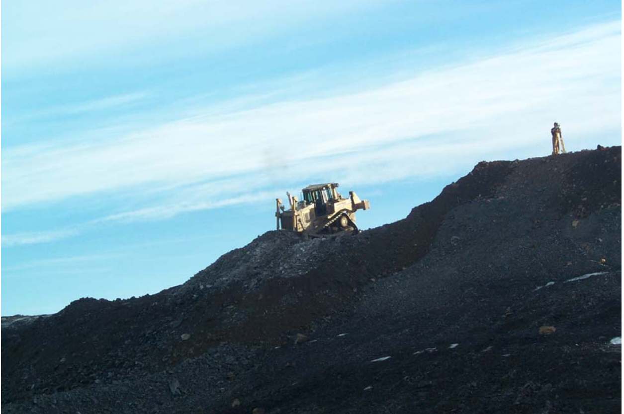
Final Sloping of the Shale Hill Quarry