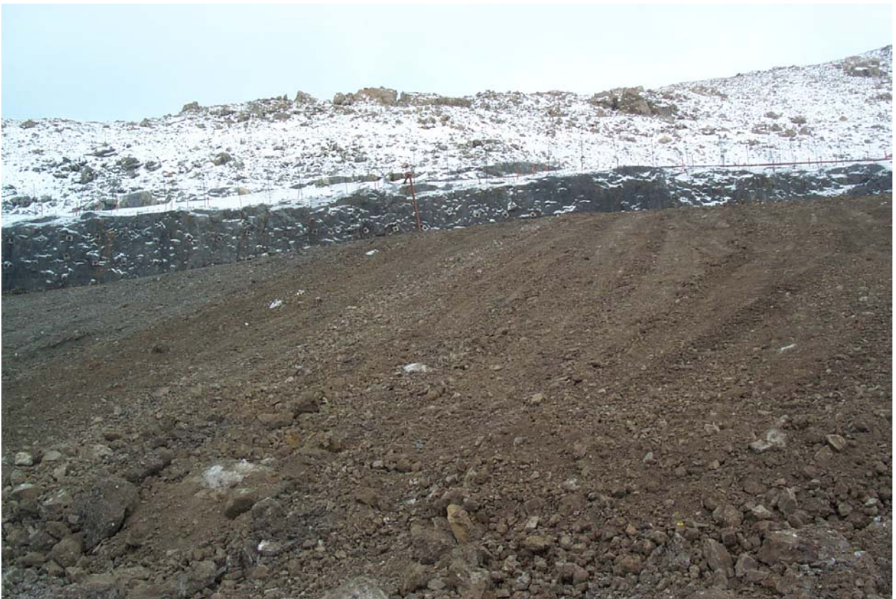
Waste Rock placed in the West Open Pit