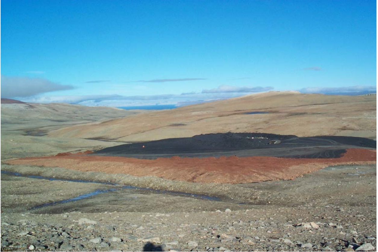
Sand and Gravel placement at the landfill site in progress