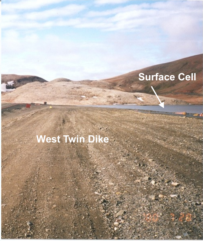
Photo #1 (left) View from the top of the West Twin Dike looking at the south abutment area. Note the location of the proposed spillway outlet and the elevation difference between the Surface Cell and the Reservoir.