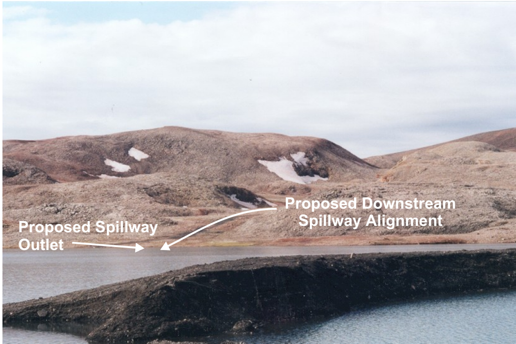
Photo #2 (Above) View from Test Cell Dike in the Reservoir. Note proposed outlet and downstream section of spillway.