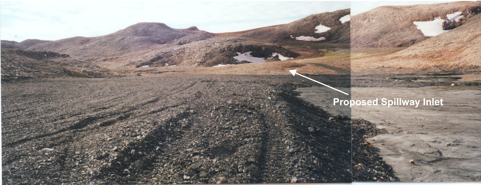
Photo #3 (Above) View of proposed spillway inlet area. Note shale seal placed over tails on upstream side of dike.