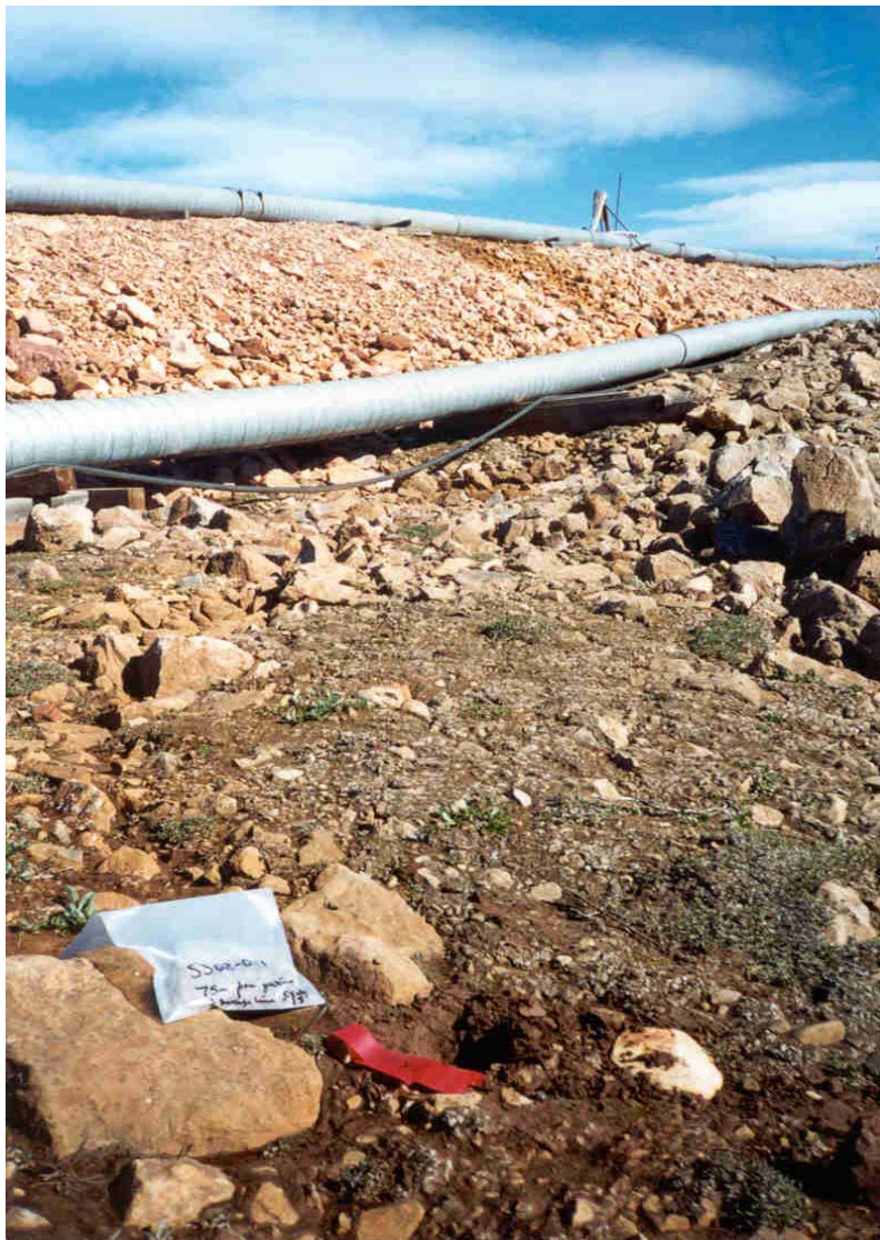
SS02-011 Detail at Historic Tailings Line Break, July 2002. Note orange stained drainage path from tailings pipeline at crest of ridge to sample site.