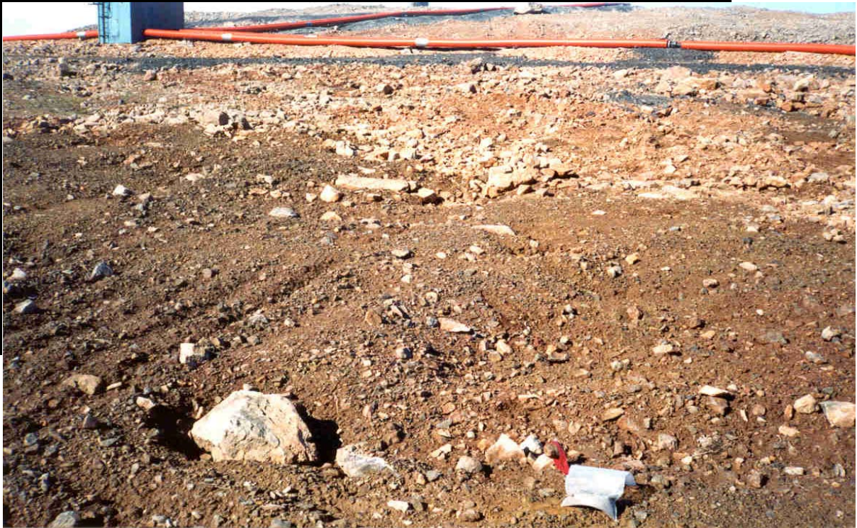
SS02-08 Detail at Historic Tailings Line Break down gradient of Potable Water Tank, July 2002. Note fresh shale under tailings pipeline.