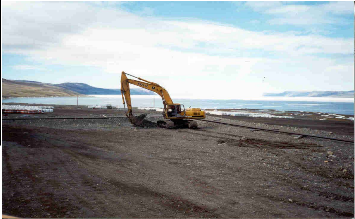
TP02-49 and TP02-50 Excavation within berm surrounding the fuel pump building at Dock Area, July 2002.