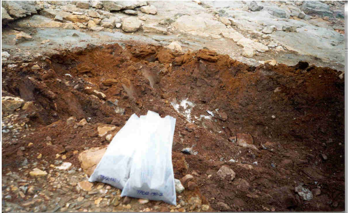
TP02-130 Detail at Historic Tailings Line Break, July 2002