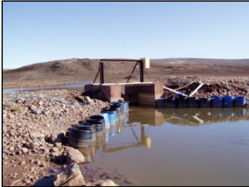
Upstream Side Of Control Structure