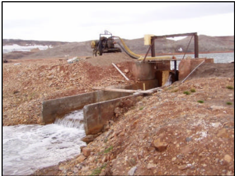
Control Structure Outfall

NOTE: THIS DRAWING WAS PREPARED USING THE ORIGINAL AS-BUILT DRAWING (KILBORN 1977), NANISIVIK MINE AS-BUILT DRAWING (GLACIAL TILL CUTOFF), AND SITE OBSERVATIONS/PHOTOGRAPHS.