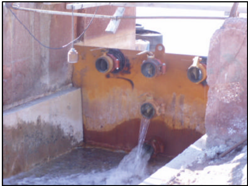
Downstream Side Of Weir Plate Showing Valves

PLOT DATE: March 04, 2004 FILENAME: T:\Projects\2003\03-1118-049 (BR, Nanisivik)\-DA-BGC Supplemental\031118049DA23.DWG