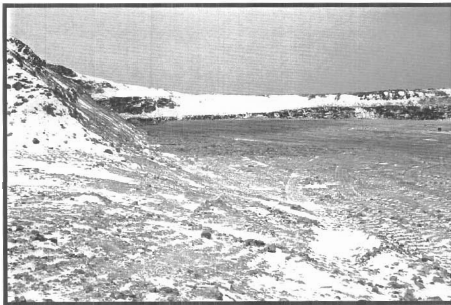
Photo 9 Edge of cover along south side of quarry.