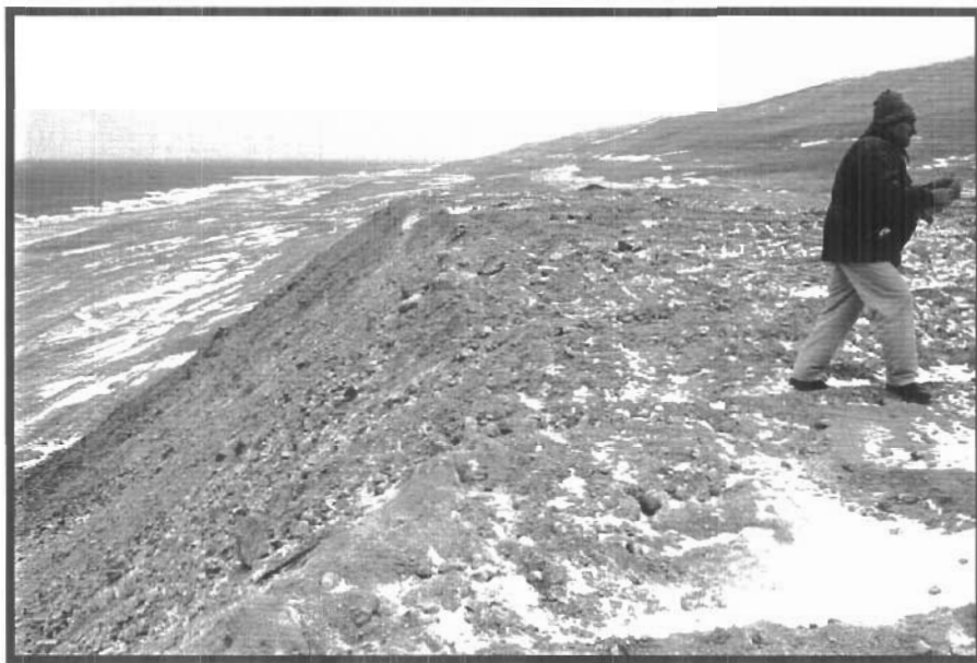
Photo 19 Looking north along crest of slope below tank farm area. Slope needs to be flattened.