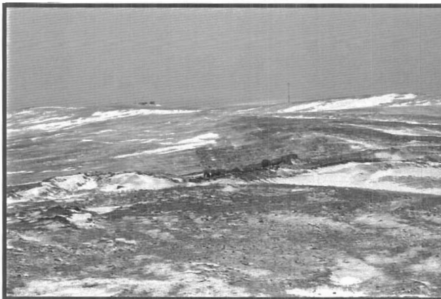
Photo 19 View to south of airstrip area.