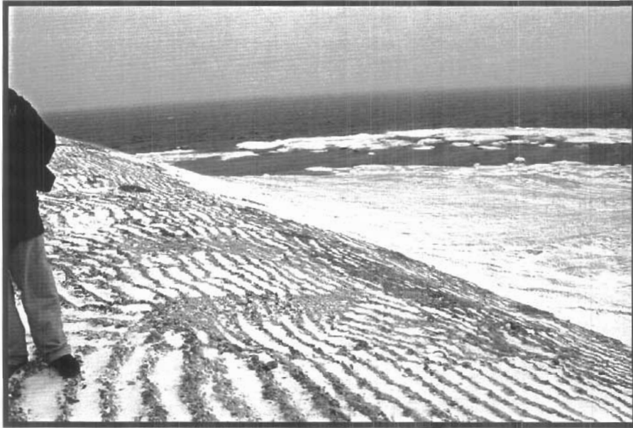
Photo 14 Reclaimed slope above the North Portal.