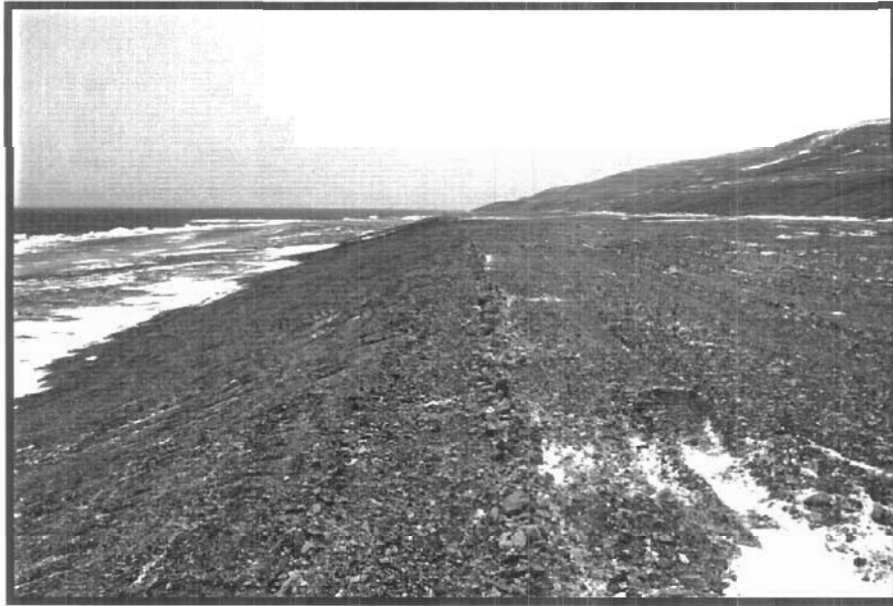
Photo 20 Looking north across former product storage building foundation.