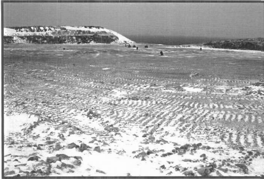
Photo 8 View to northwest across LRD Quarry Landfill cover. Note notch cut out of rock at far end for drainage.