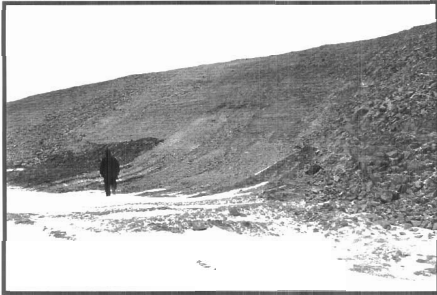
Photo 2 Main portal area backfilled.