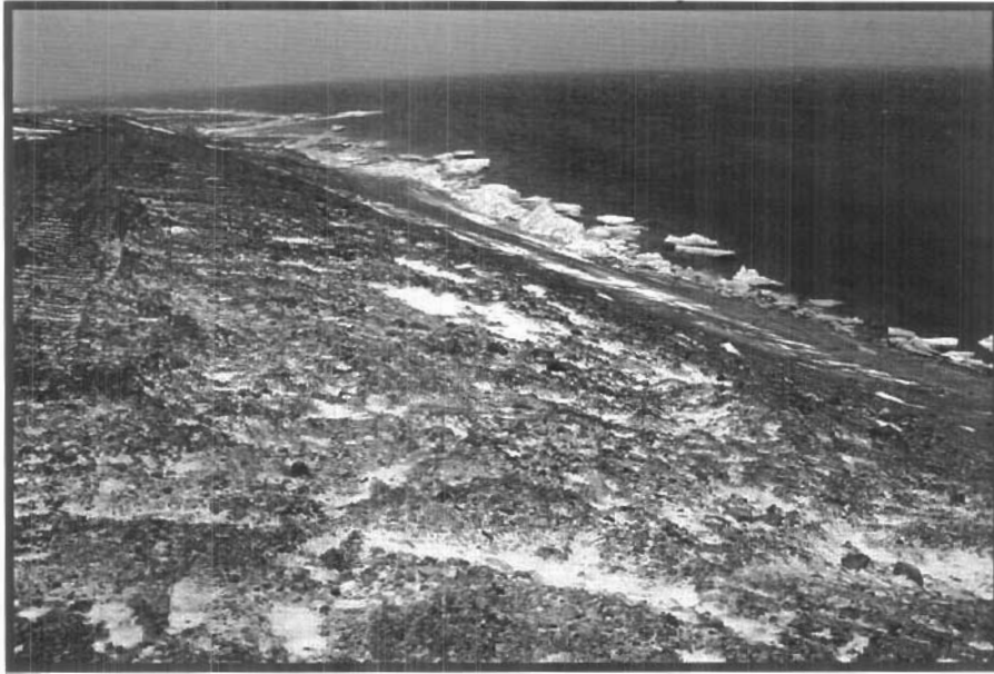
Photo 4 Looking south from road to LRD Quarry, along shoreline north of dock area.