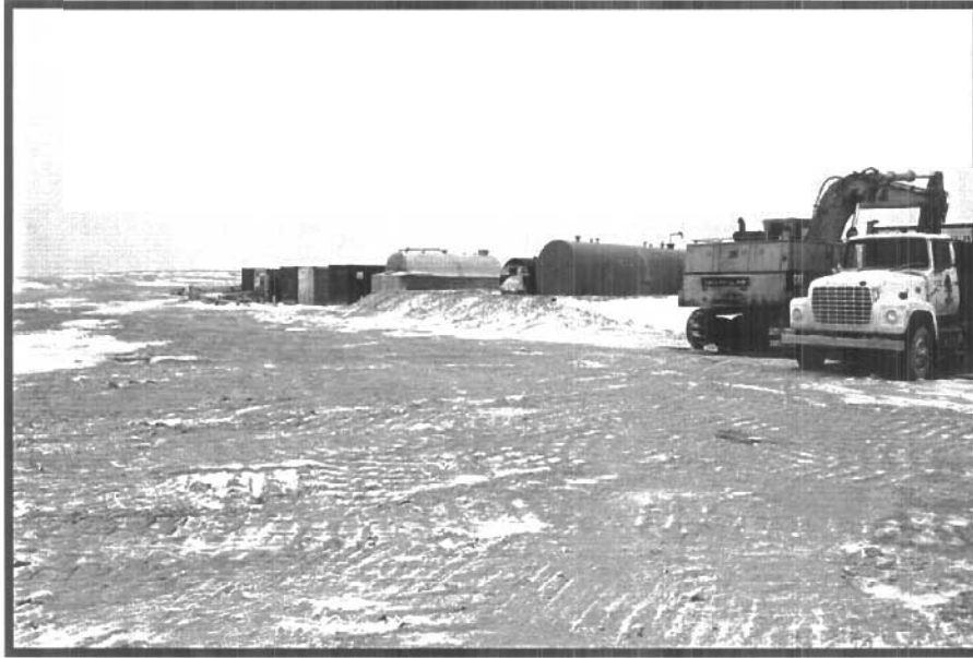
Photo 26 Miscellaneous equipment left on site at the trailer camp for ongoing remedial repairs.