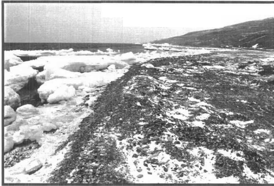
Photo 26 Shoreline to north of former dock cell area.