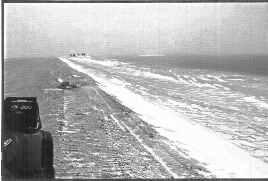
Photo 22 View along runway in vicinity of accommodation complex.