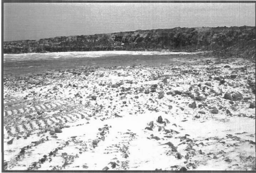
Photo 10 Edge of cover along east side of quarry.