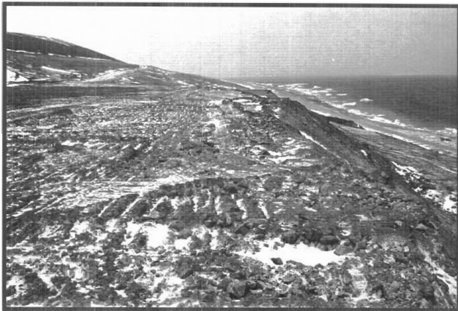
Photo 18 Looking south along crest of slope where tank farm was located. The slope to the right needs to be flattened and re-contoured.