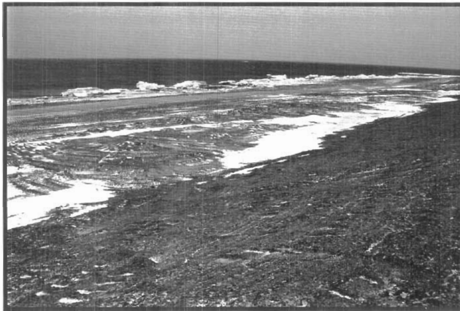
Photo 23 View towards former dock cell area, from product storage building.