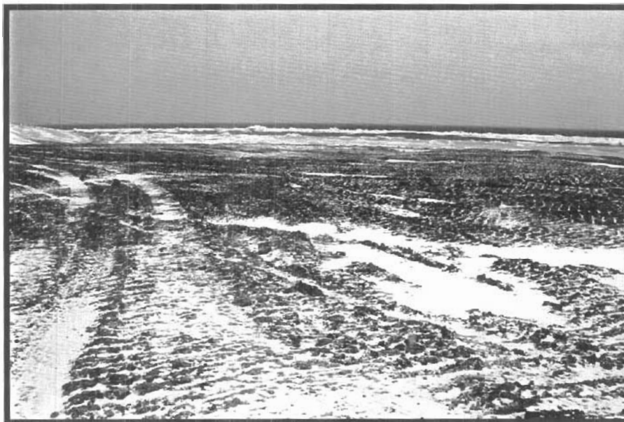
Photo 17 Reclaimed shoreline area in front of North Portal.