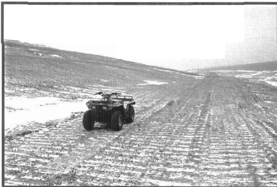
Photo 3 Looking south towards Main Portal area from road to LRD Quarry.