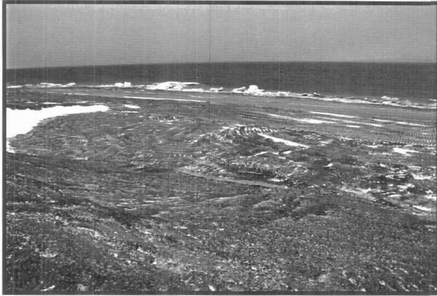
Photo 22 View of shoreline area in front of product storage building area.