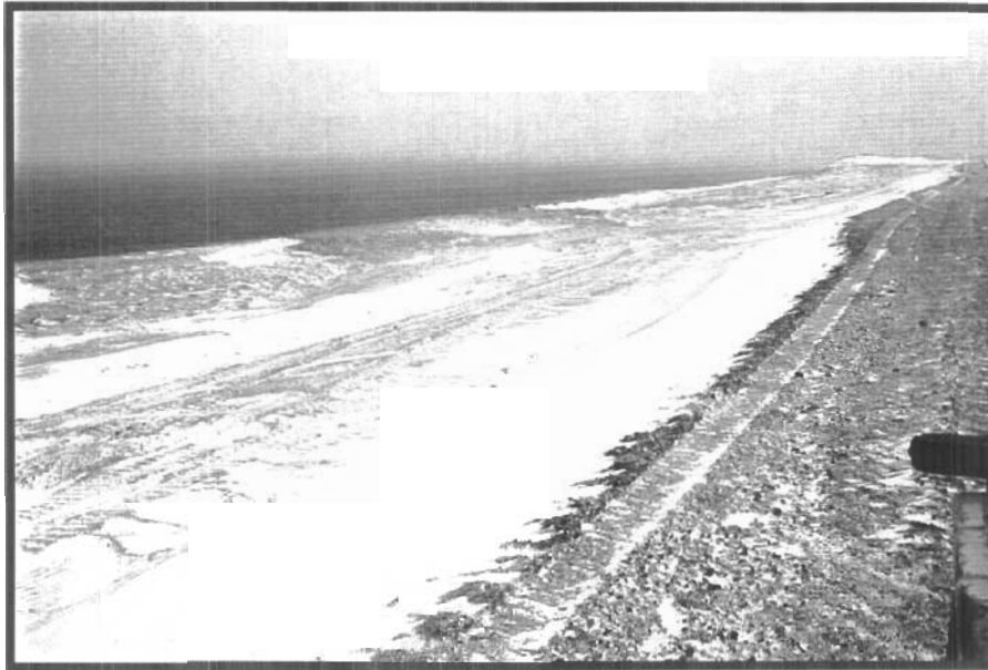
Photo 24 Looking north along west side of runway towards area to the north of the accommodation complex.