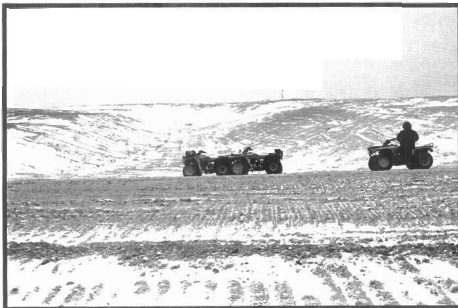
Photo 13 Reclaimed slopes in former open pit area, located above the North Portal.