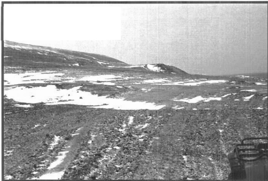
Photo 24 Looking south towards bench which contained tank farm. Note steepness of slope below tank farm bench compared with reclaimed and re-contoured slope above.