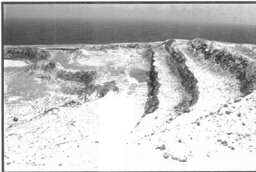
Photo 21 Benches along east side of LRD Quarry.