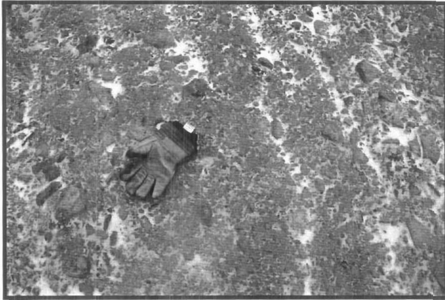
Photo 12 Close-up view of LRD Landfill cover material, composed of limestone obtained from LRD Quarry.