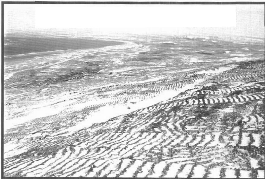
Photo 15 Looking east along re-contoured slopes east of North Portal area.