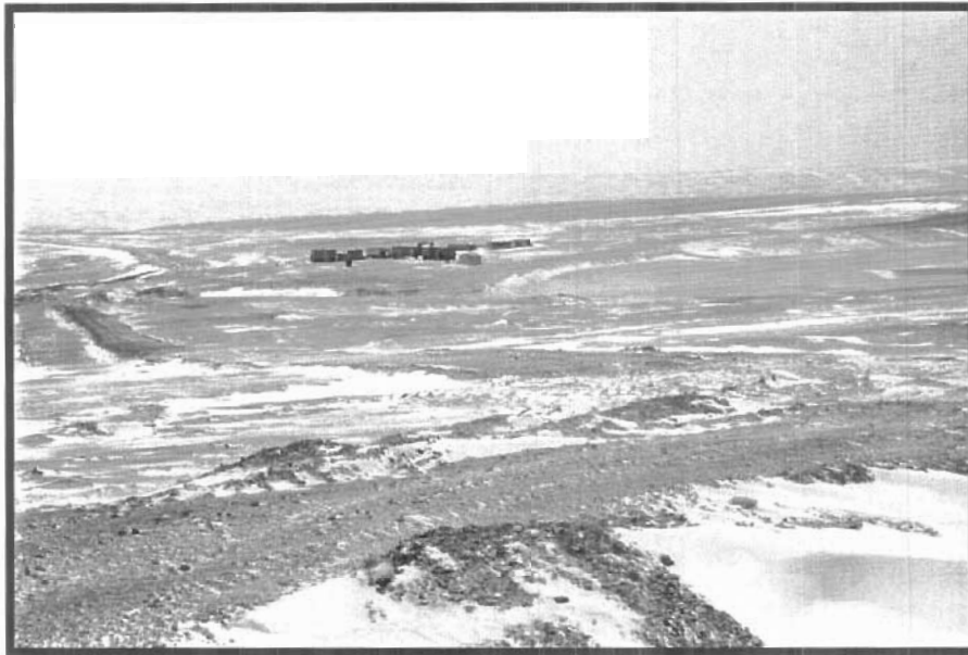
Photo 18 View of temporary trailer camp set up in vicinity of former CRF Plant area.