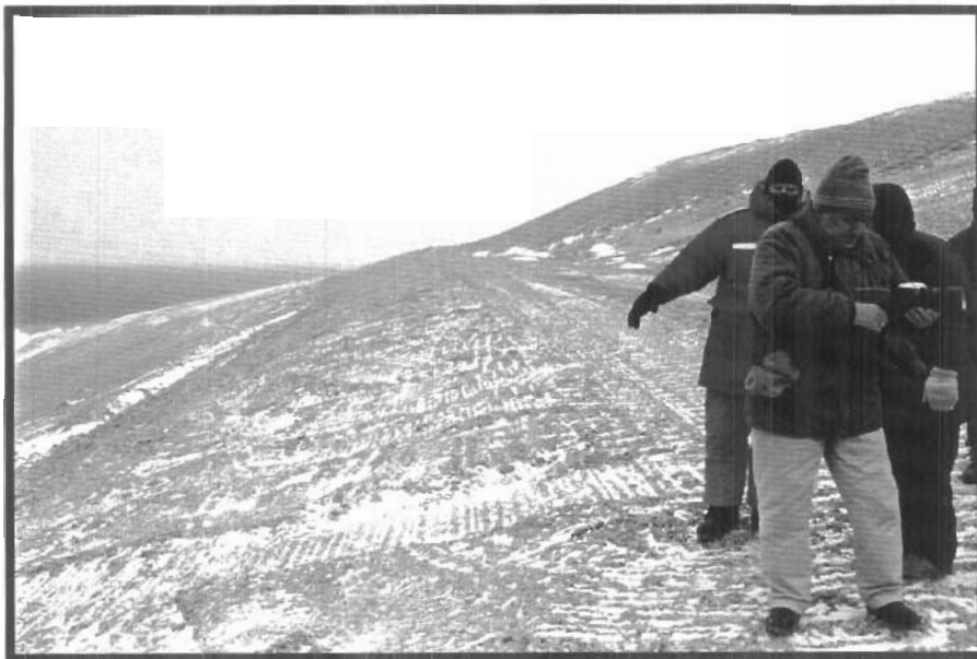
Photo 5 Looking north along road to LRD Quarry. Note reclaimed slopes.