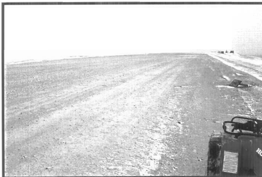
Photo 25 Runway, looking south.