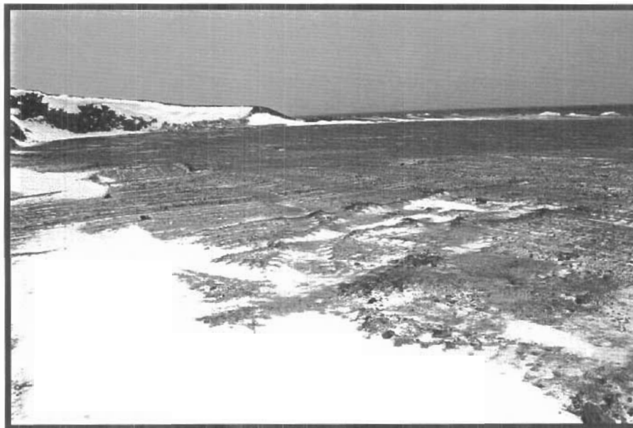
Roll 5 Photo 1 View of former barge area.