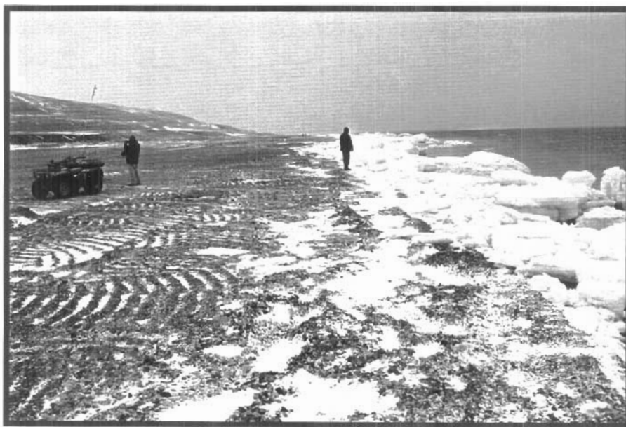
Photo 25 Looking south along former dock cell area.