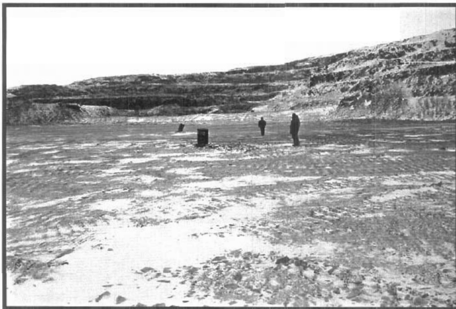
Photo 6 LRD Quarry with thermistors inside barrels.