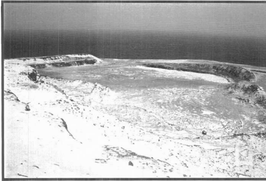
Photo 20 Looking north from end of runway across LRD Quarry.