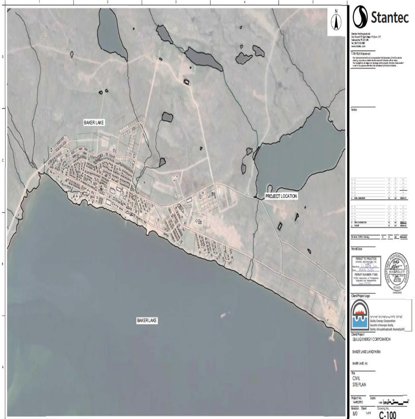
Baker Lake Proposed landfarm location above