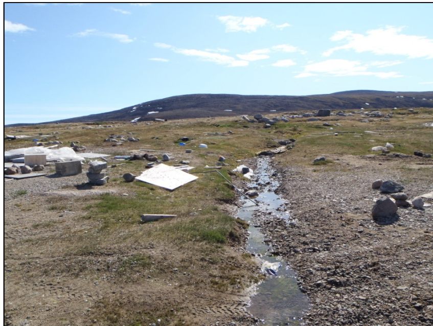
Photo 7: Drainage channel #2 from ATV trail location in July 2011; east aspect.