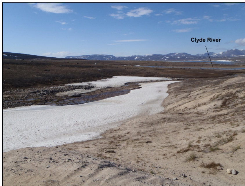
Photo 17: Watercourse adjacent to potential borrow sources deposits 1, 2 and 3 in July 2011; southwest aspect with Clyde River in the background.