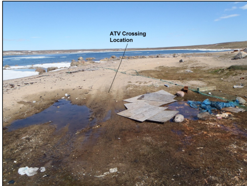
Photo 8: ATV crossing location at drainage channel #2 in July 2011; north aspect.