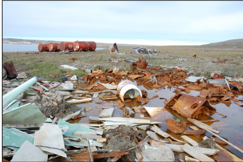
Photo 20: Ponded surface water at the Site Dump located at the Old Town Site; north aspect.