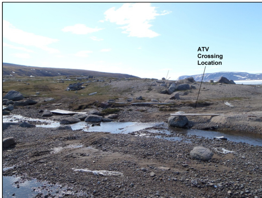
Photo 5: ATV crossing location at drainage channel #1 in July 2011; south aspect.