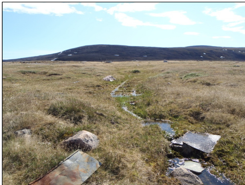
Photo 11: Drainage channel #3 from ATV trail location in July 2011; east aspect.