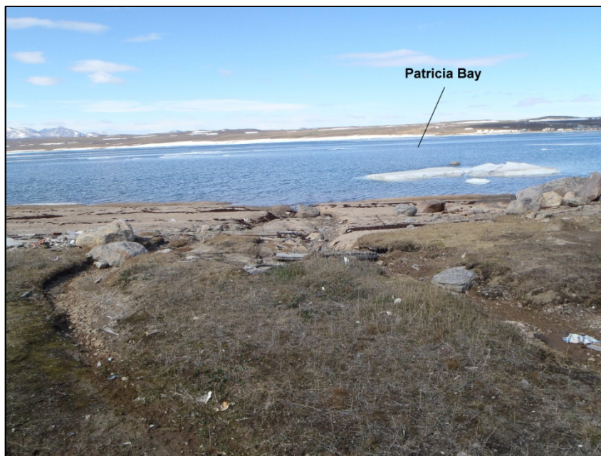
Photo 15: Drainage channel #4 from ATV trail location in July 2011; west aspect.