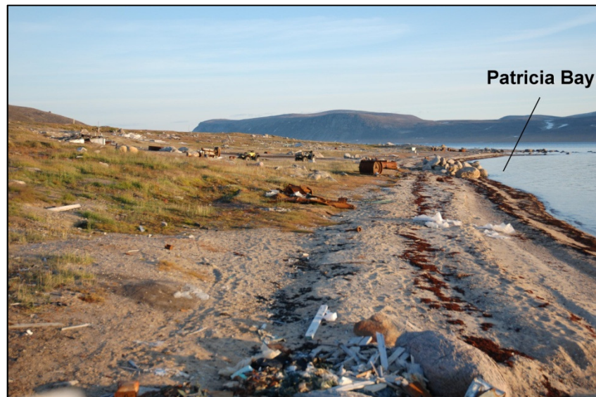
Photo 19: Nearshore area at the Old Town Site in August 2010; south aspect.