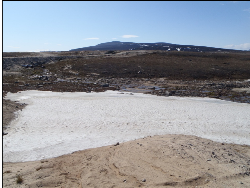
Photo 16: Watercourse adjacent to potential borrow sources deposits 1, 2 and 3 in July 2011; east aspect.