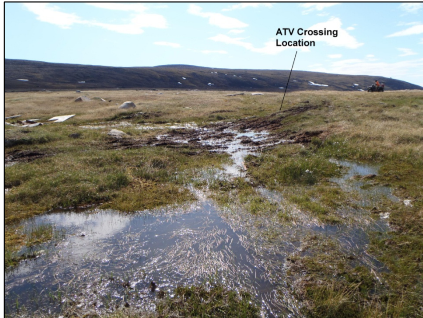
Photo 12: ATV crossing location at drainage channel #2 in July 2011; southeast aspect.