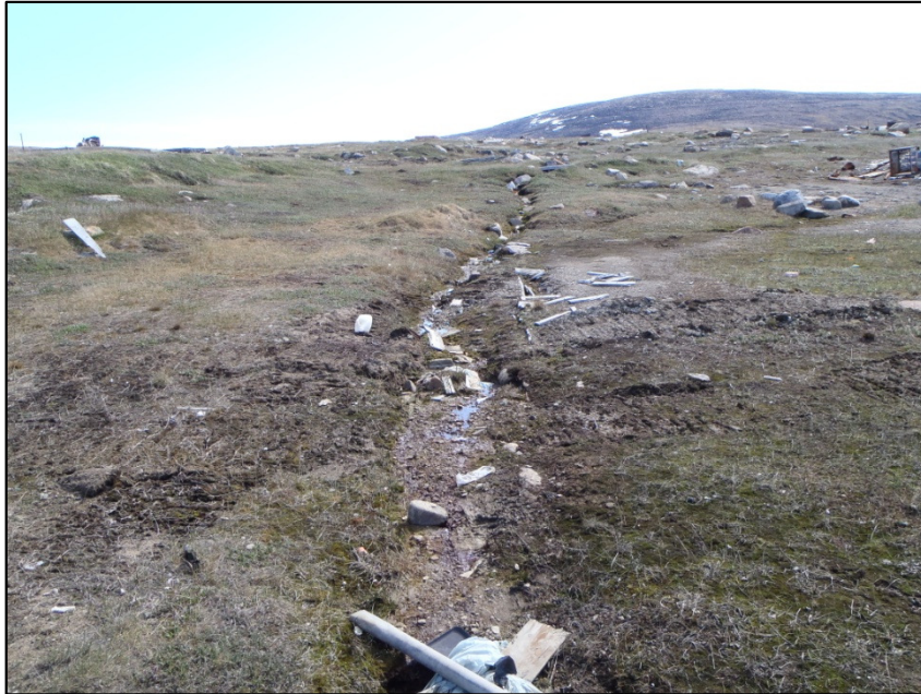
Photo 14: ATV crossing location at drainage channel #4 in July 2011; east aspect.