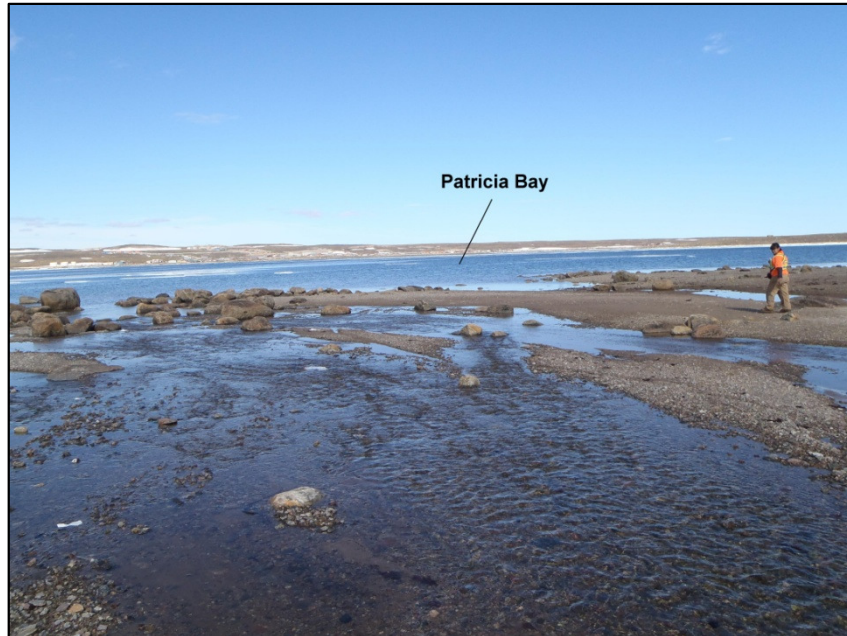
Photo 6: Drainage channel #1 from ATV trail location in July 2011; west aspect.