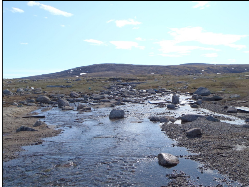
Photo 4: Drainage channel #1 from ATV trail location in July 2011; east aspect.