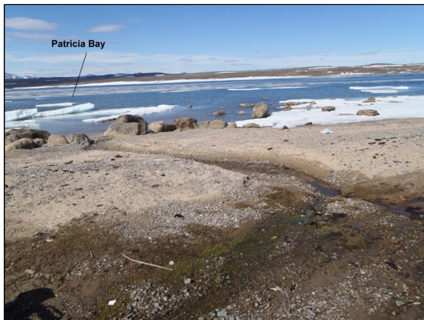
Photo 9: Drainage channel #2 from ATV trail location in July 2011; west aspect.