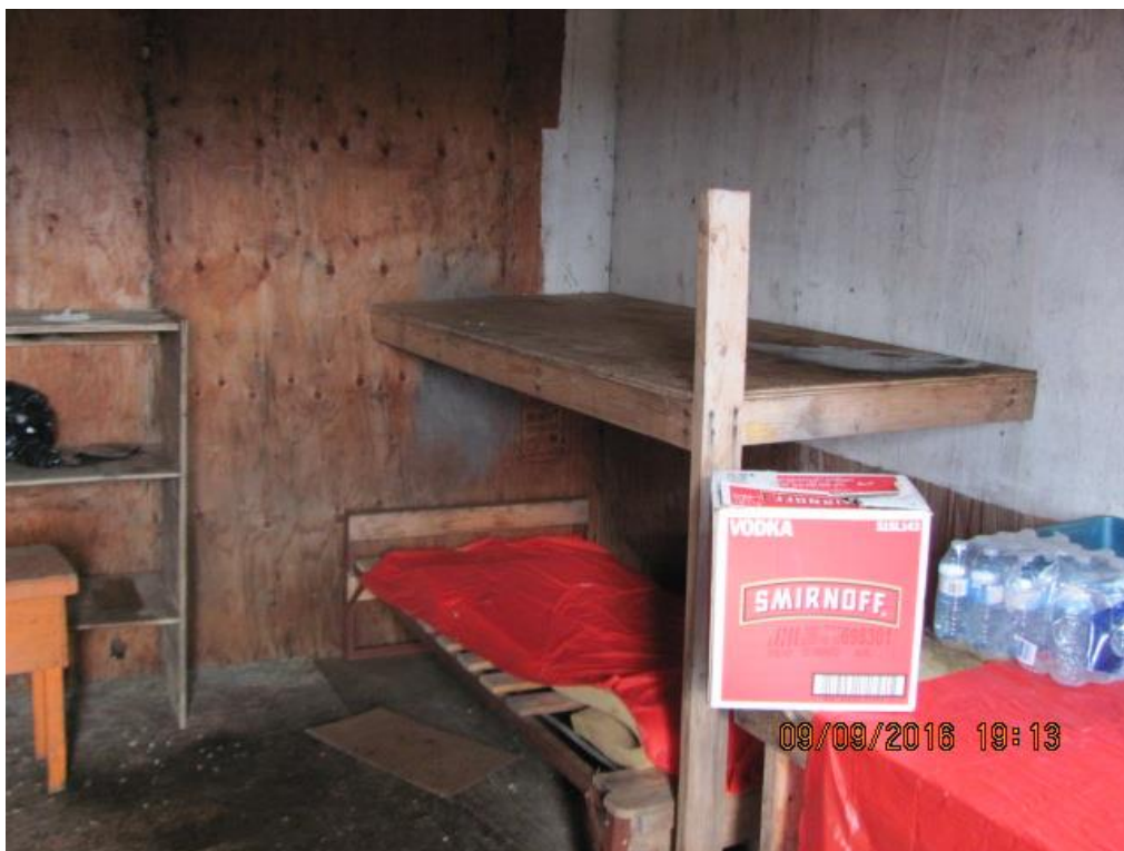
Photo 2: Cullaton Lake airstrip survival shelter condition on leaving the site September 9, 2016.