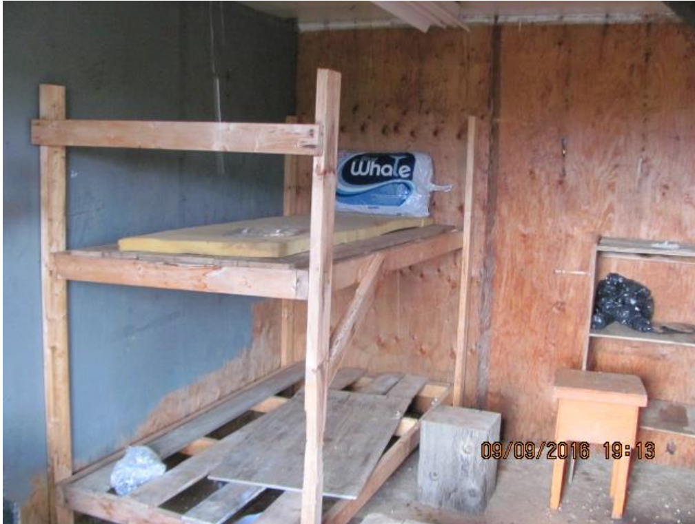
Photo 1: Cullaton Lake airstrip survival shelter condition on leaving the site September 9, 2016.