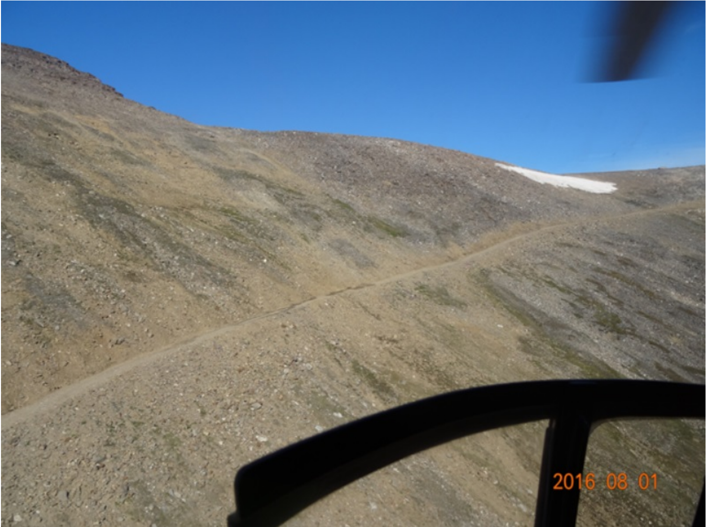
Figure 2 Durban Island. Road to upper site / summit