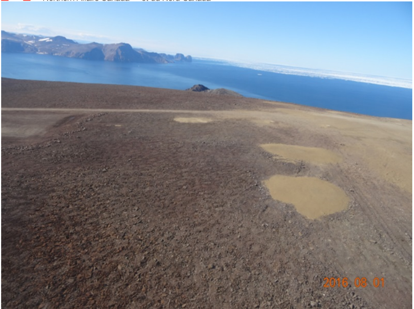
Figure 5 Durban Island Summit(3)