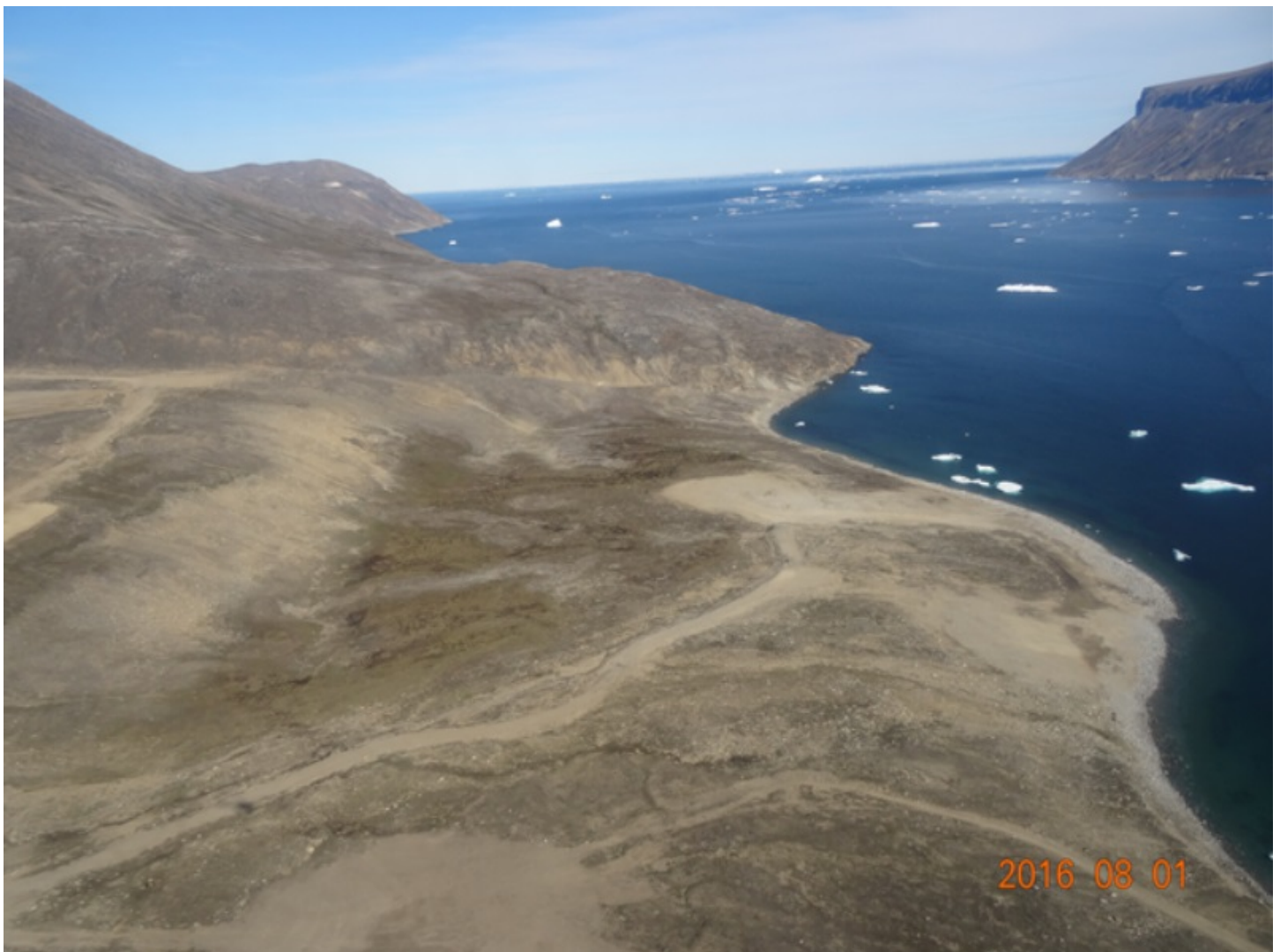
Figure 8 Durban Island - Lower site/ beachhead lay down