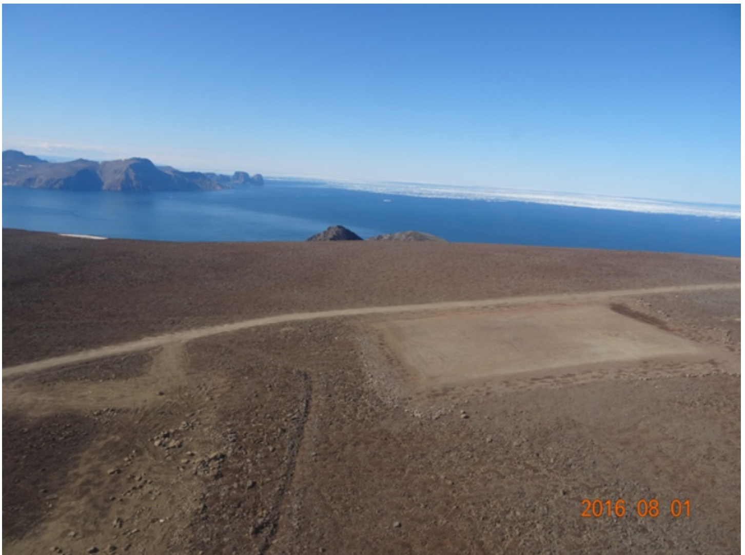
Figure 4 Durban Island Summit(2)