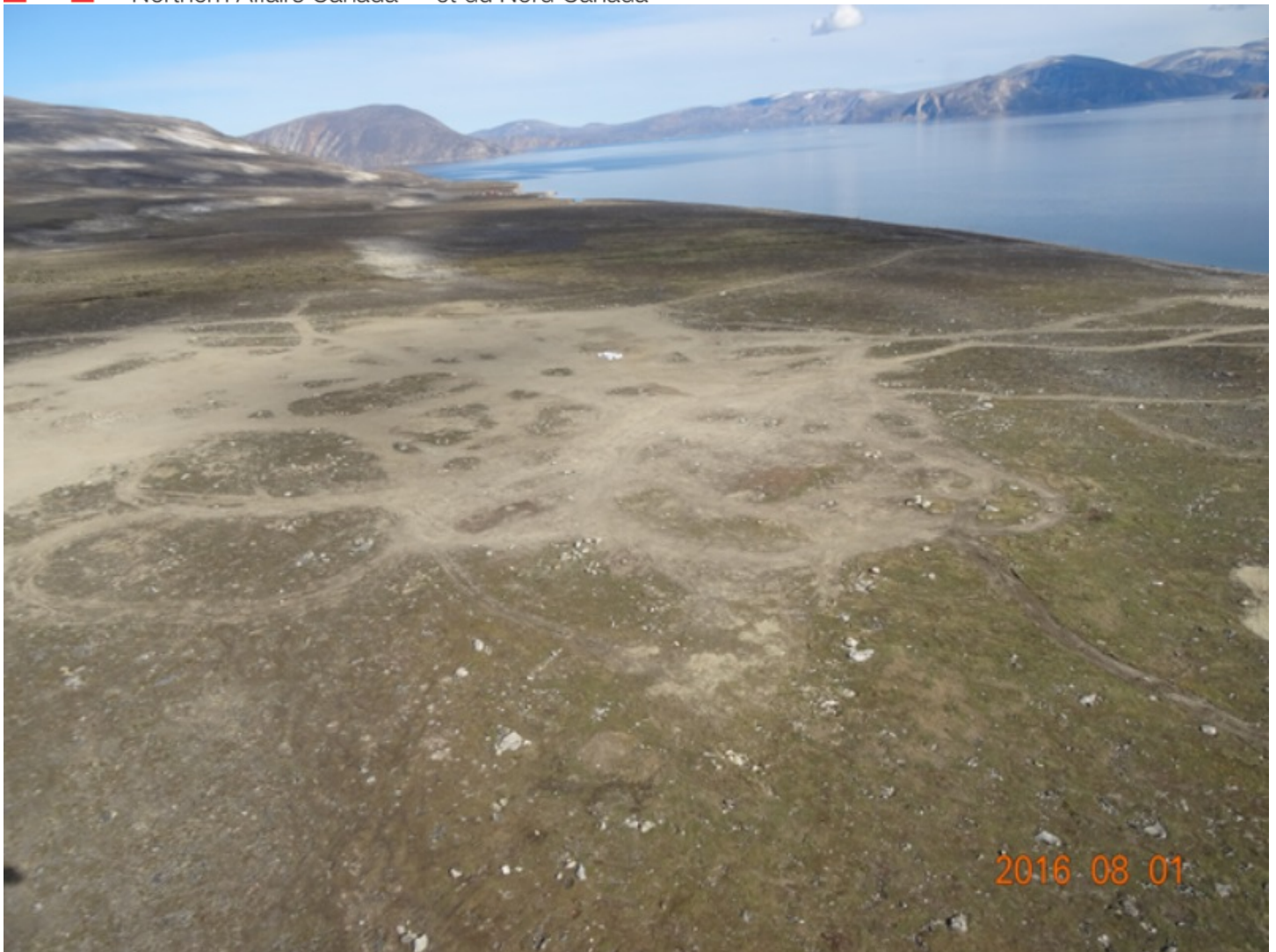
Figure 13 Padloping Island – Main camp – white bags of contaminated soils to be hauled off site.