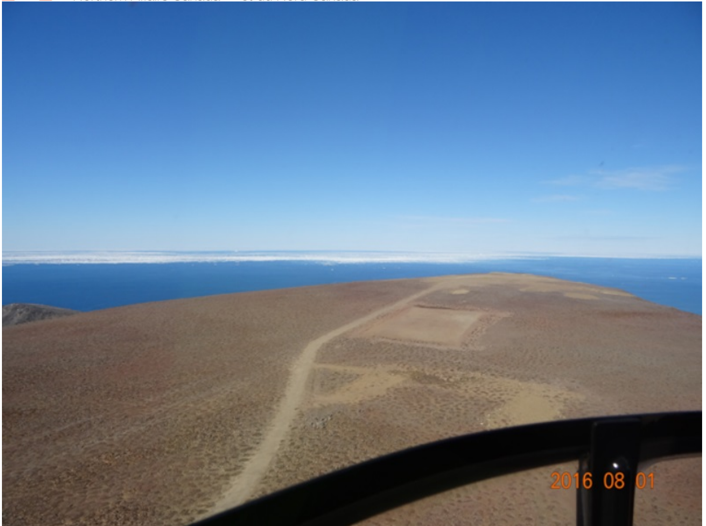
Figure 3 Durban Island Summit(1)