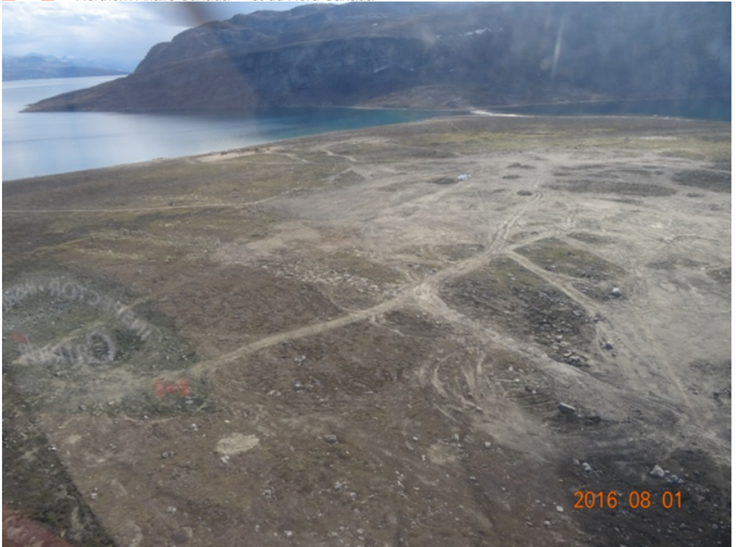
Figure 11 Padloping Island Main camp