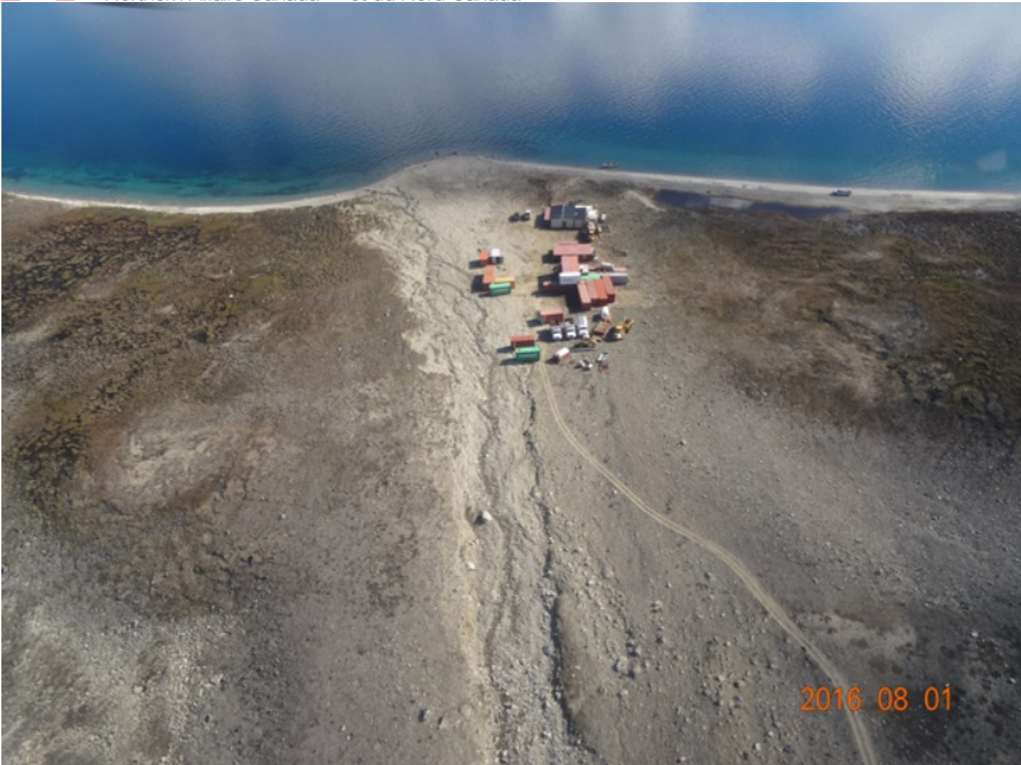
Figure 9 Padloping Island - Beach head and consolidated camp and facilities