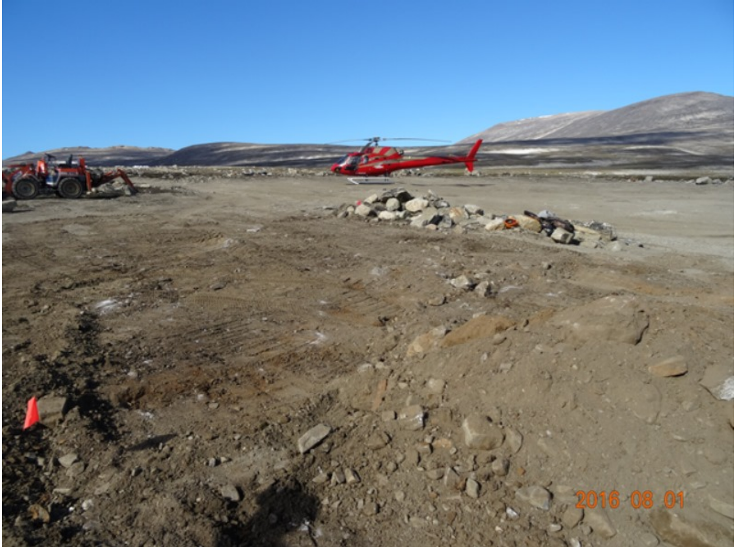
Figure 17 Padloping island final clean up