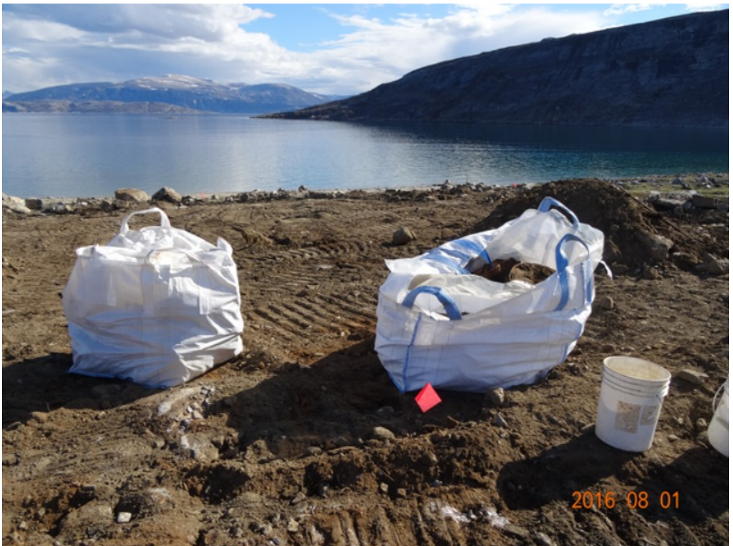
Figure 18 Padloping island - bags of metal debris