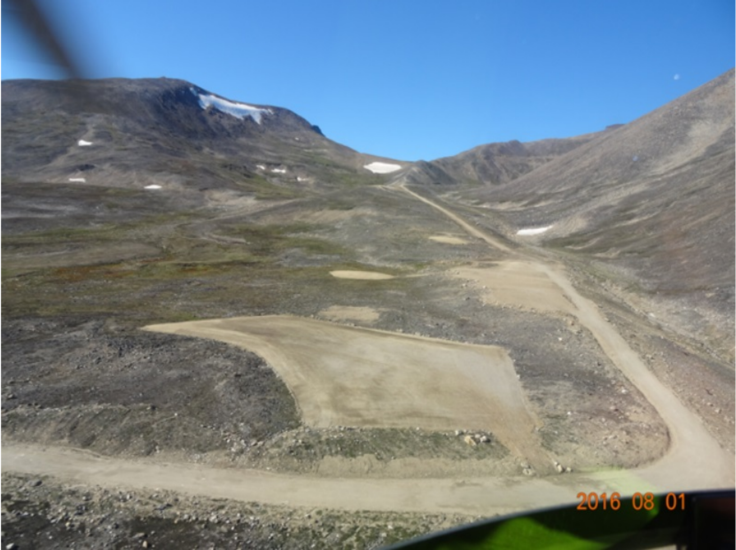
Figure 1 Durban Island - Lower site - Fuel tank pads reclaimed