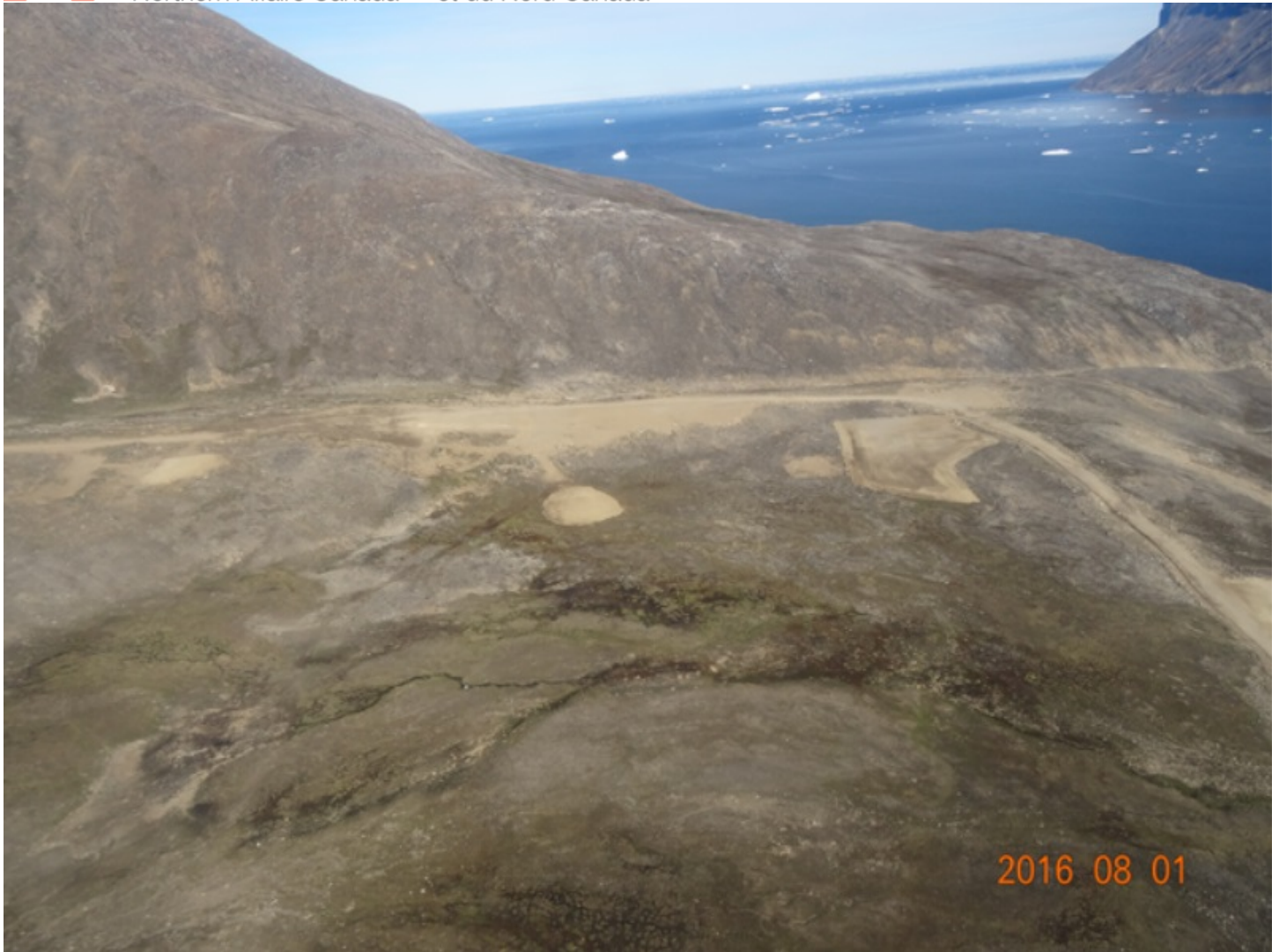
Figure 7 Duban Island - Road between upper and lower sites. note reclaimed borrows.