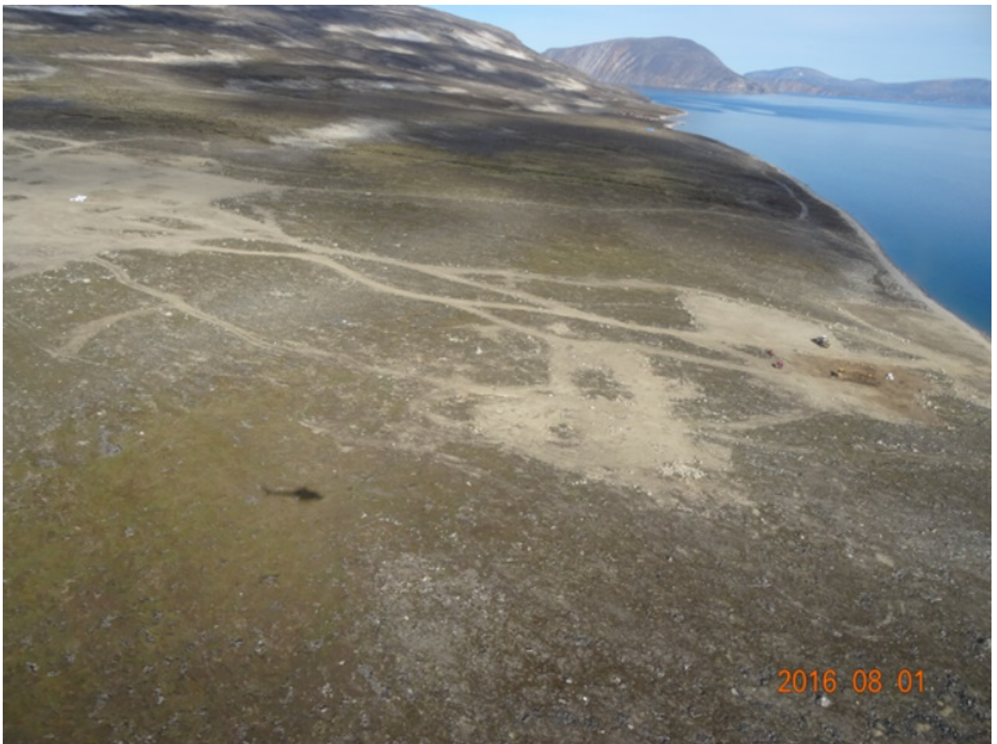
Figure 14 Padloping Island - Main camp on Left and old town site on right