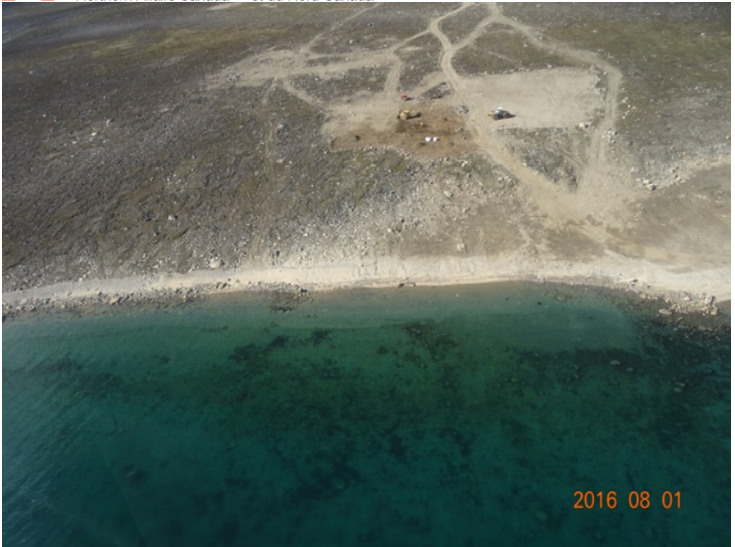
Figure 15 Padloping iland lower town site