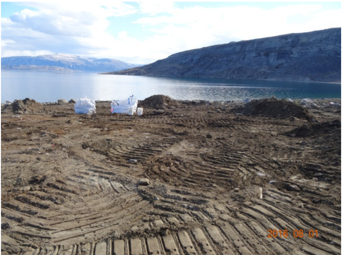
Figure 16 Clean up . last stages - metal debris is collected into bags for transport off site