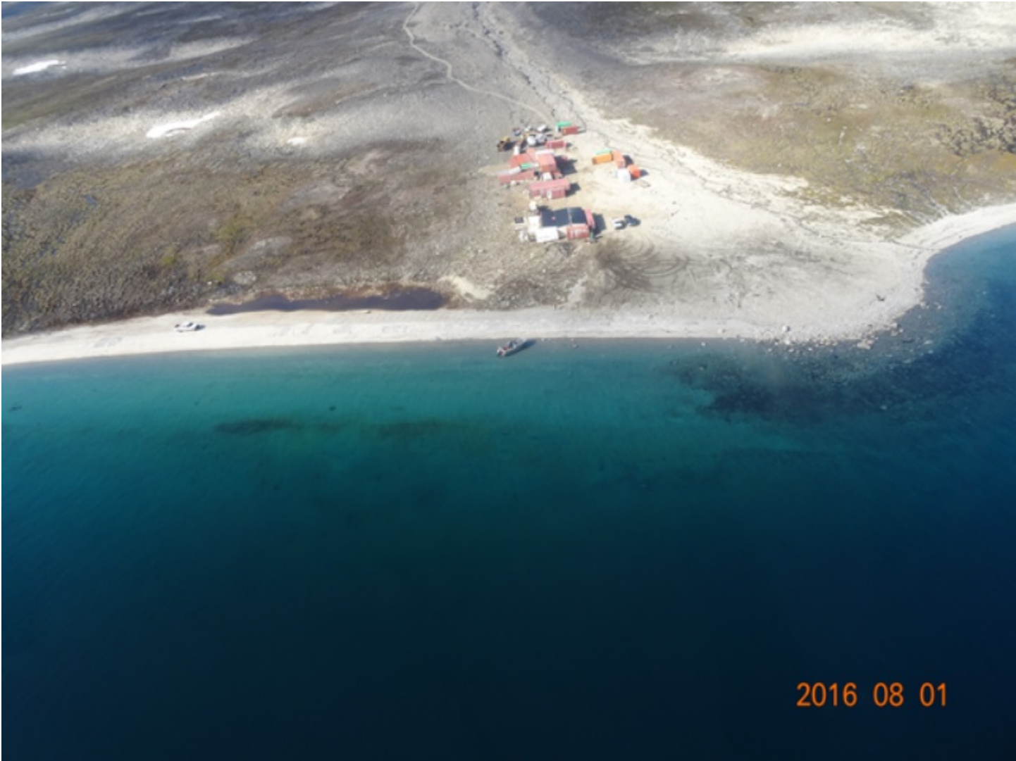
Figure 10 Padloping Island - Camp and Local Boat