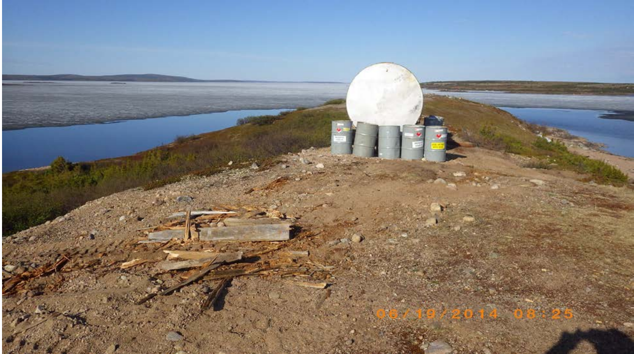
Photo 10: APEC 6 demolished. APEC 4, Tank 5, present with drums of fuel emptied from the tank and pipeline (June 19, 2014).