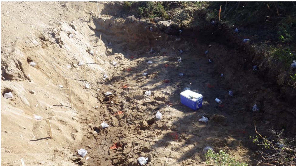
Photo 16: Looking east at the excavation of APEC 8.2 (July 3, 2014).