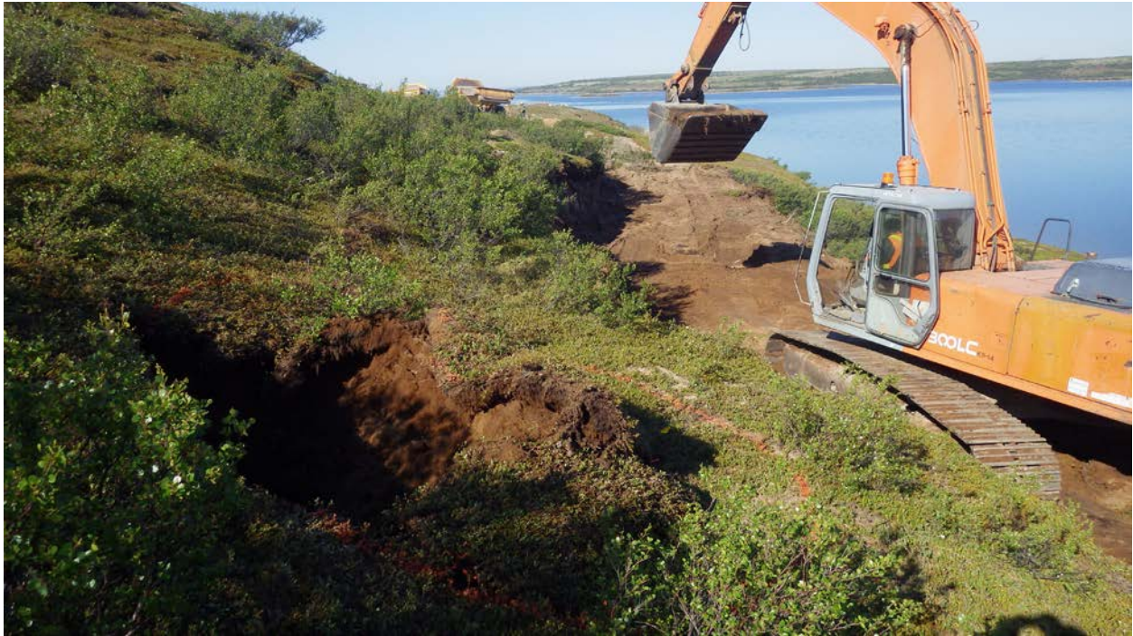
Photo 13: Looking southwest at APEC 8.1, excavation of stained soil from pipeline (June 26, 2014).