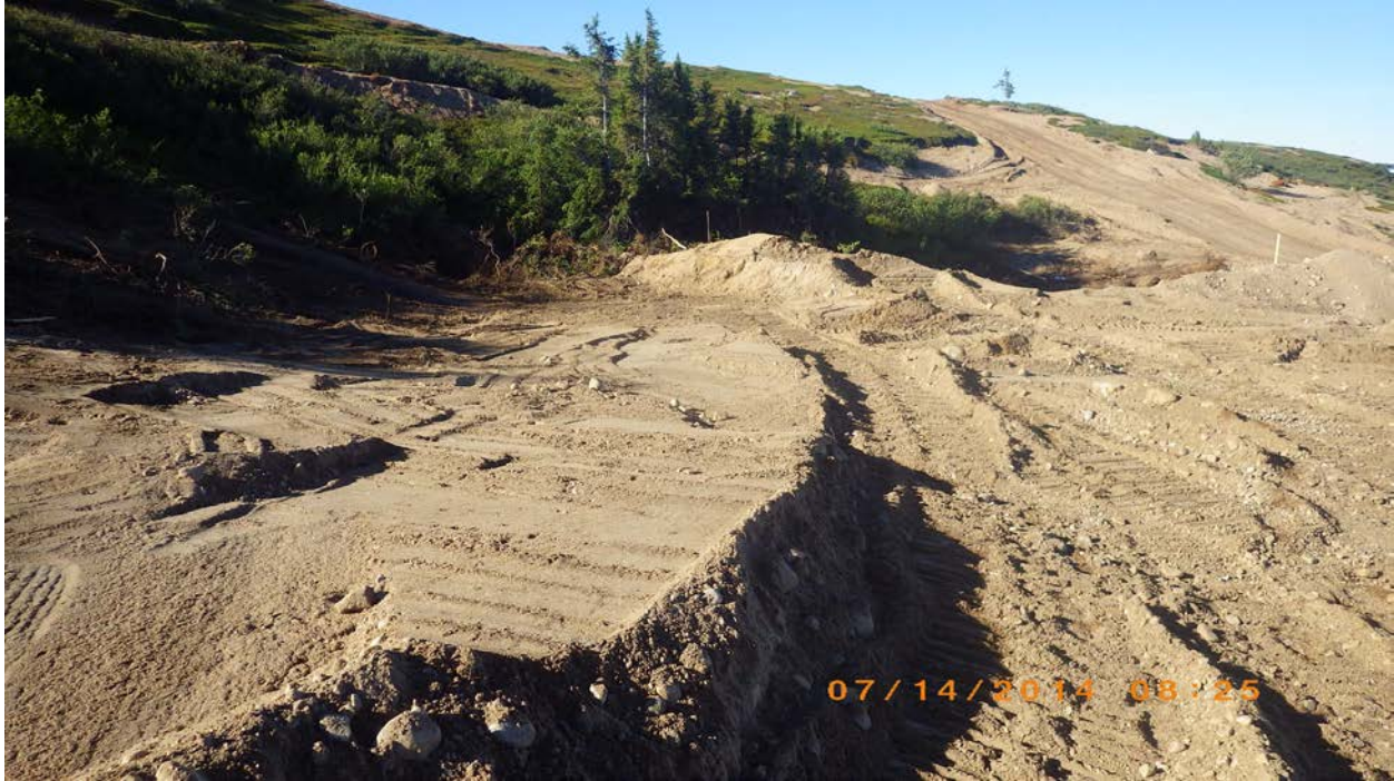
Photo 3: Looking southwest over backfilled APEC 1. Backfilled APEC 8.2 is present in the background (July 14, 2014).