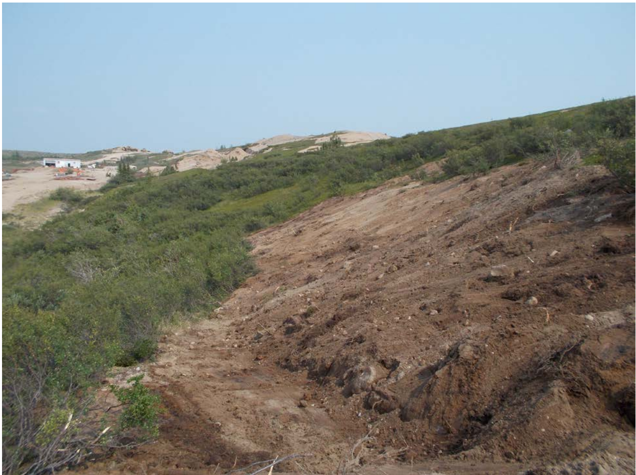
Photo 14: Looking northeast at the backfilled and re-graded APEC 8.1 excavation and road (July 30, 2014).