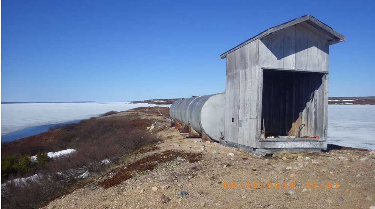
Photo 5: Looking southwest at APEC 6, the small building, and APEC 4 (Tank 5) behind it (June 10, 2014).