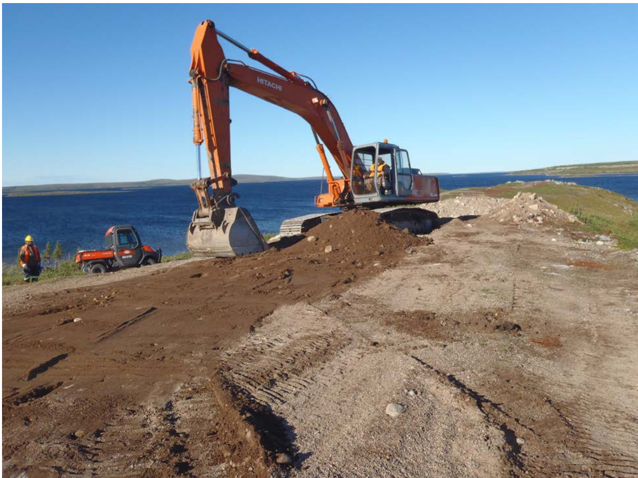
Photo 6: Looking southwest across re-graded APEC 2 and APEC 4 excavations.