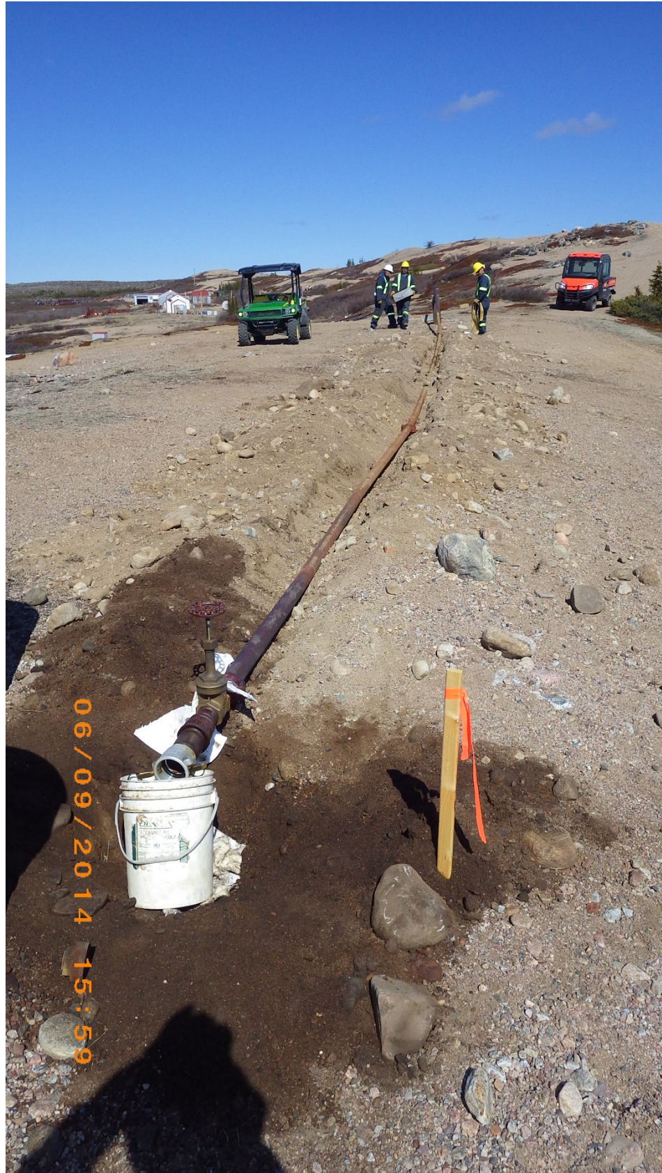
Photo 4: Looking northeast from stained area APEC 2 along the overland pipeline (APEC 8). The main site can be seen in the top left corner (June 9, 2014).