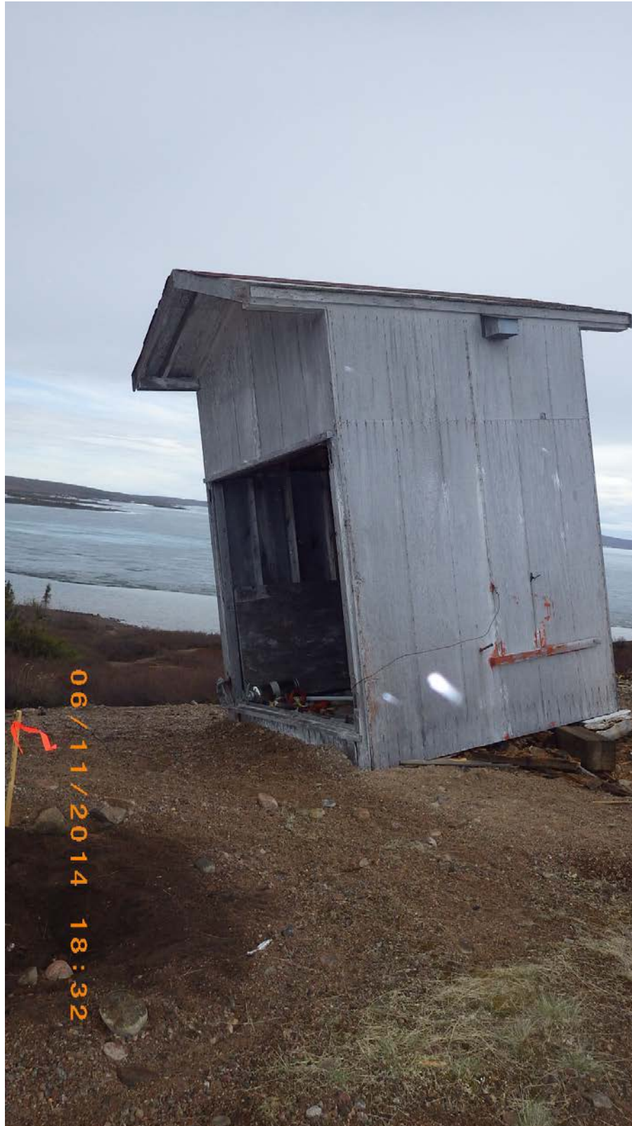
Photo 9: APEC 6 in place between APEC 2 and APEC 4 (June 11, 2014).