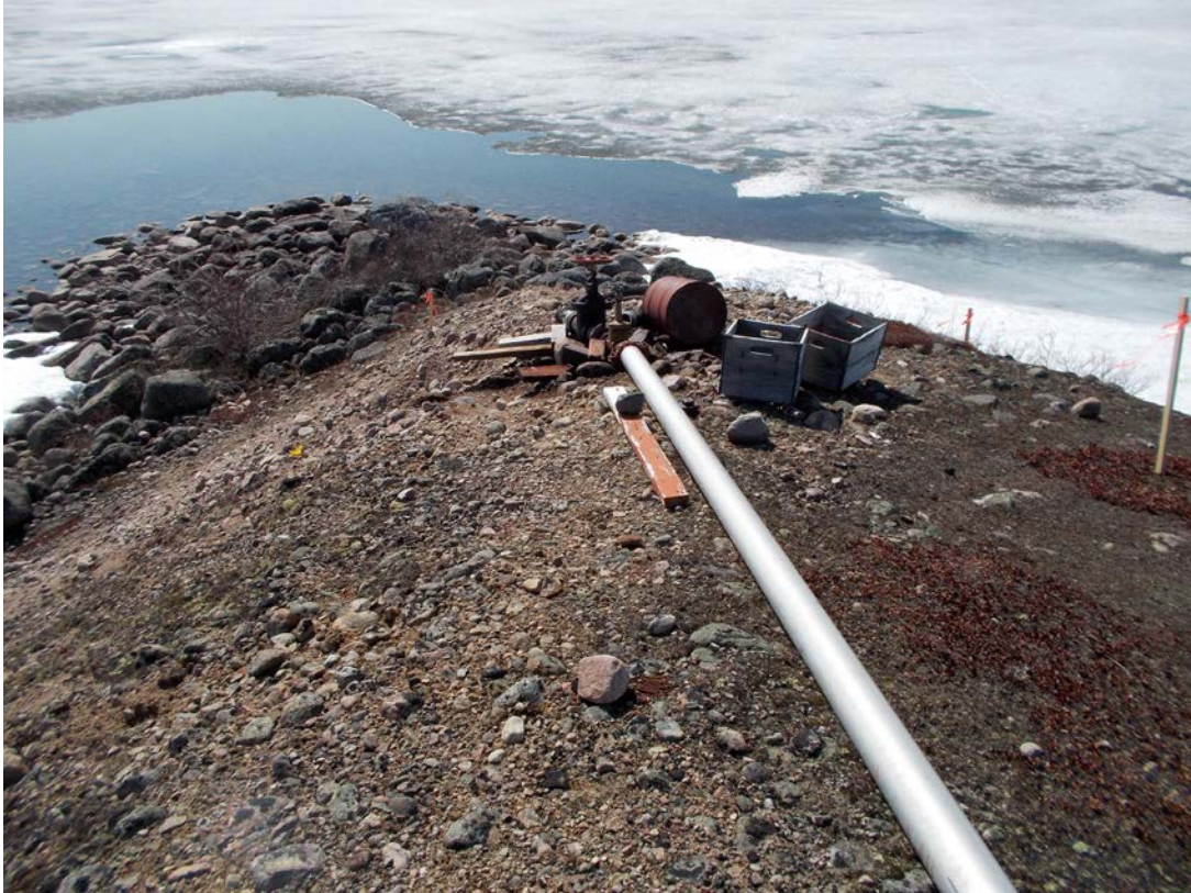
Photo 7: Looking southwest at the end of the overland pipeline at APEC 3 (June 3, 2014).