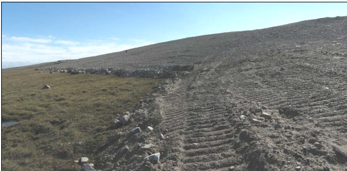
Photograph STA-6. Looking SSE along E slope. Slope appears stable. ↑