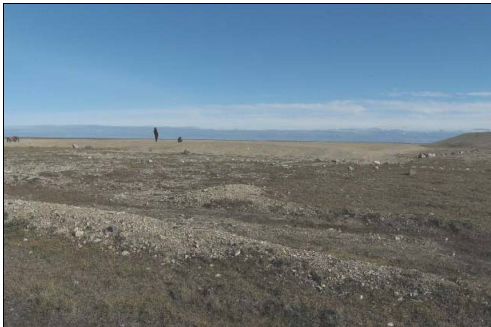
Photograph STA-10. Looking E to NW corner of the small SW cell of the Station Landfill. Granular cover appears stable. Honda parked adjacent to main cell on the extreme left of the photo. Tier II landfill (NE corner) visible in the background. ↑