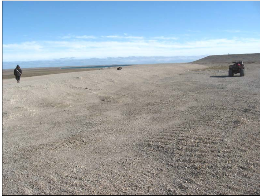
Photograph STA-9. Looking SSE along W side of the main cell of the Station landfill to the SW corner. Minor relief. Granular cover appears stable. ↑