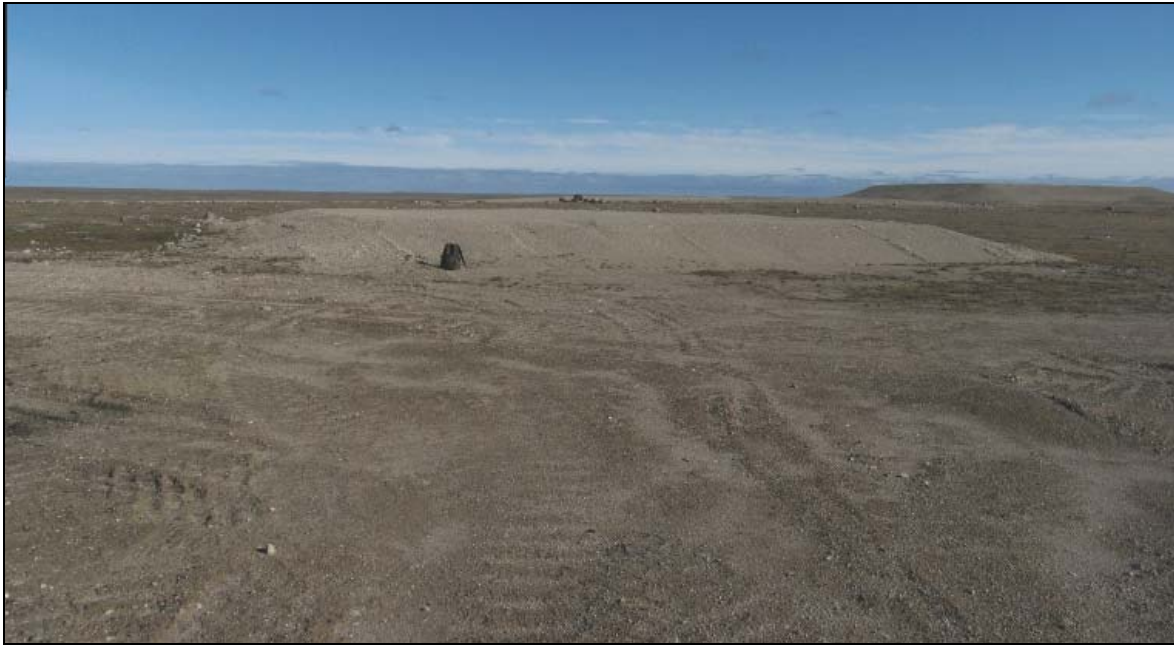
Photograph STA-13. Looking SE to the NW corner of the SE most of the two small landfill cells. Granular cover appears stable. No features of note. ↑