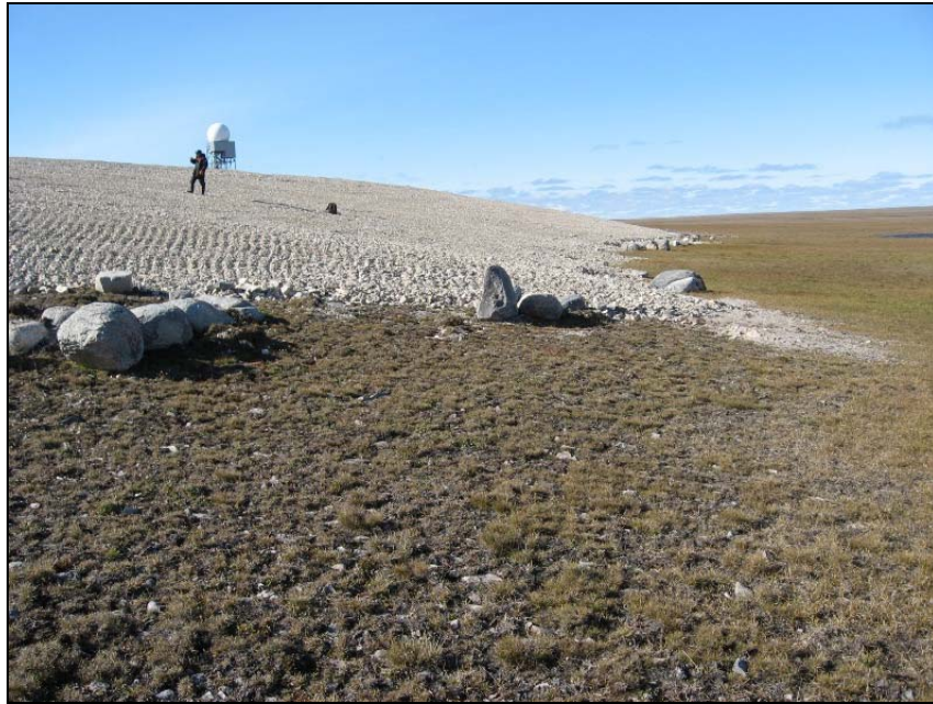
Photograph STA-5. Looking NNW along E slope of landfill looking to the NE corner of the main landfill cell. ↑