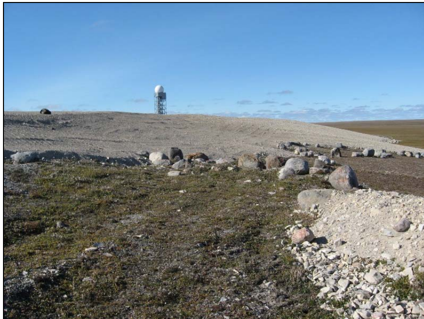
Photograph STA-2. Looking NNW along E toe of main landfill cell.