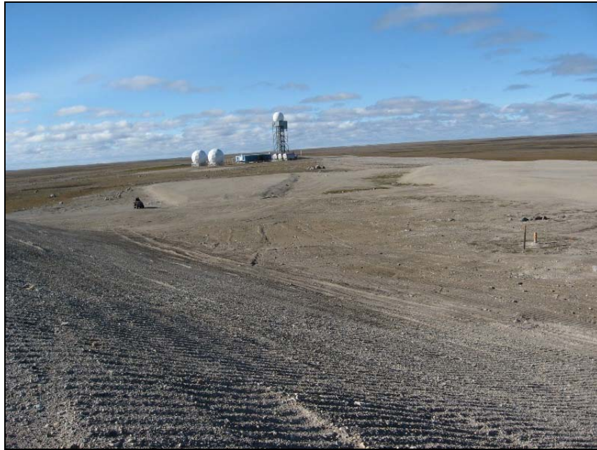
Photograph STA-15. Looking NNW from top of Tier II to the 3 cells to the west of the main Station Landfill cell. Standing on crest at NE corner of Tier II. ↑