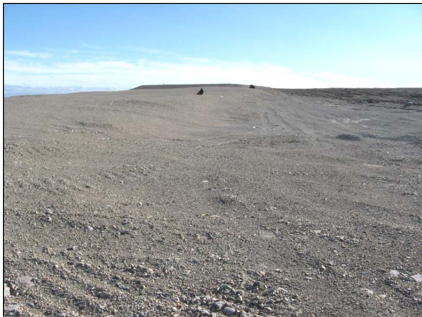
Photograph STA-8. Looking S from the NW corner of the main landfill cell along W side. ↑