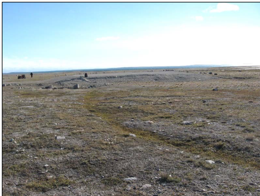
Photograph STA-14. Looking S to the NE corner of the NW most of the 2 small cells. Granular cover appears stable. No features of note. ↑