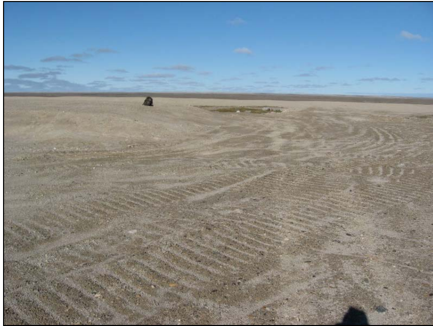
Photograph STA-11. Looking NE to the SW corner of small SW cell. Main Station Landfill cell is visible in the background. ↑