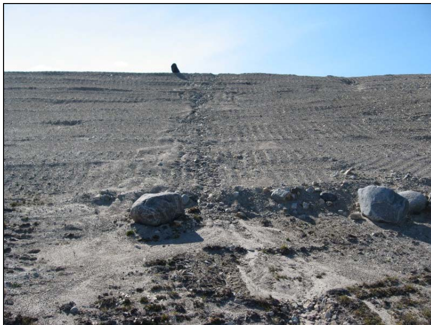
Photograph STA-4. Looking upslope to area of minor surficial erosion. Condition is essentially unchanged from last year. Granular cover is self-armouring. ↑