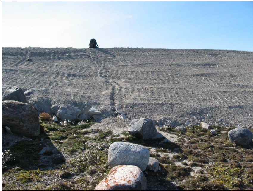
Photograph STA-3. Looking upslope to area of minor surficial erosion. Condition is essentially unchanged from last year. Granular cover is self-armouring. ↑