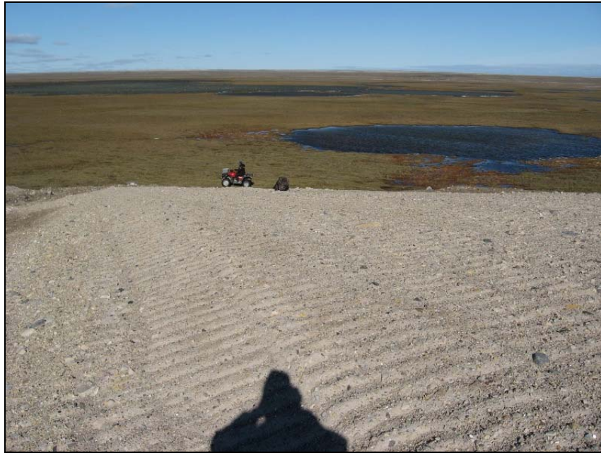
Photograph STA-7. Looking NE to NE toe of main landfill cell. Granular cover appears stable. No features of note. ↑