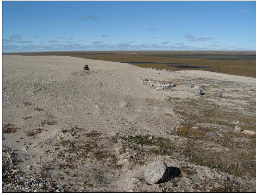
Photograph STA-1. Looking N from SE corner of main (larger eastern) landfill cell.