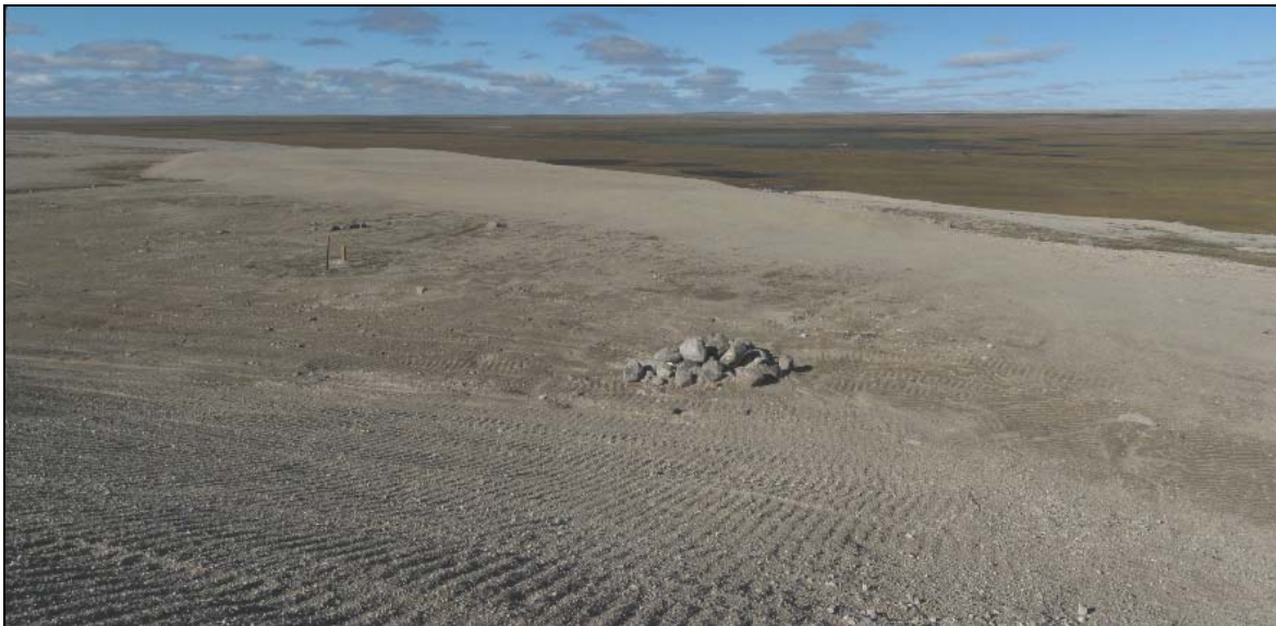
Photograph STA-16. Panoramic of the main Station Landfill cell looking N from the NE crest of the Tier II Landfill. ↑