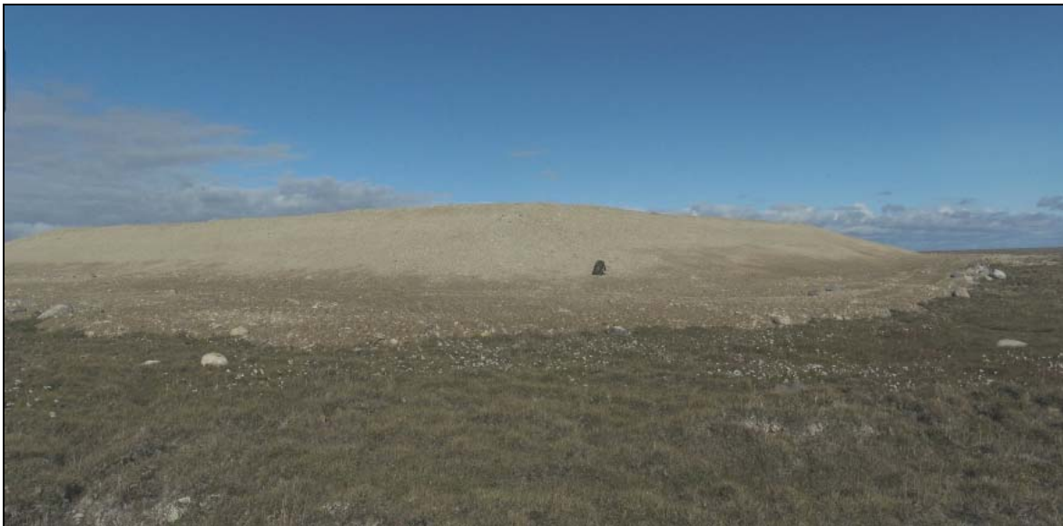
Photograph NH-6. Panoramic looking NE from adjacent to MW-8 looking to SW corner of LF. ↑