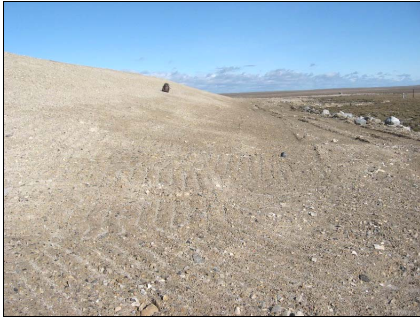
Photograph NH-7. Looking ENE along toe of S slope from SW corner of LF. Backpack located next to old in-filled crack. ↑