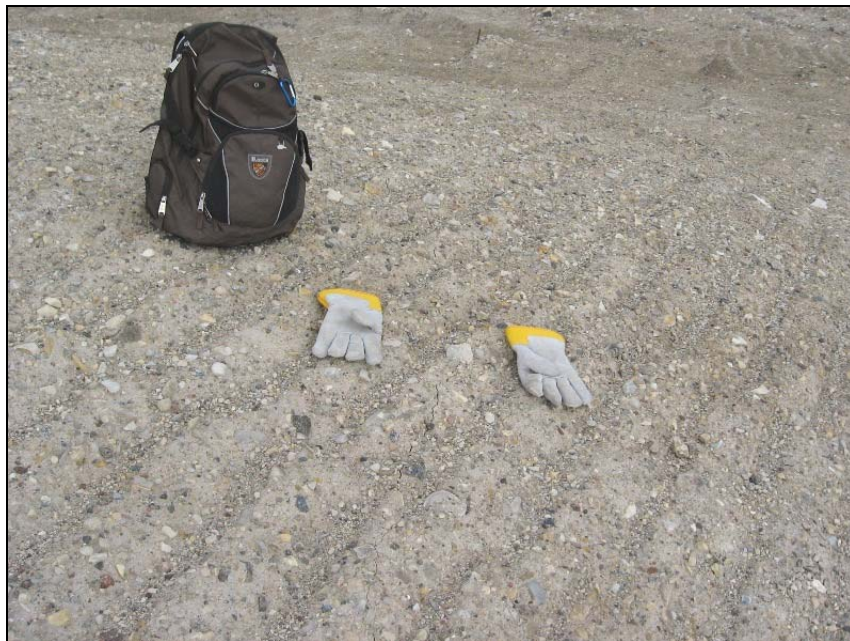
Photograph NH-14. Close-up, crack becomes narrow at SE corner. ↑