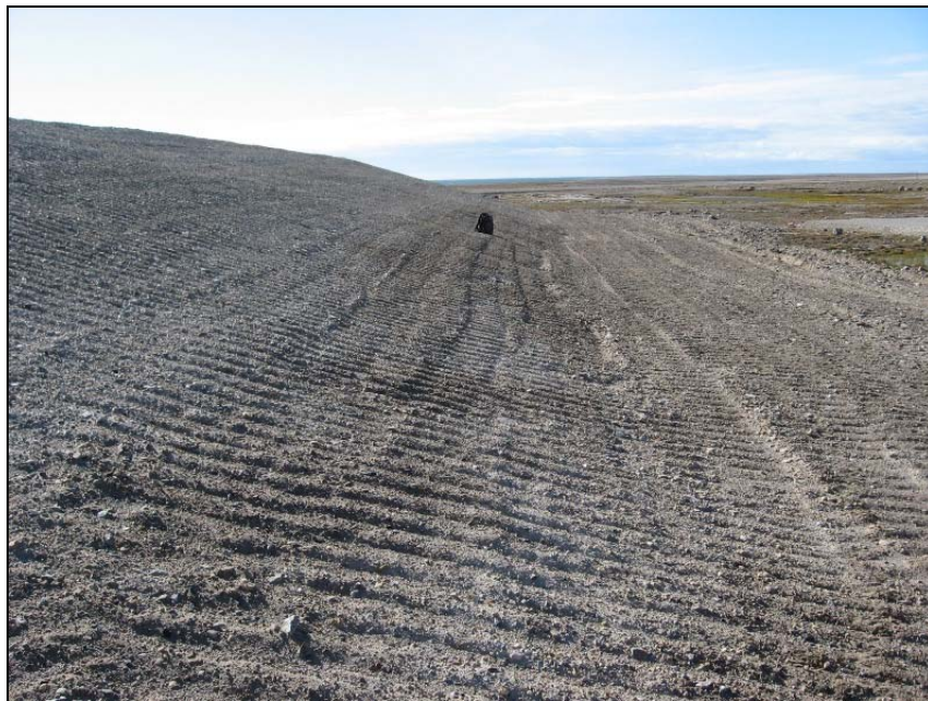
Photograph NH-2. Looking W along the toe of the N side of NE corner. ↑