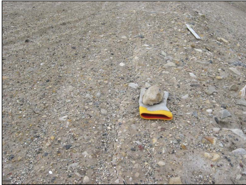
Photograph NH-17. Minor crack along crest (old) looking N. ↑