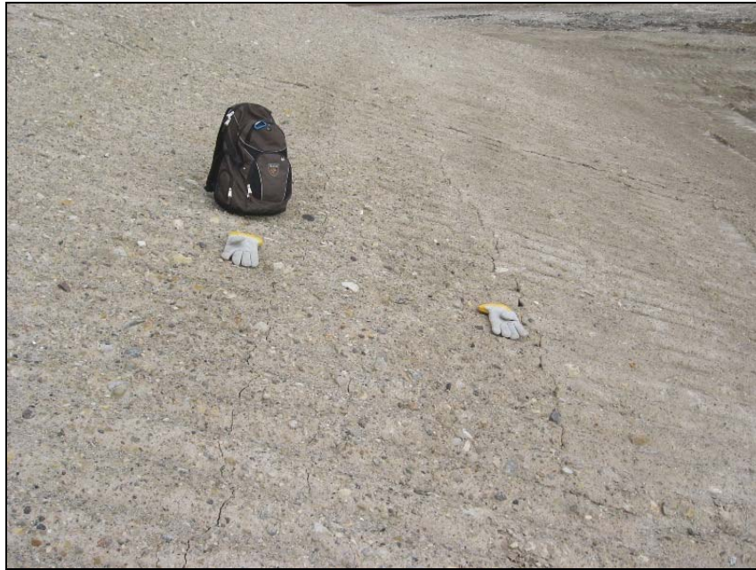
Photograph NH-13. Looking ENE at parallel cracks (old) approaching SE corner. Area of minor (self armoured) surficial erosion visible in background. Zone of erosion appears unchanged from the time of the 2007 inspection. ↑