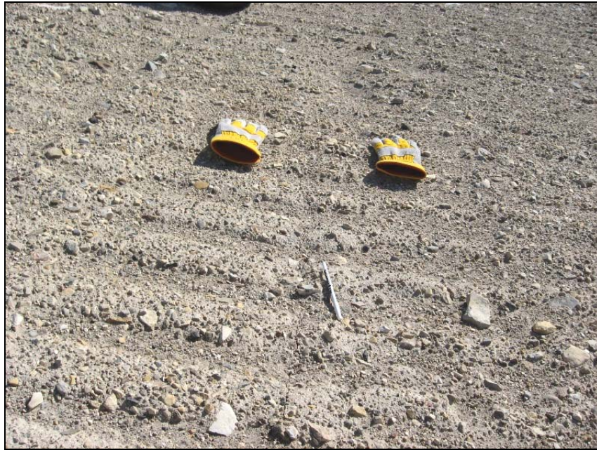
Photograph NH-9. Close-up of crack from last year, partially in-filled with no sign of recent movement (gloves and pen for scale). Splays and offset by up to 1m, always fine. ↑