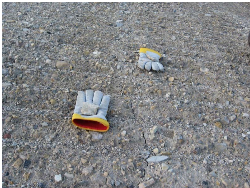
Photograph NH-22. Representative crack along E slope looking N. ↑