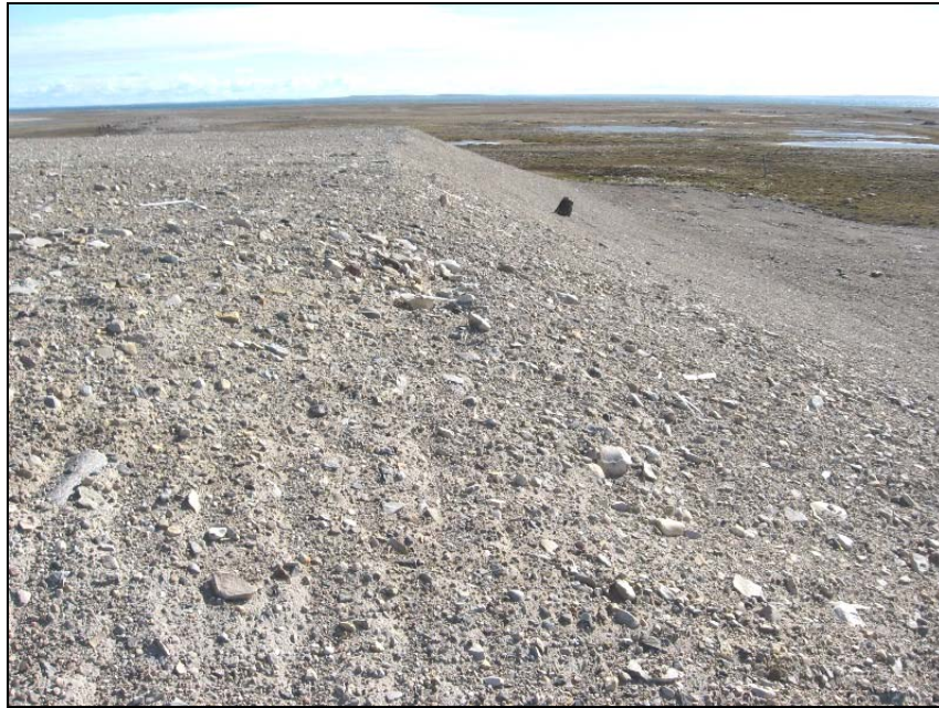
Photograph NH-5. Looking S along crest from NW corner. Fine cracks that were observed last year cannot be seen. ↑