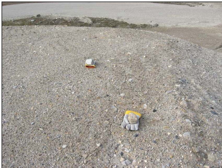
Photograph NH-20. Following crest crack to NE corner. Crack largely in-filled as it rounds corner. Faintly visible from about 30m W along N crest. ↑