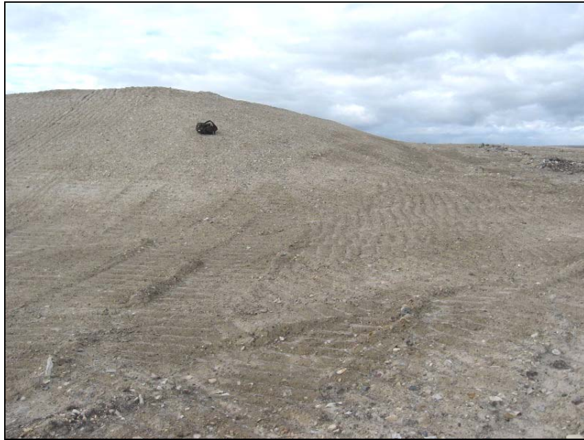
Photograph NH-15. Looking N along E toe from SE corner. ↑