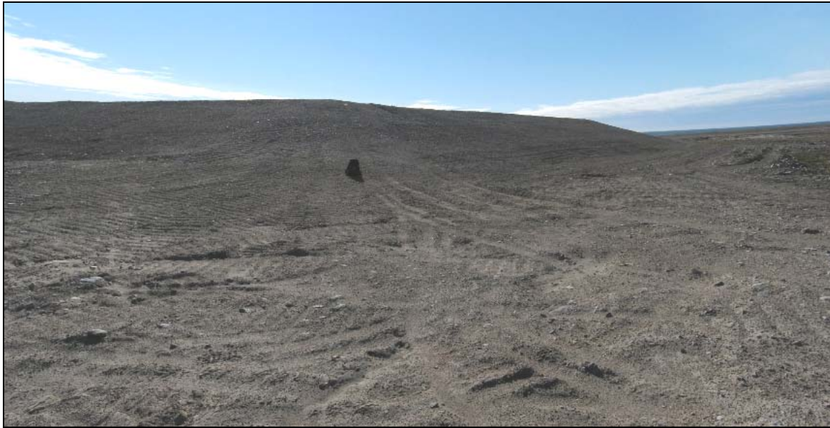
Photograph NH-1. Looking SW towards NE corner of Landfill. ↑