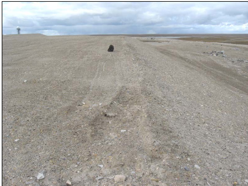
Photograph NH-16. Looking N along crest from SE corner. ↑