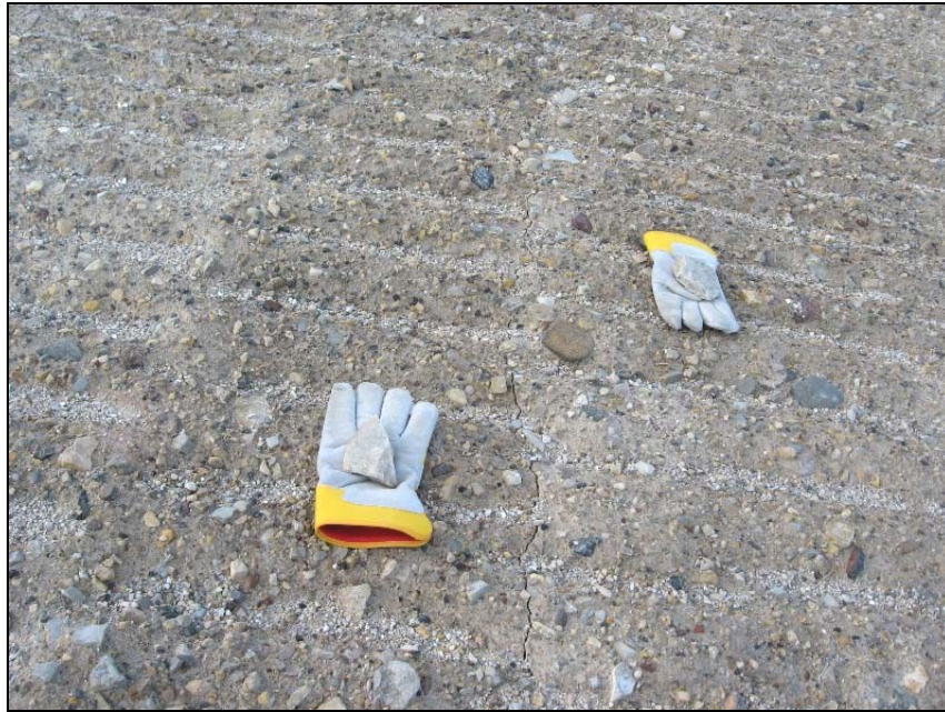
Photograph NH-23. Following crack on E slope looking N. ↑