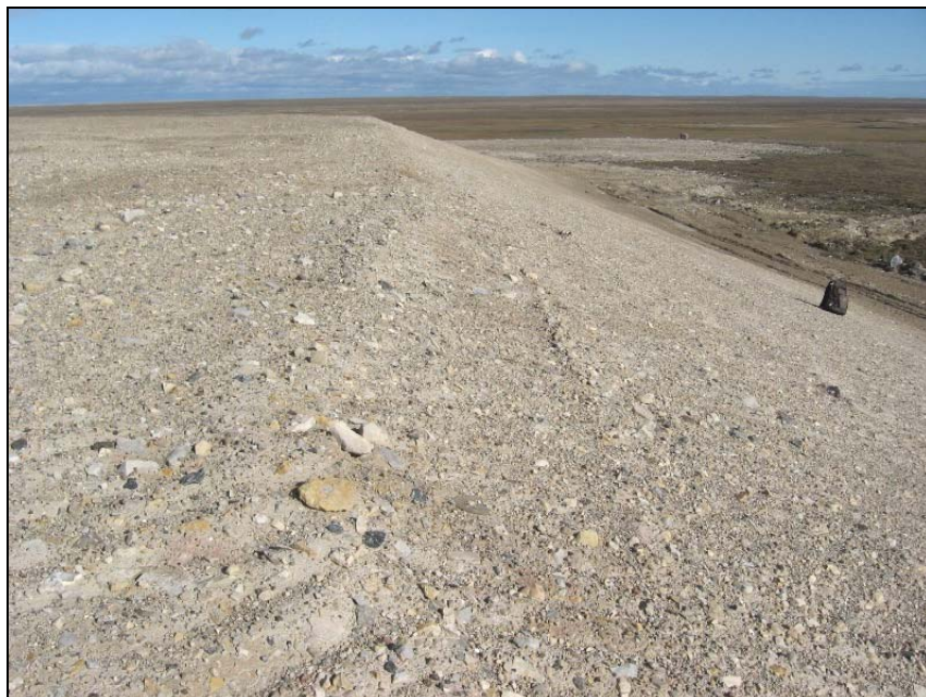
Photograph NH-8. Looking ENE along crest from SW top of LF. ↑