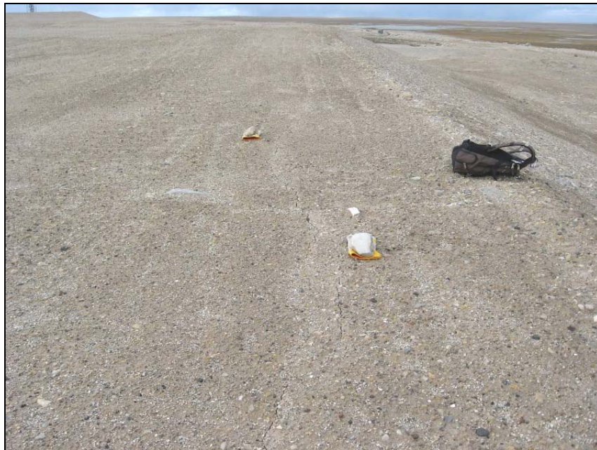
Photograph NH-18. Crack along E crest looking N. Similar to last year. Gloves on either side of crack. ↑