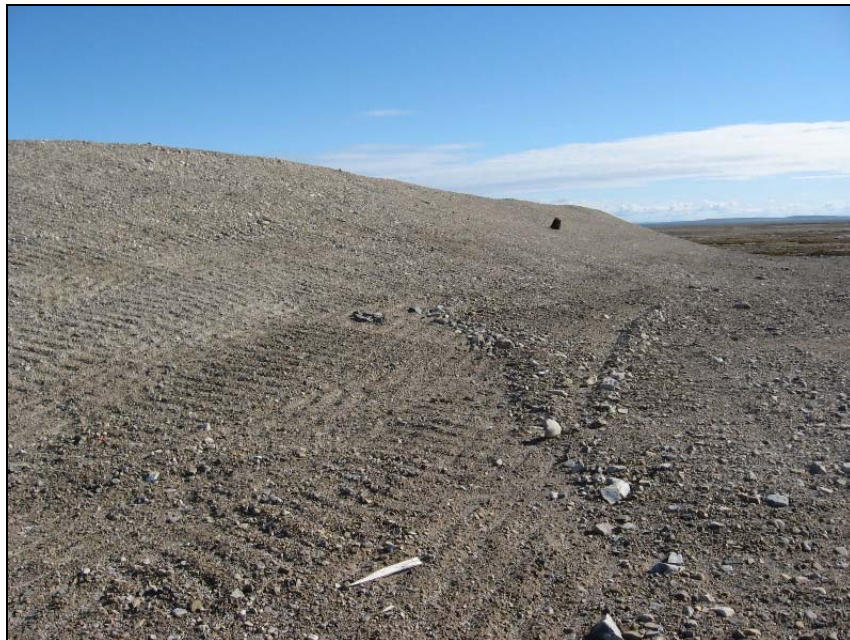
Photograph NH-4. Looking S along W side of LF from 10m NW of NW corner. ↑