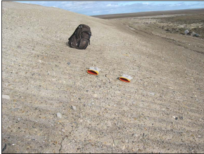
Photograph NH-11. Looking ENE along slope along old, partially in-filled crack (between gloves). ↑