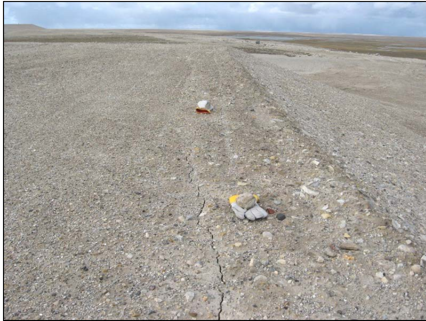
Photograph NH-19. Following crack on crest. Looking N approaching NE corner. ↑