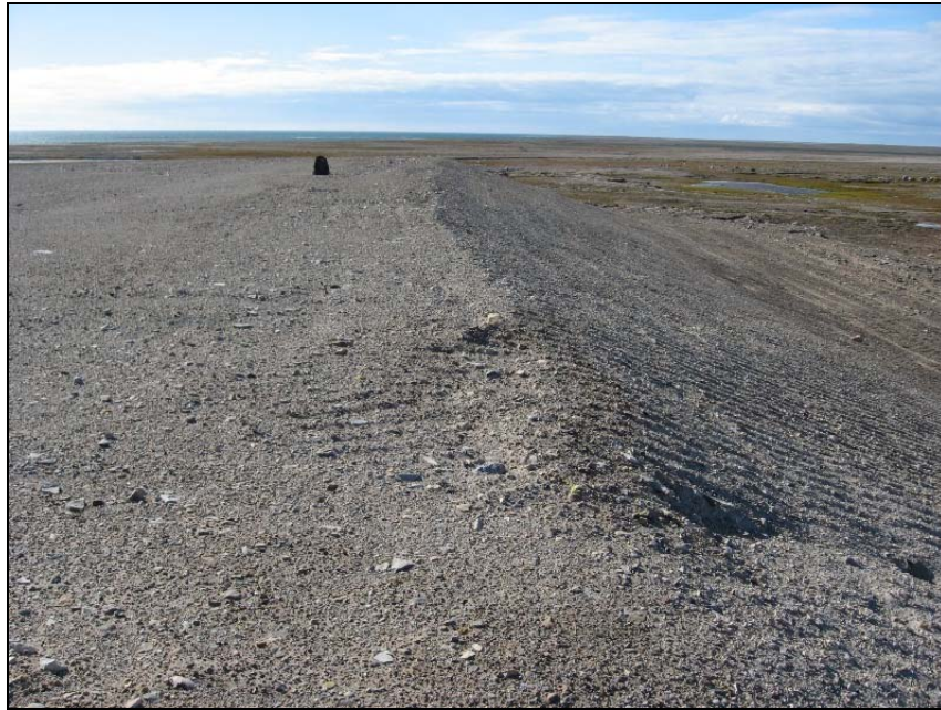
Photograph NH-3. Looking W along crest from NE corner. ↑