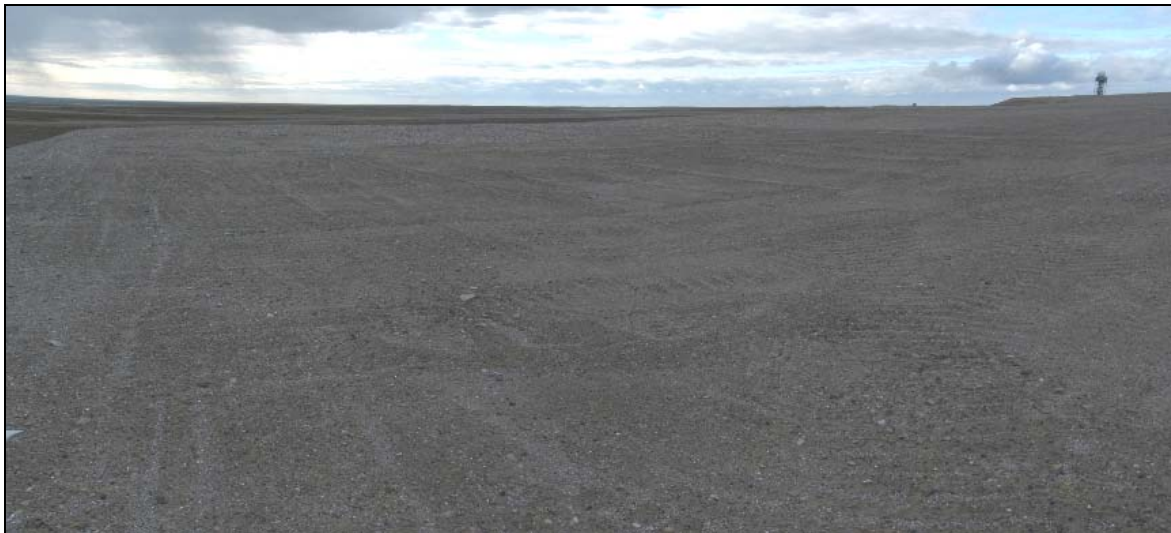
Photograph NH-24. Looking NW from SE corner scanning L to R. Note approaching snow! ↑