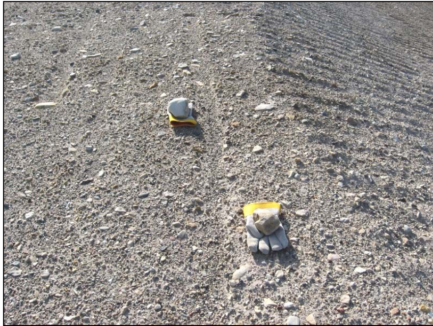
Photograph NH-21. Representative picture of crack as it rounds corner and turns W. Gloves for scale on either side of in-filled crack. ↑