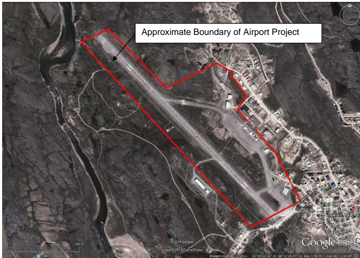
Figure 1: Site Plan Showing Locations of Site Works