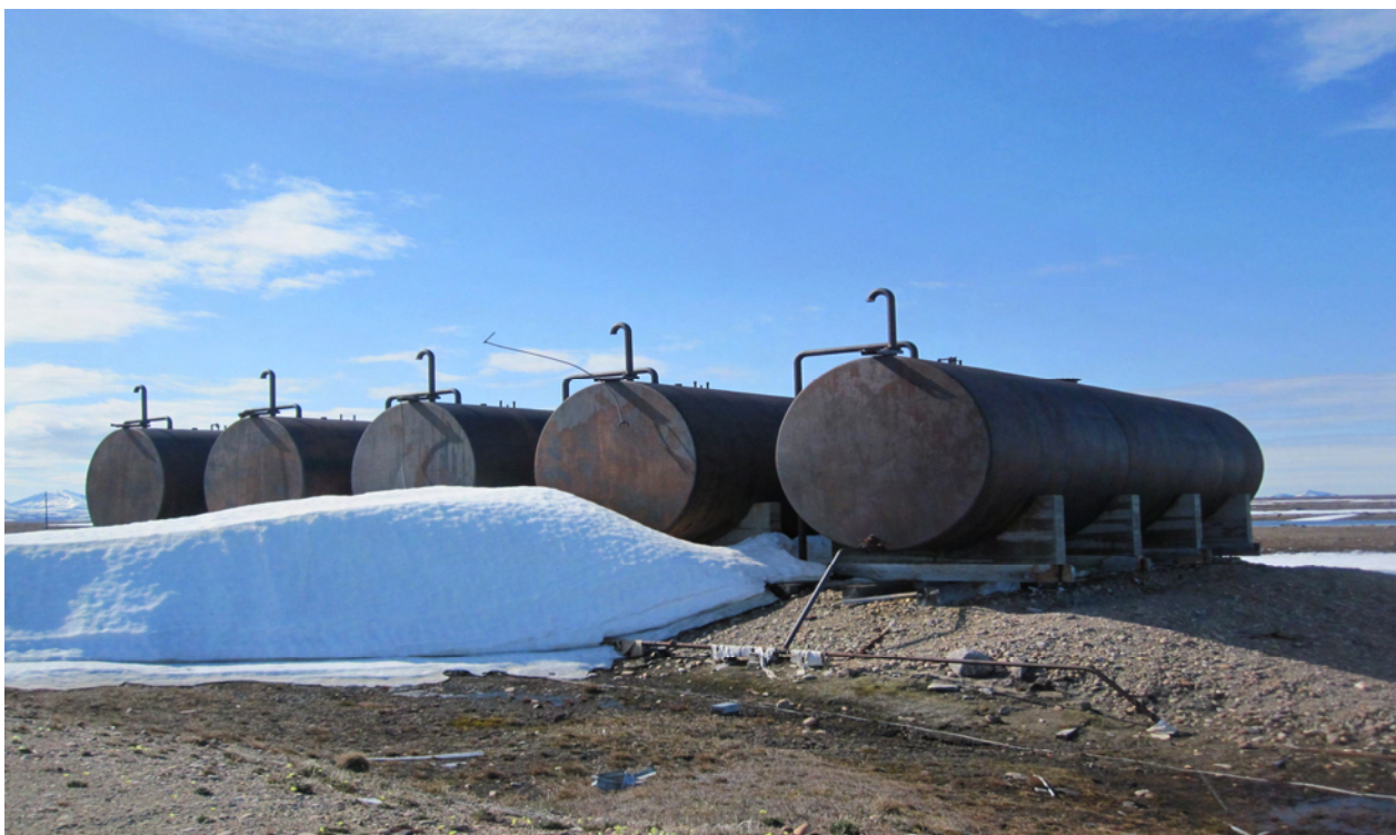
Main Station Area's Aboveground Storage Tanks (ASTs) (before Remediation)