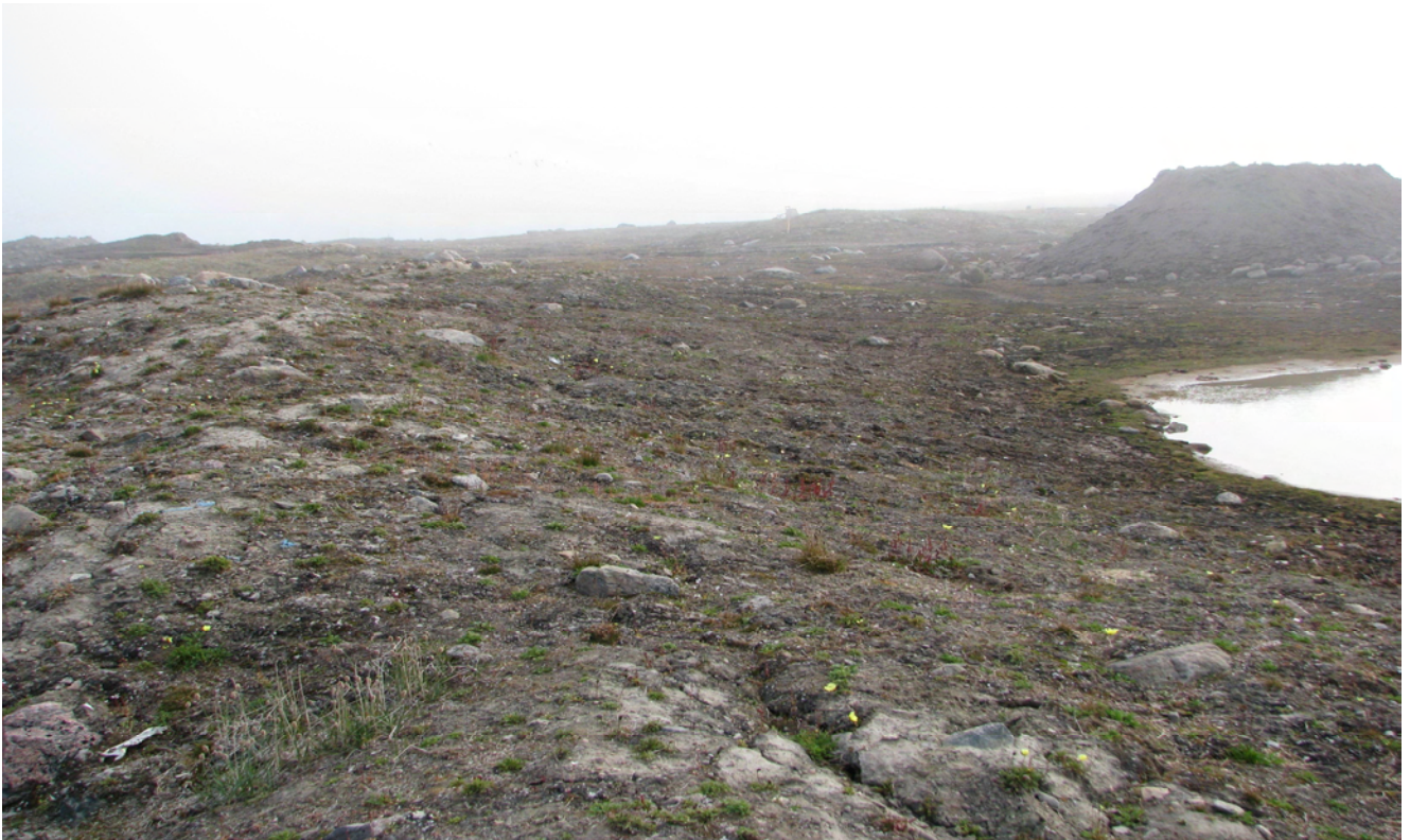
Debris Area # 6 (after remediation)