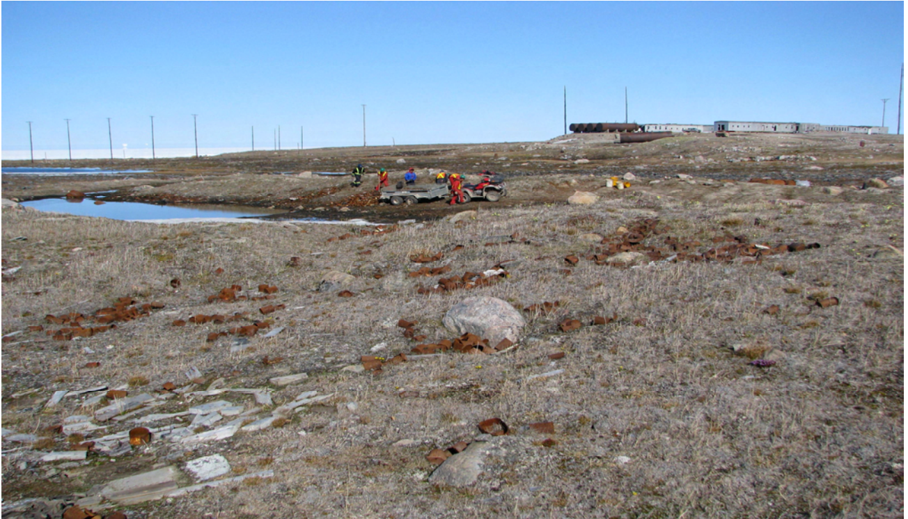
Debris Area # 6 (before/during remediation)