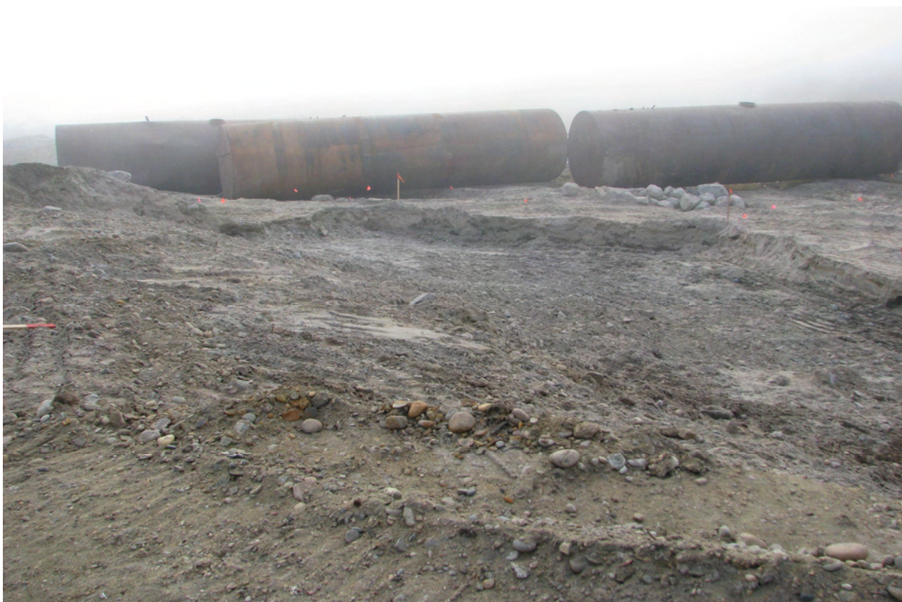
Main Station Area's ASTs (after Decommissioning) – Tanks will be cut and disposed off in Landfill