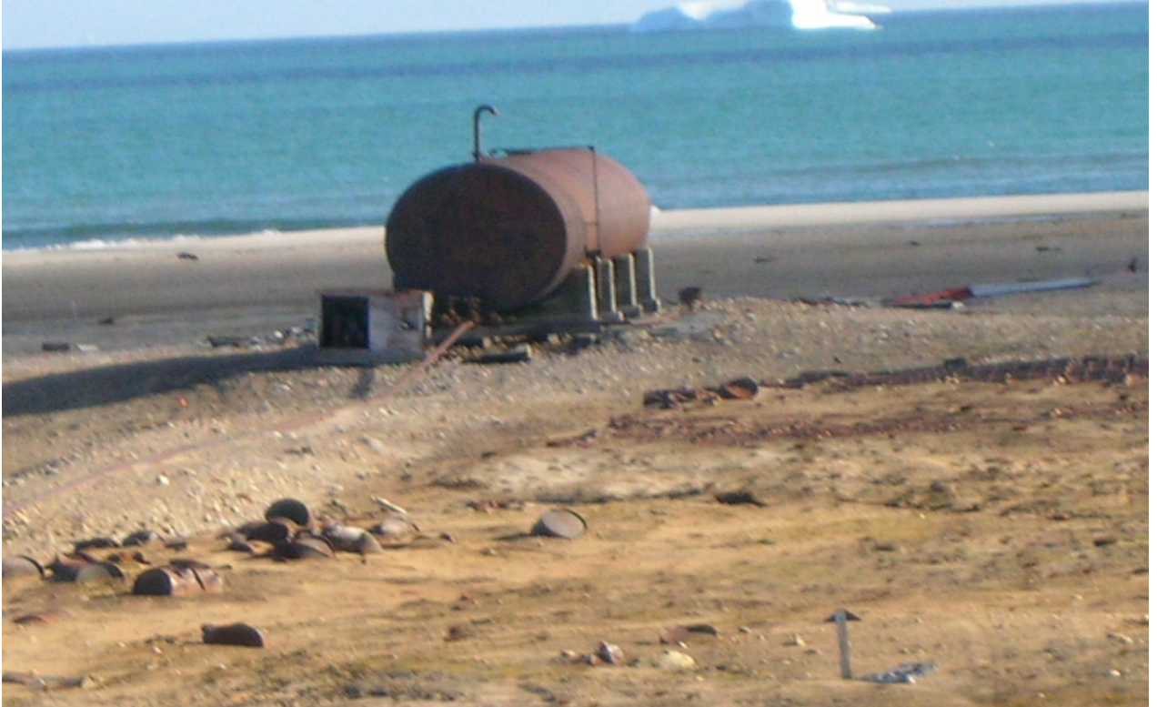
Worked Area # 1 (before remediation)