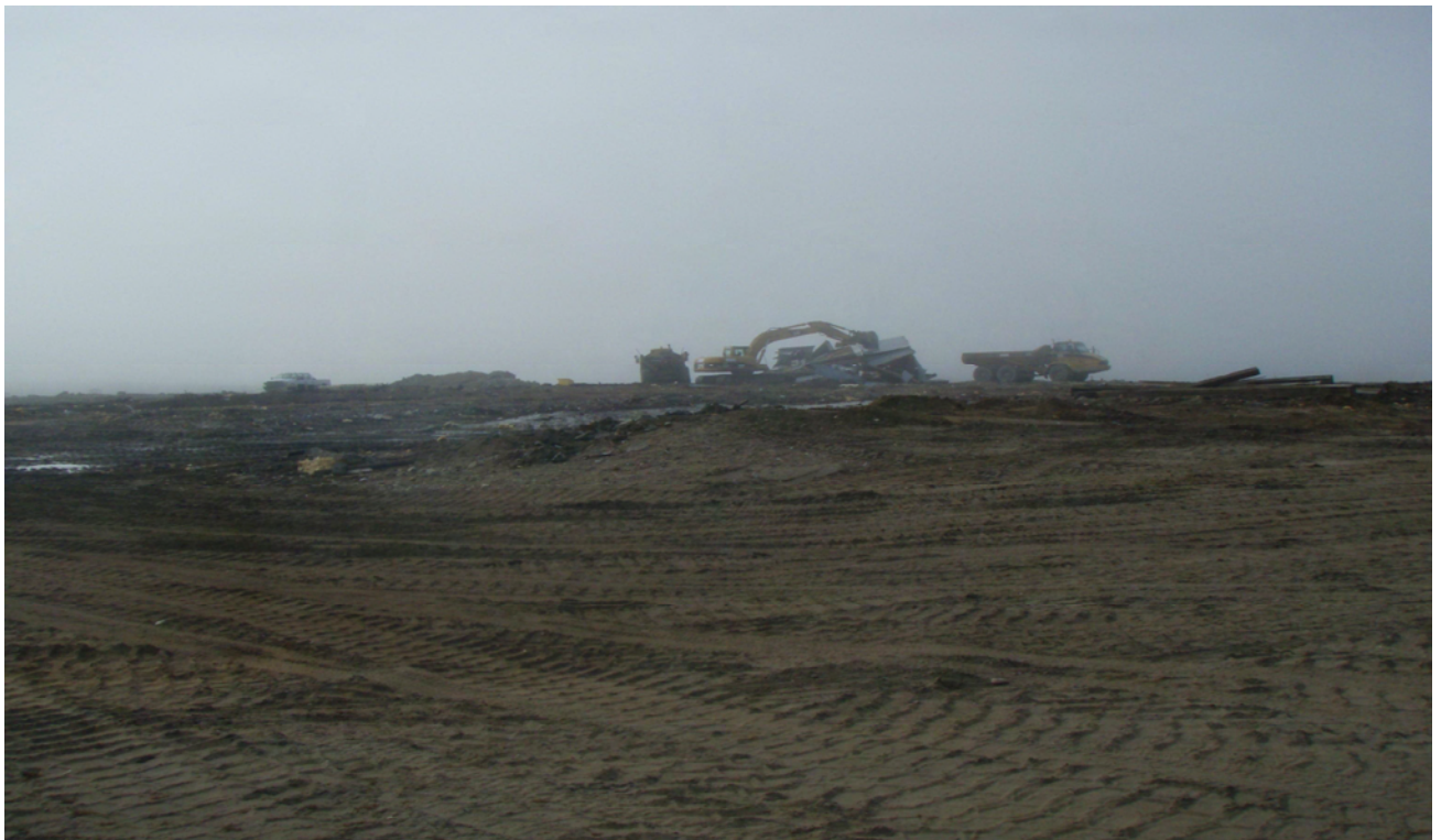
Main Station Area (after Remediation)