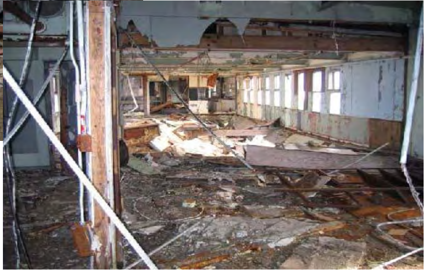
Main Station Area (before Remediation)