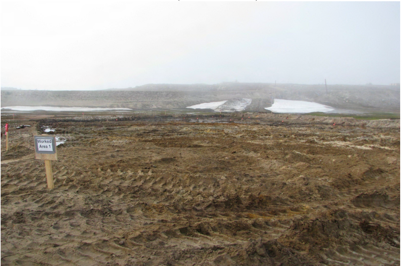
Worked Area # 1 (after Remediation)