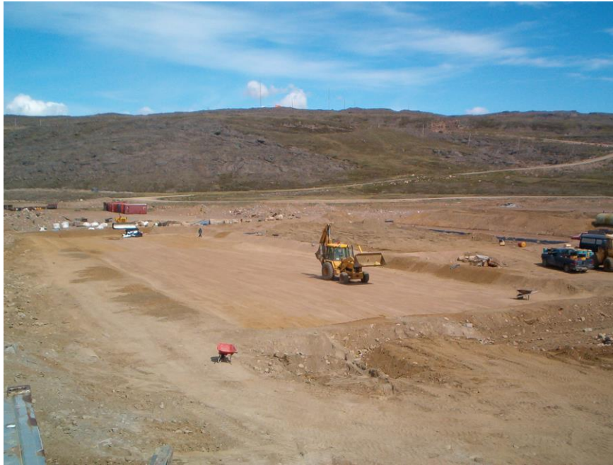
Photograph 1: Cell 3 during construction (2003)