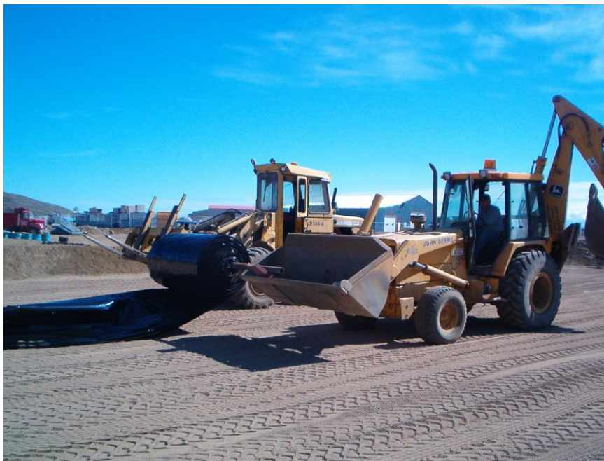
Photograph 2: Cell 3 surface smoothness and geomembrane deployment