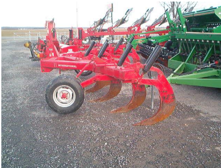
Photograph 4: Agricultural tilling tool used to aerate the soil during treatment