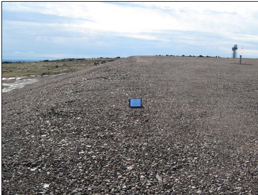
Photograph TII-5B. Southeast crest facing west. Some coarse rockfill along crest edge but there does not appear to be tension cracks. ↑