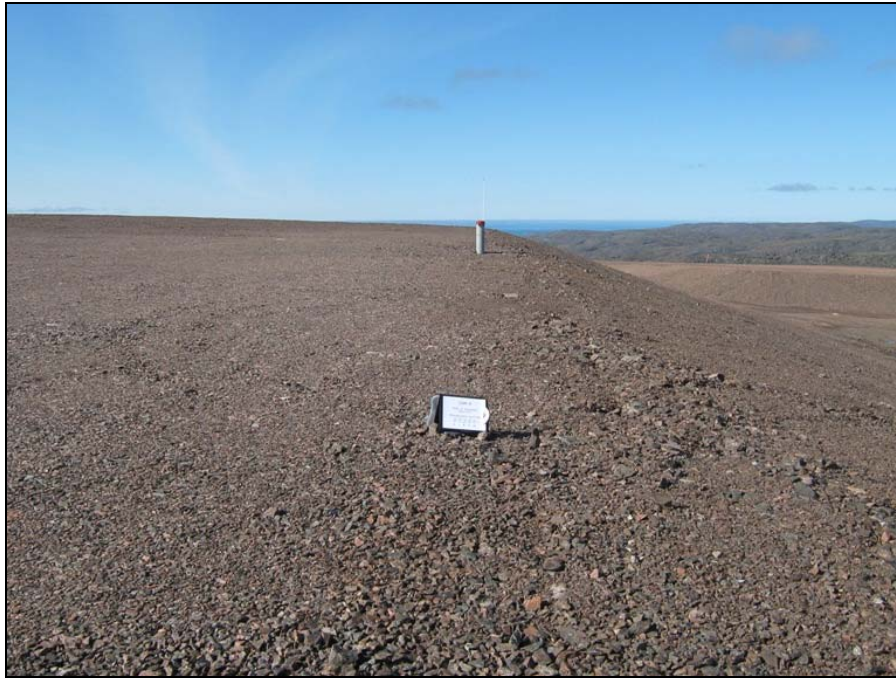
Photograph TII-5A. Southeast crest facing north. ↑