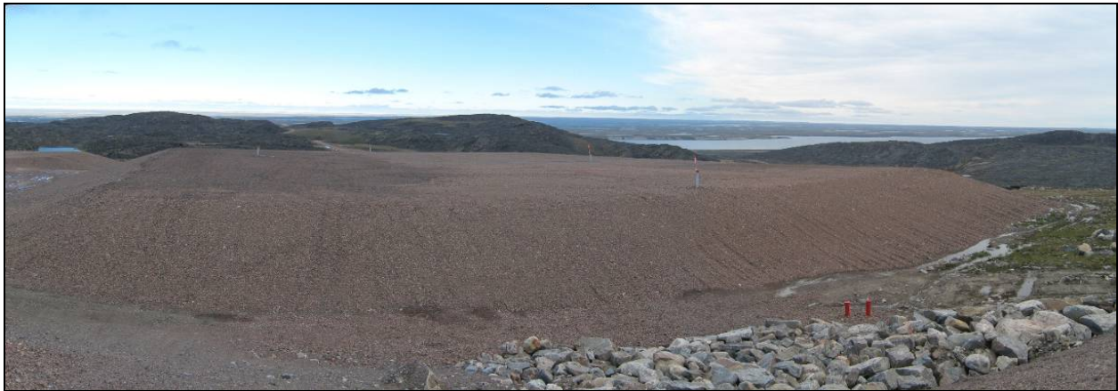
Photograph TII-10. Panoramic photo of Tier II landfill facing east from raised gravel pad. ↑