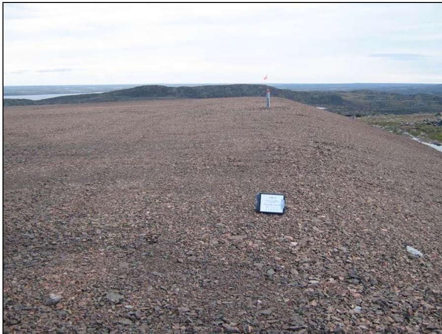
Photograph TII-1B. Northwest corner of landfill facing south along crest. ↑