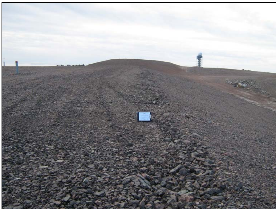
Photograph TII-2A. Northeast corner of landfill facing west. ↑