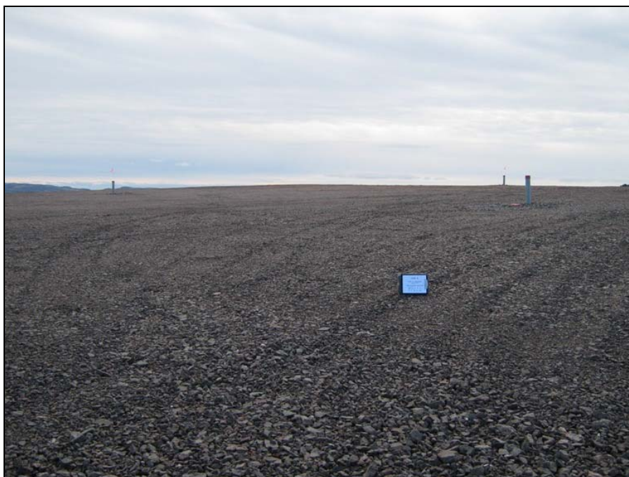
Photograph TII-2B. Northeast corner of landfill facing southwest. ↑