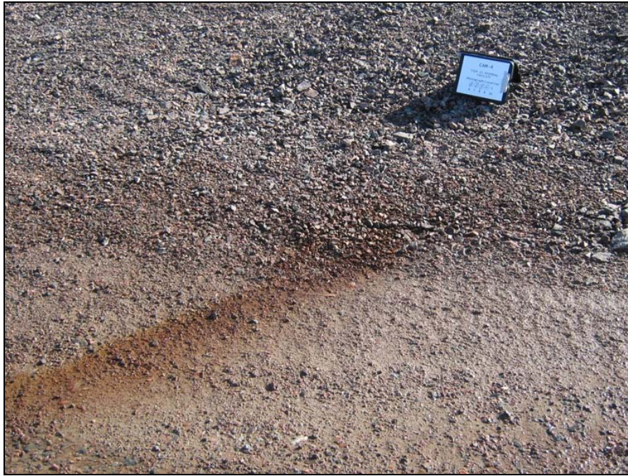
Photograph TII-4A. At the northeast toe. Some seepage with orange staining. Some water drainage along the road at the toe. ↑