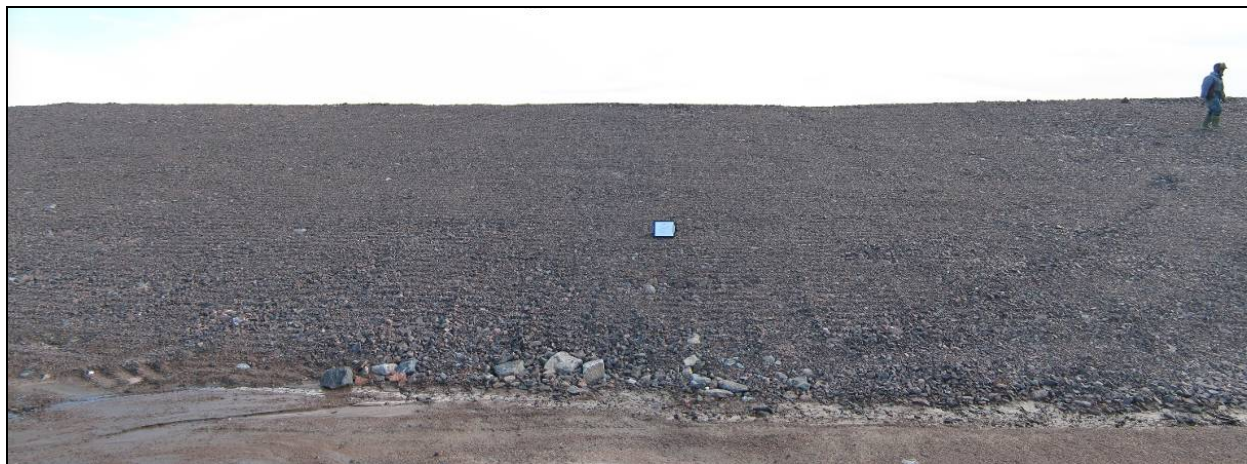
Photograph TII-3. Panoramic photo of the north slope. ↑