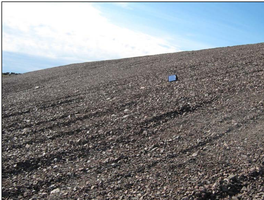
Photograph TII-7. South slope from southeast toe facing west. Some seepage from south slope and minor ponding at toe. No staining. ↑