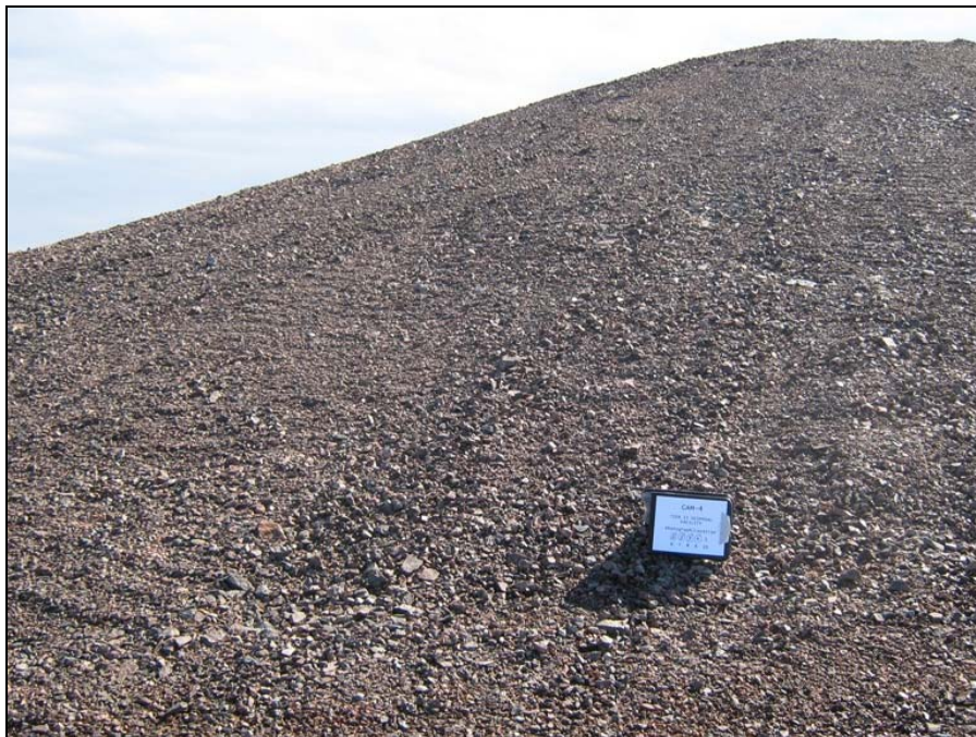
Photograph TII-4B. Northeast corner and toe. ↑