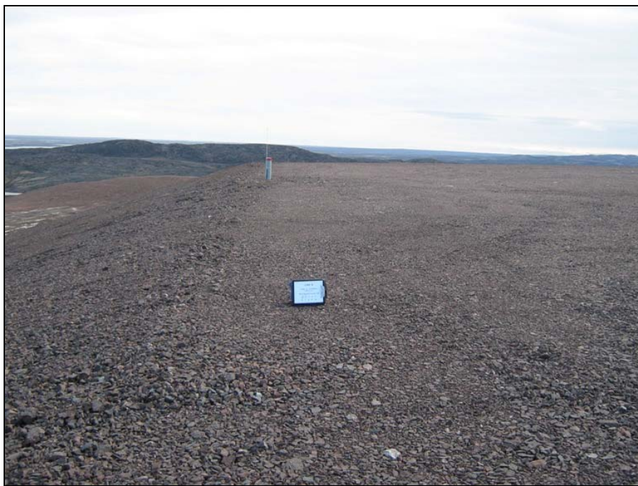
Photograph TII-2C. Northeast corner of landfill facing south. ↑