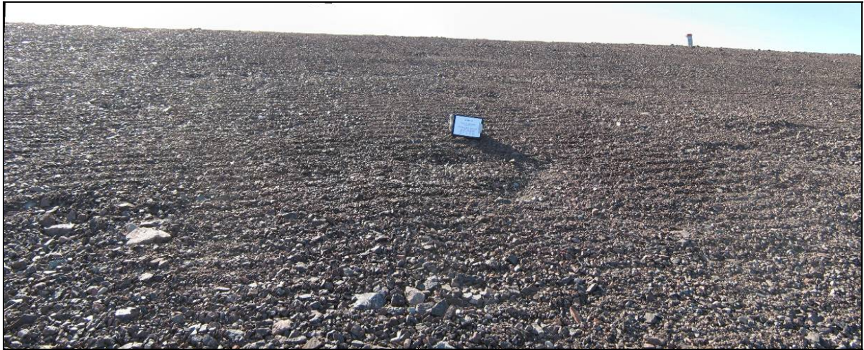
Photograph TII-6. Panoramic photo of the southeast slope. Some water seeping out of slope face. No staining. ↑