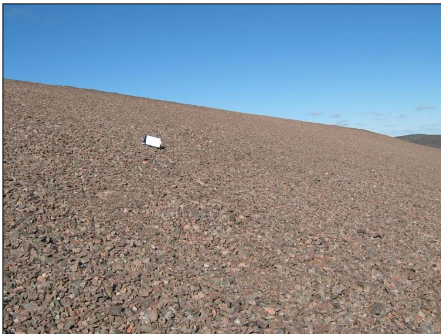
Photograph TII-8. South slope from southwest toe facing east. ↑