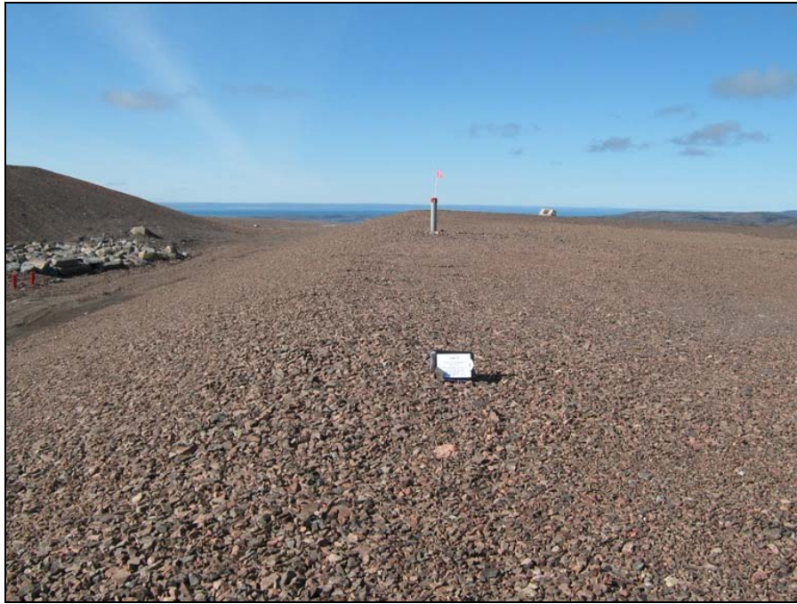
Photograph TII-9B. Facing north along crest from the southwest corner of the landfill. Some ponded water along toe. No staining. ↑