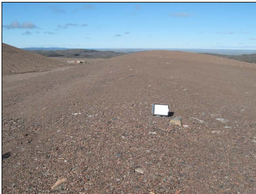
Photograph USL-2C. Facing north along west crest. ↑