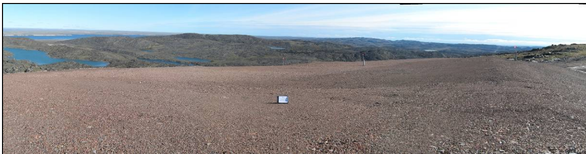
Photograph USL-13. Panoramic photo of the landfill top from the northwest corner. ↑