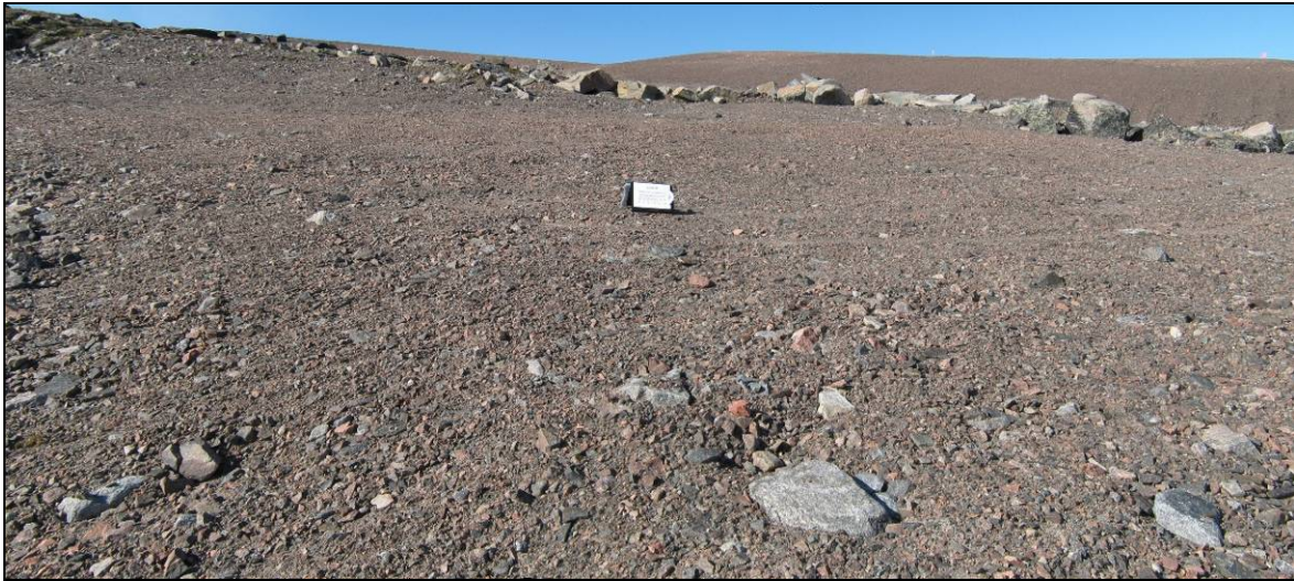
Photograph USL-5. Panoramic photo from the southwest corner of south lobe. ↑