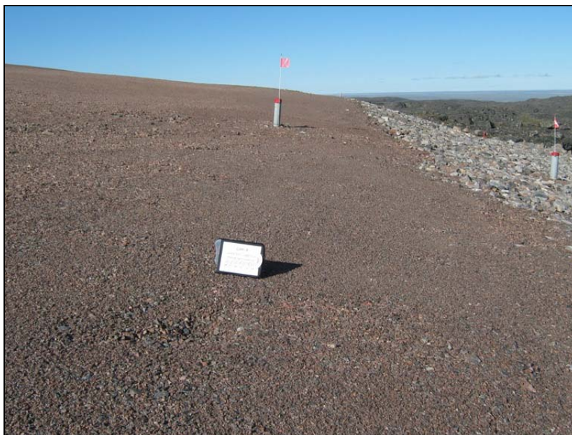
Photograph USL-9A. Facing north along crest from southeast corner. ↑