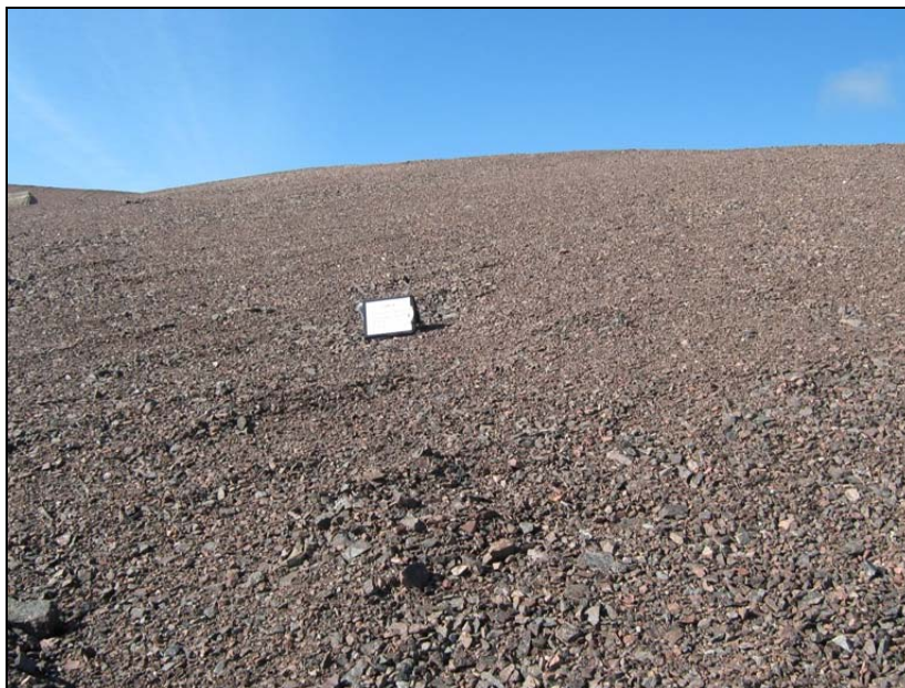
Photograph USL-4. Facing west along south slope. ↑