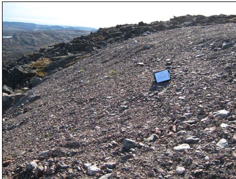
Photograph USL-6. Facing south along the south slope of the south lobe from the southeast corner. ↑