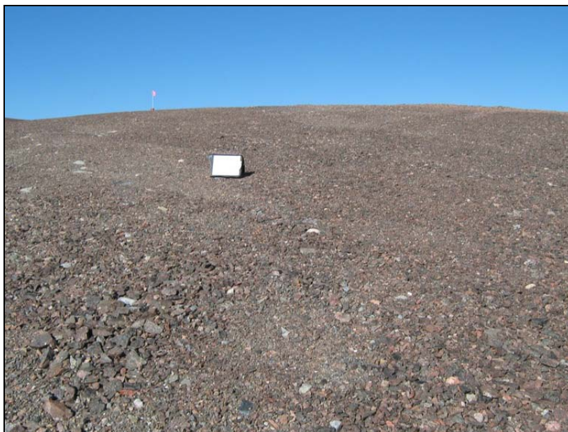
Photograph USL-3. Facing south slope. ↑