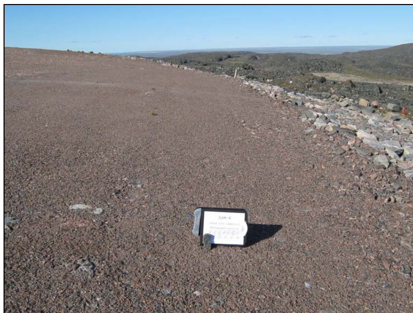
Photograph USL-10B. Facing north along crest. ↑

Panoramic photo of the top of the landfill facing west. ↑