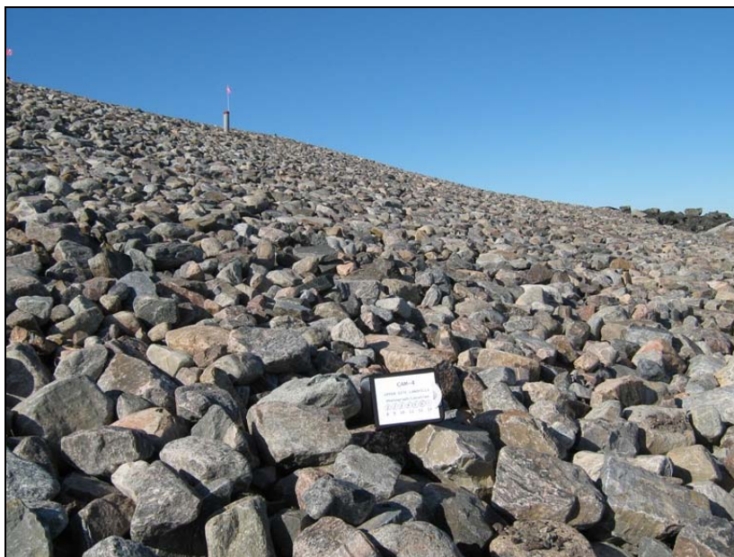
Photograph USL-7. Facing north from the southeast corner of the rip-rap. ↑