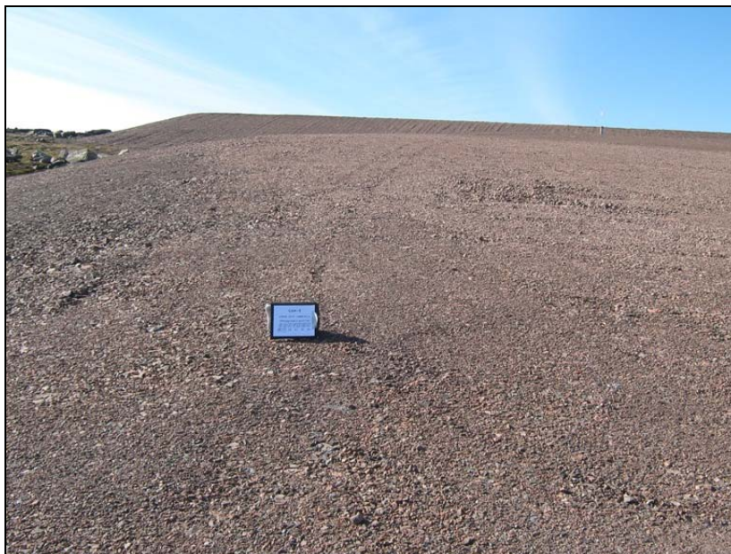
Photograph USL-9B. Facing west along south crest from the southeast corner. ↑