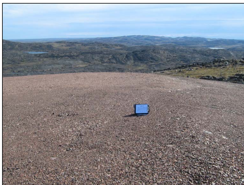
Photograph USL-2A. Facing southeast along crest. ↑