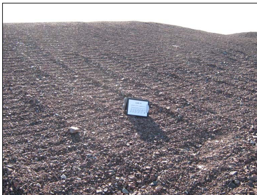
Photograph USL-12. North gravel slope. ↑