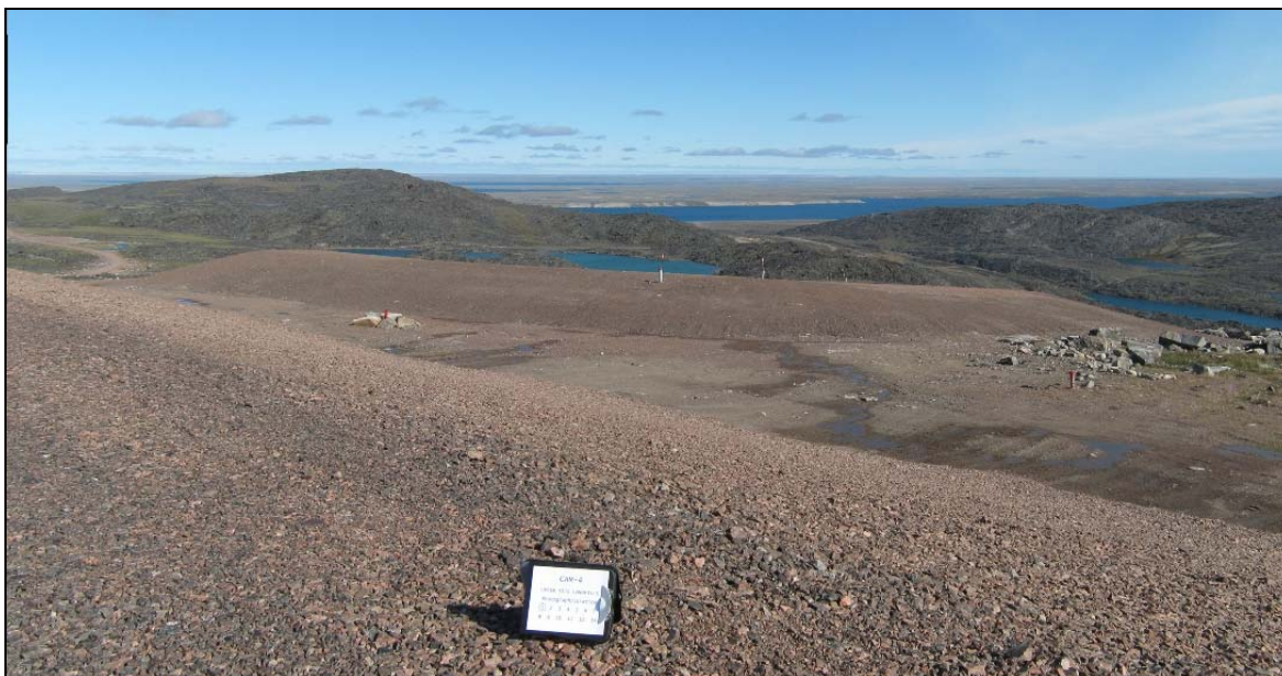
Photograph USL-1. Panoramic photo facing southeast towards west slope of Upper Site Landfill. ↑