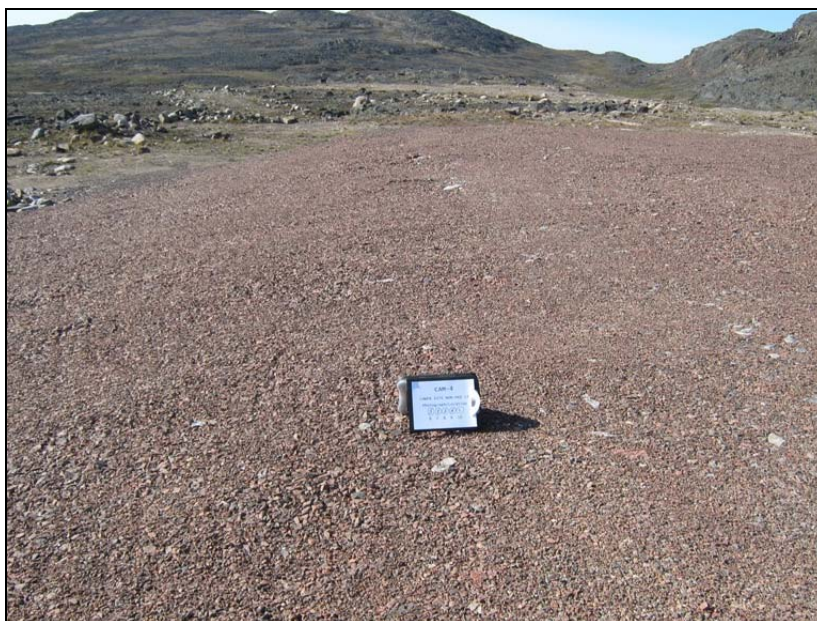
Photograph LNH-5A. Facing west along the crest from the centre of the south crest. ↑