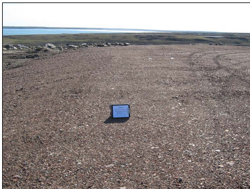
Photograph LNH-3B. Facing south from the centre of the east crest. ↑