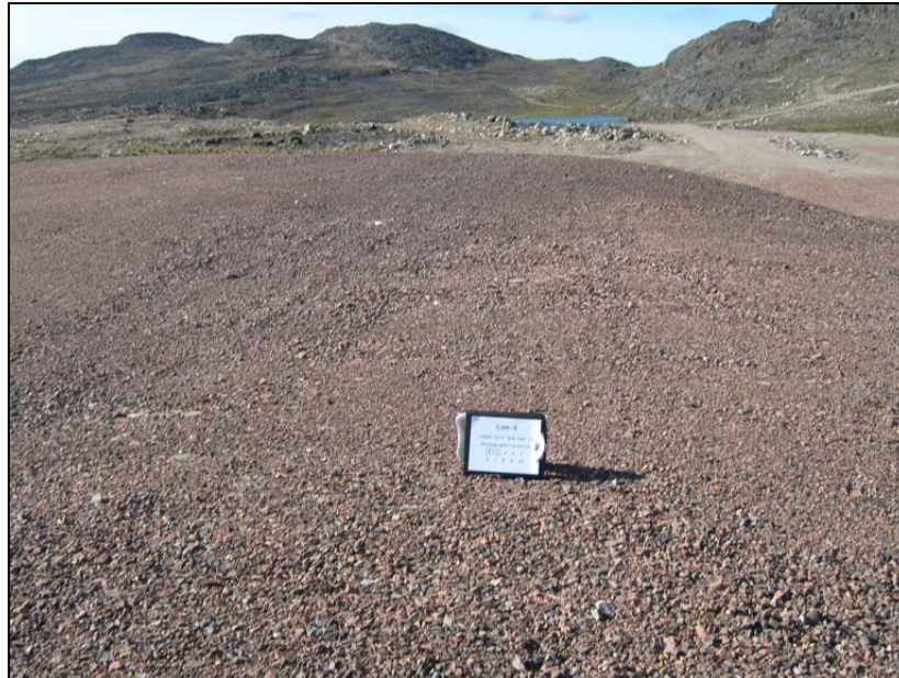
Photograph LNH-2B. Facing west along the crest from the centre of the north crest. Some tire tracks visible but no damage or rutting. ↑