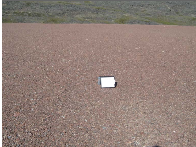
Photograph LNH-5B. Facing north along the top of the landfill from the centre of the south crest. ↑