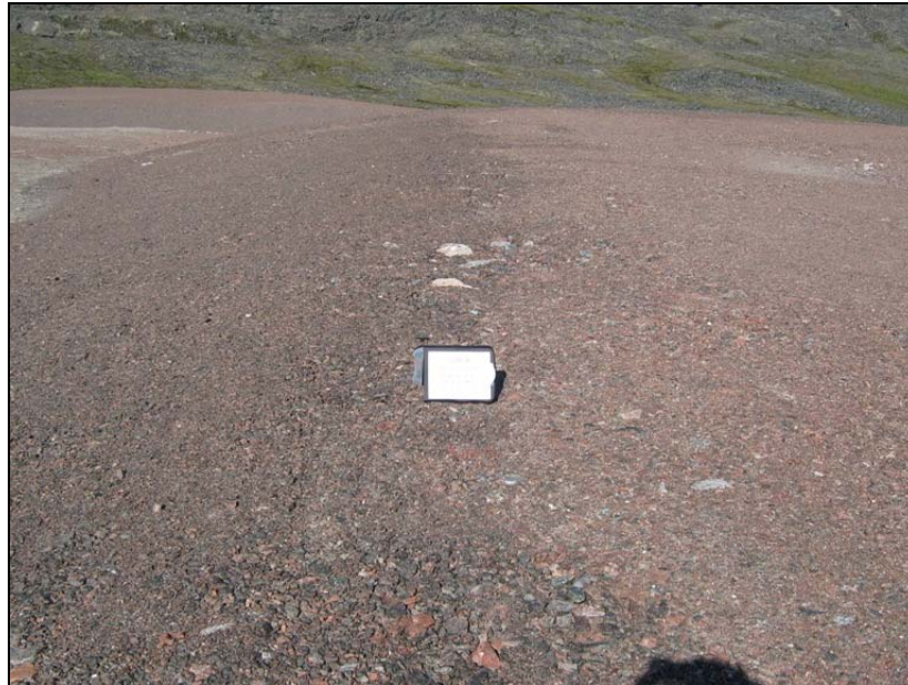
Photograph LNH-6A. Facing north along the crest from the centre of the west crest. ↑