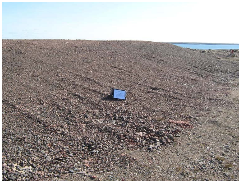
Photograph LNH-7B. Facing southeast towards the west slope. ↑