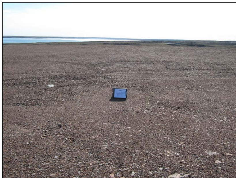
Photograph LNH-2C. Top of the landfill facing south from the centre of the north crest. ↑