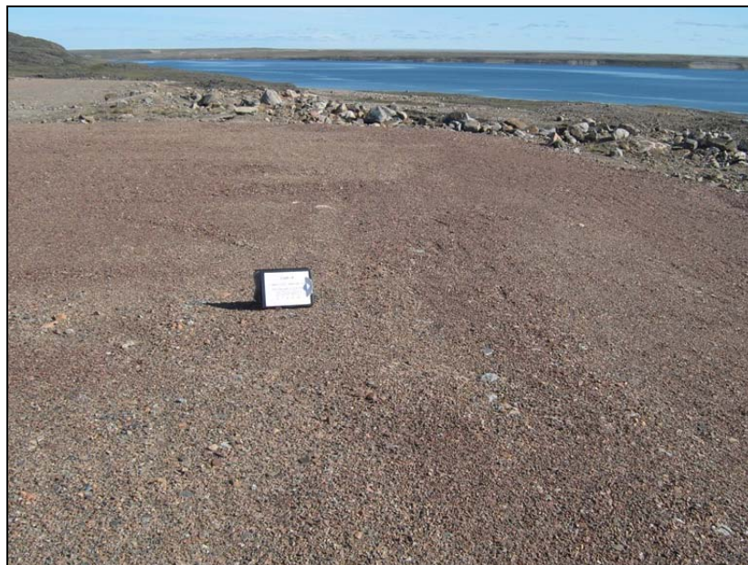
Photograph LNH-5C. Facing east along the crest from the centre of the south crest. ↑