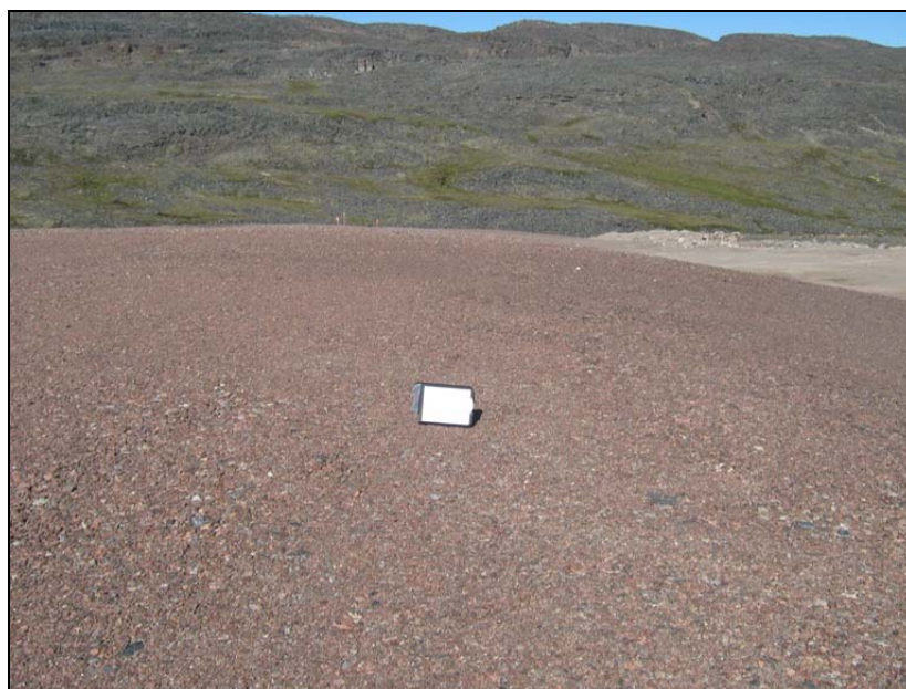
Photograph LNH-3A. Facing north from the centre of the east crest. ↑