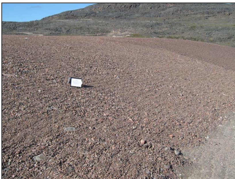
Photograph LNH-4. Facing northwest along the east slope. ↑