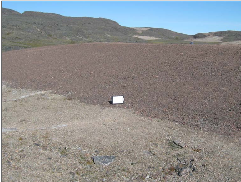
Photograph LNH-7A. Facing northeast towards the west slope. ↑