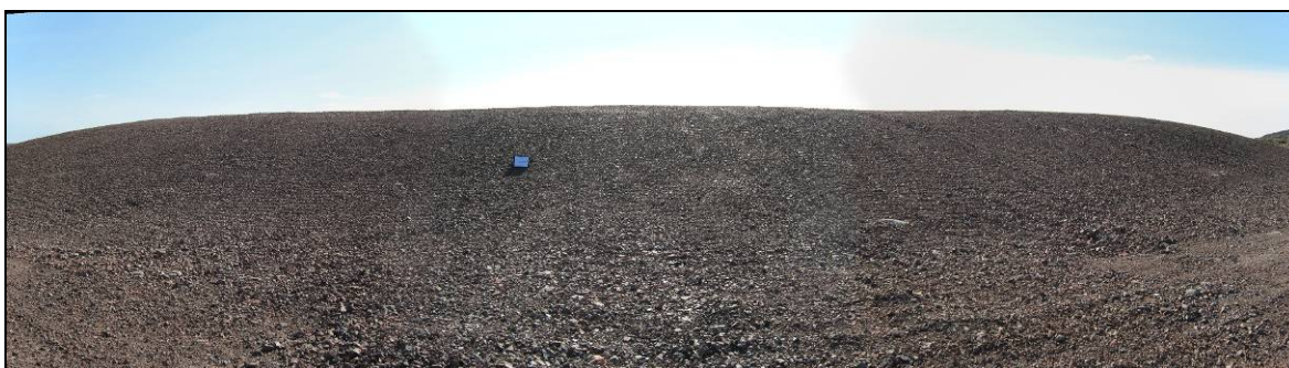
Photograph LNH-1. Panoramic photo of the north slope.____ ↑