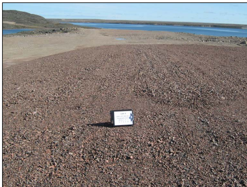
Photograph LNH-2A. Facing east along crest from the centre of the north crest. ↑