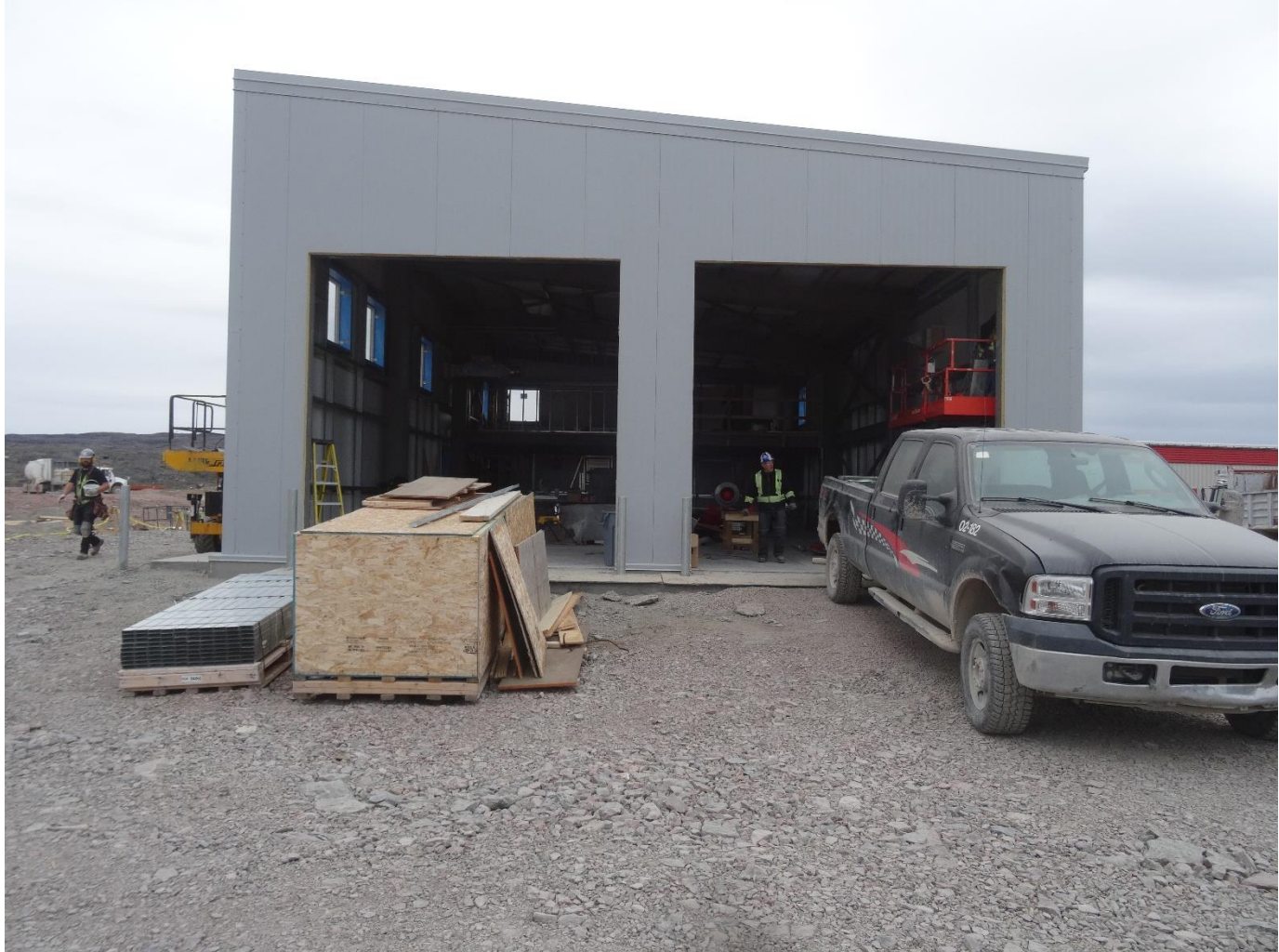
Description: Construction of the Fire Hall – View 1