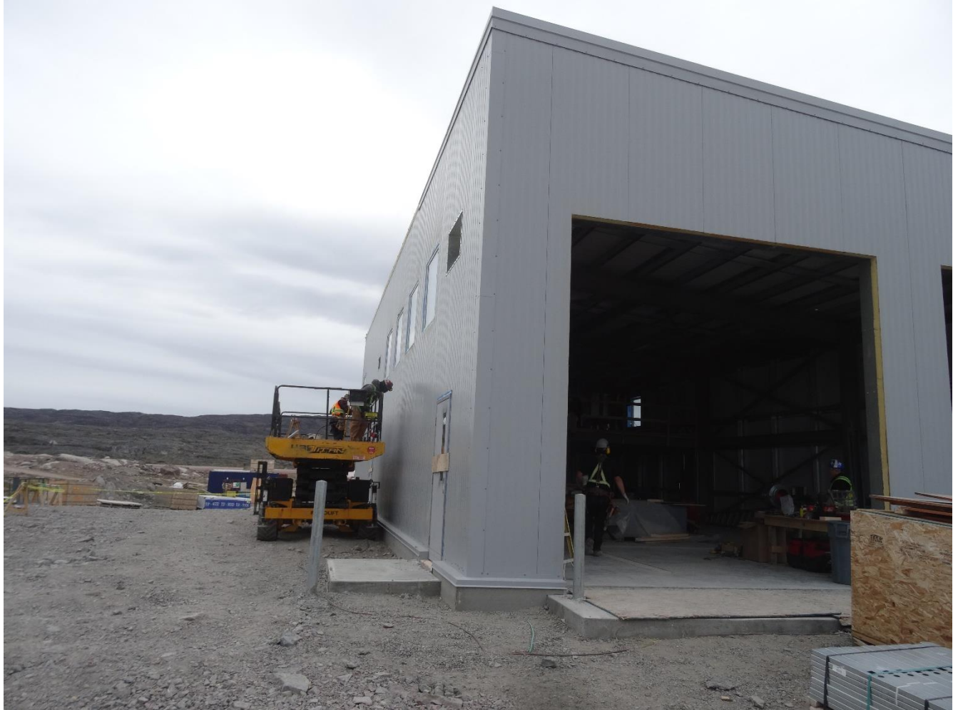
Description: Construction of the Fire Hall – View 2