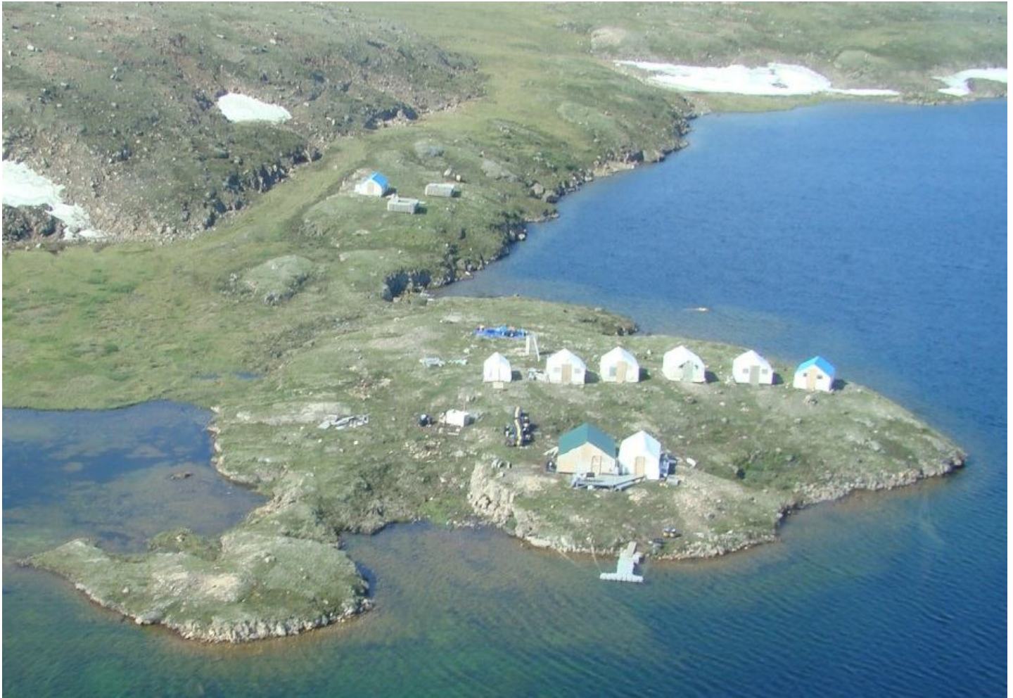
Photograph 1: Aerial View of Silvermet Camp

Land Use Permit: 2007J0012 (Valley Lake)