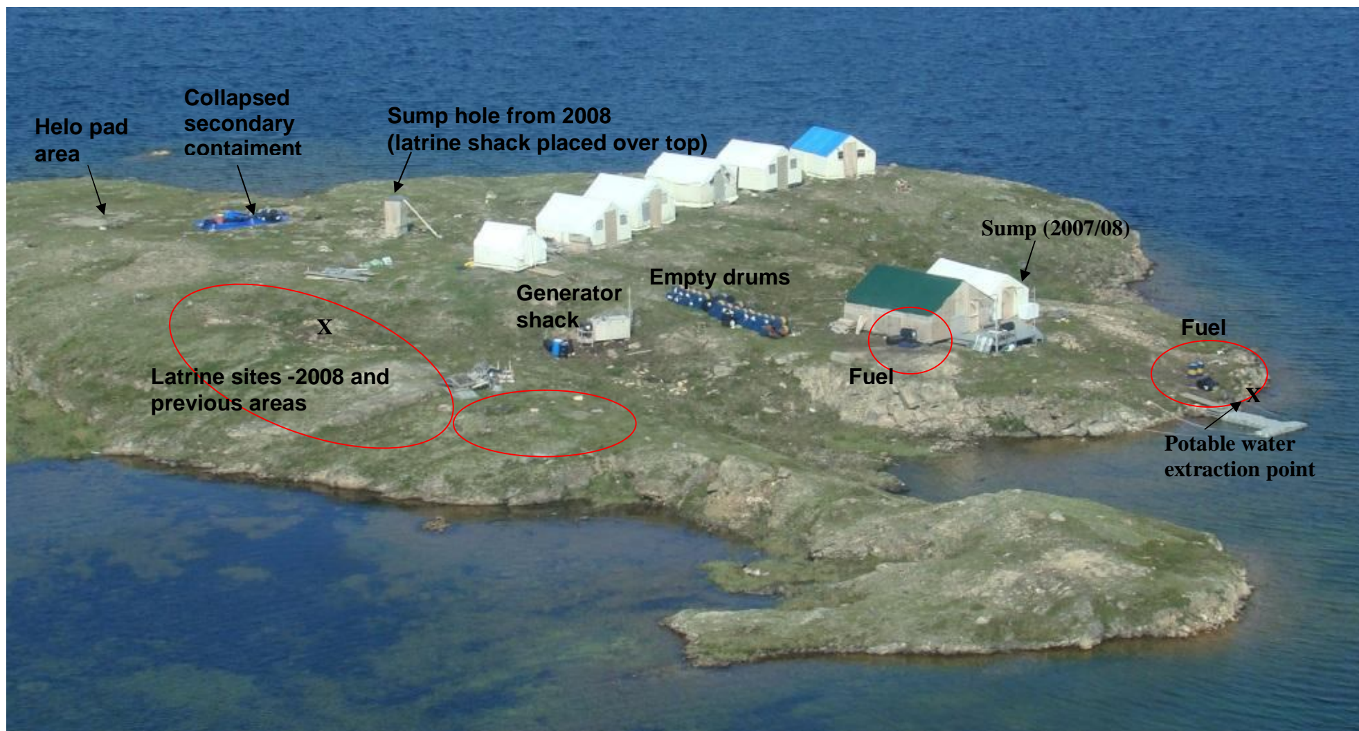
Photograph 2: Aerial view of Silvermet camp –Fuel storage, infrastructure, and former latrines within 30 metre set-back from water