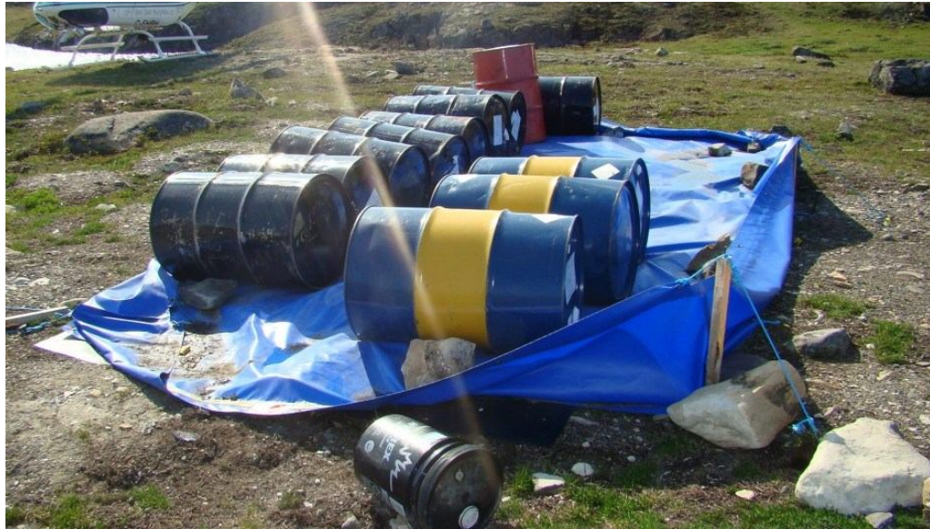
Photograph 4. Collapsed secondary containment near helicopter apron area.