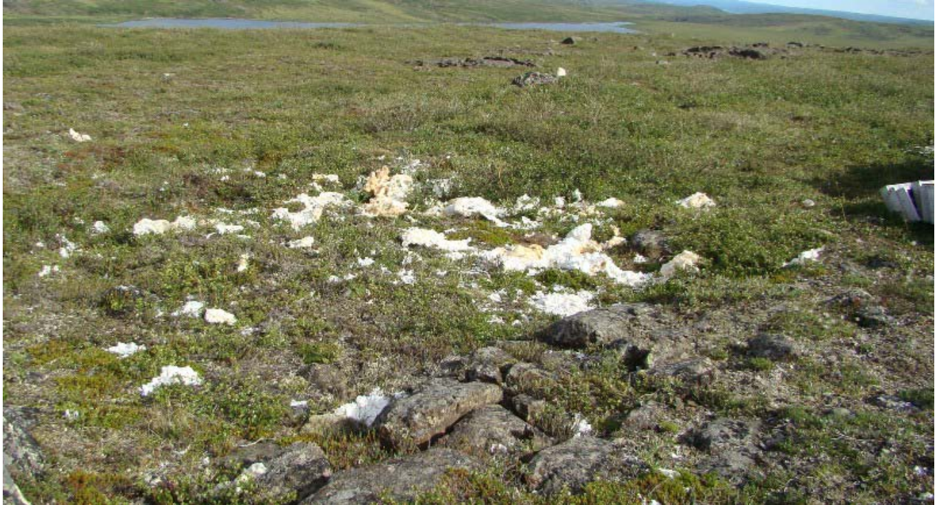
Photograph 7: Close-up view of insulation.