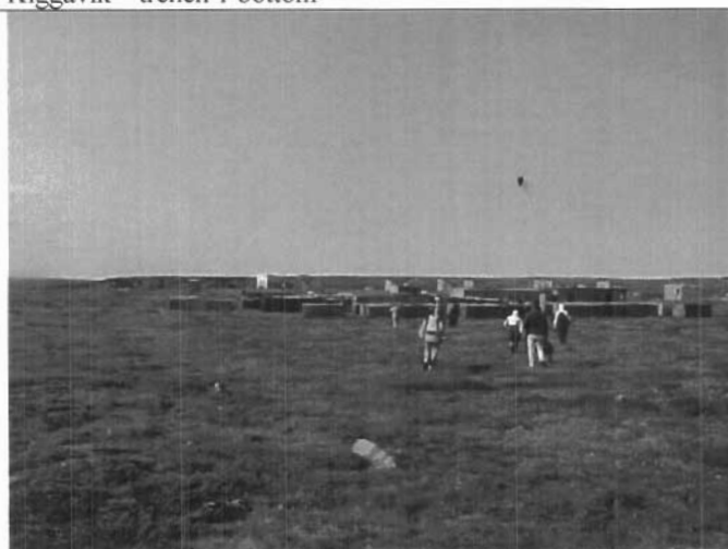
Kiggavik camp and core storage