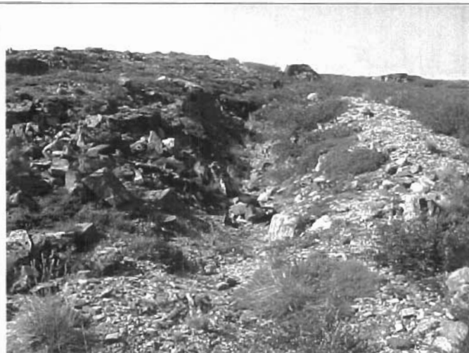
Kiggavik – trench 2 bottom