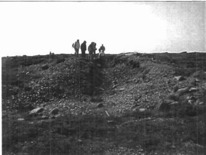
Kiggavik – trench 1 bottom