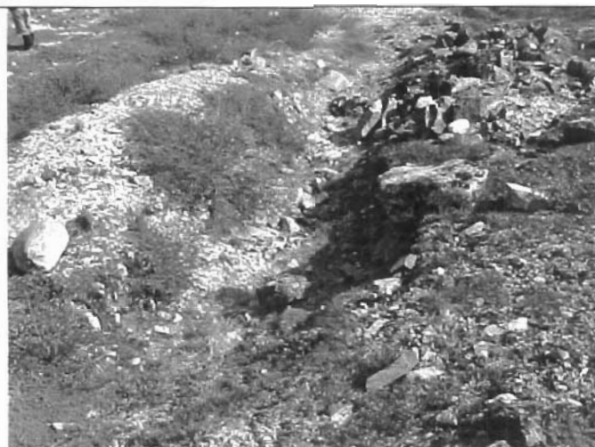
Kiggavik - trench 2 top