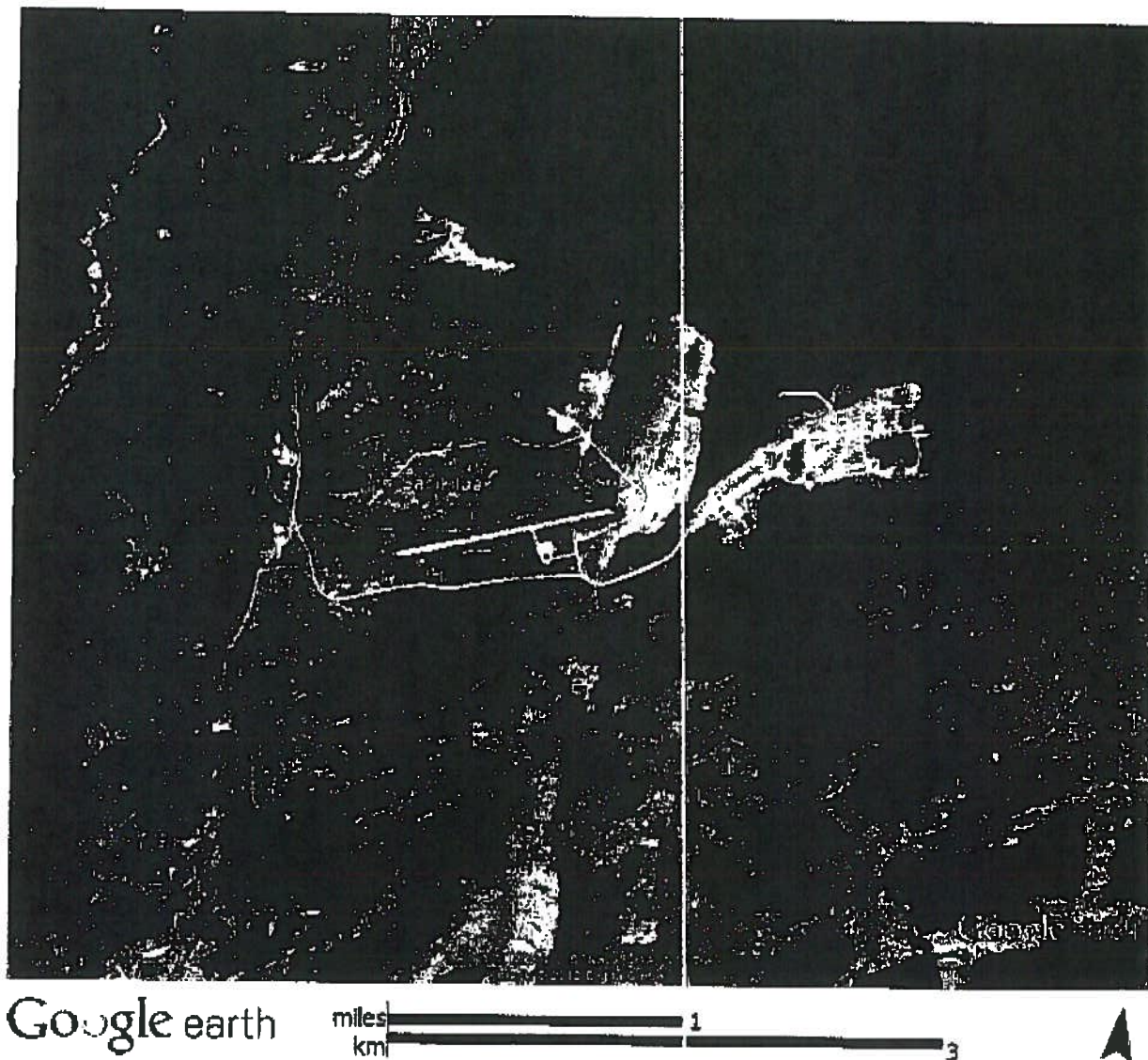
Figure 2: Proposed installation site; Sanikiluaq, NU.

Nunavut Water Board NOV 19 2012 Public Registry