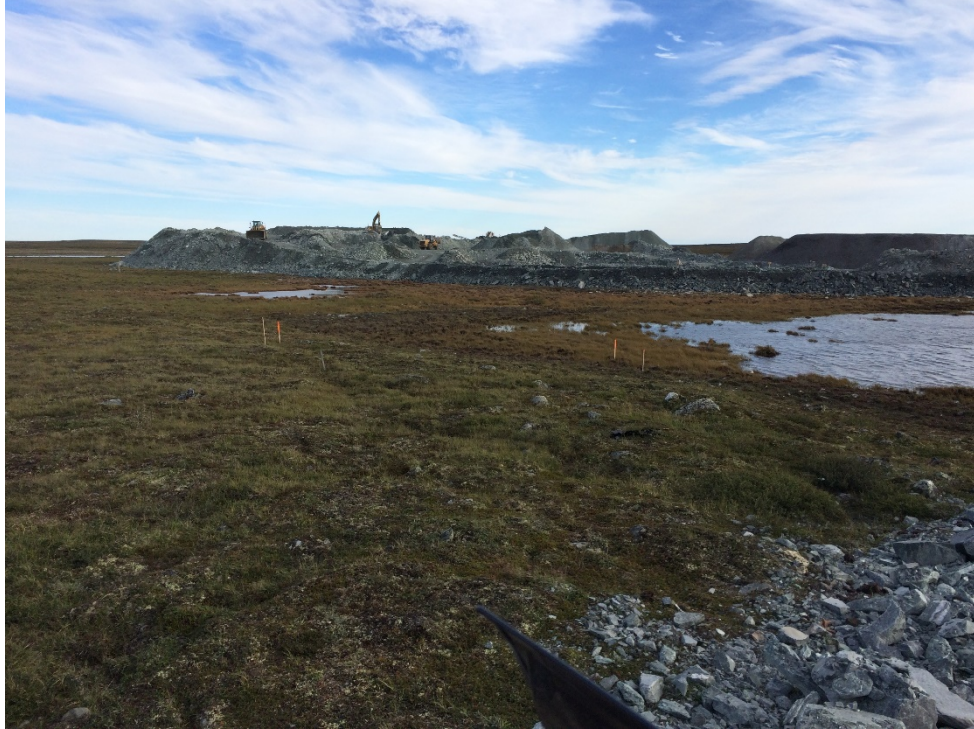
Photo 7: Material preparation and access road construction, August 2015