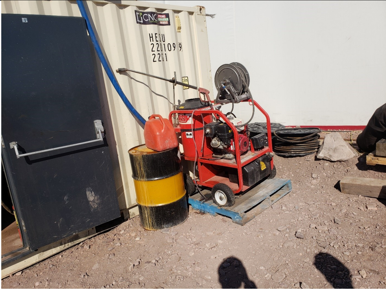
Description: Pressure washer.