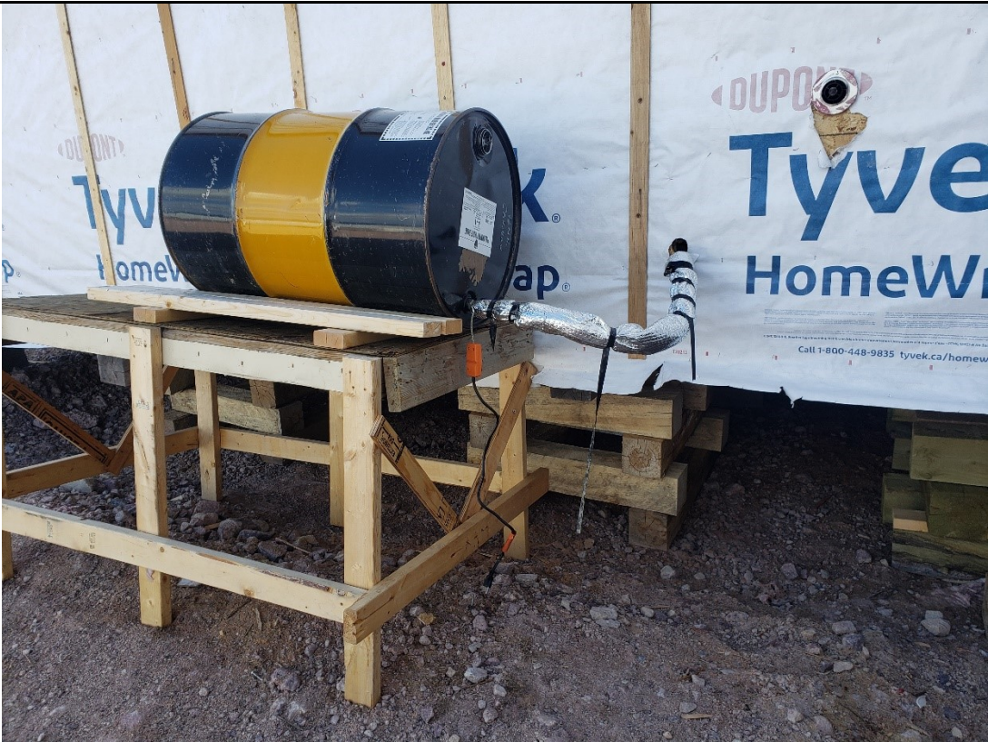
Description: Fuel tank without drip tray.