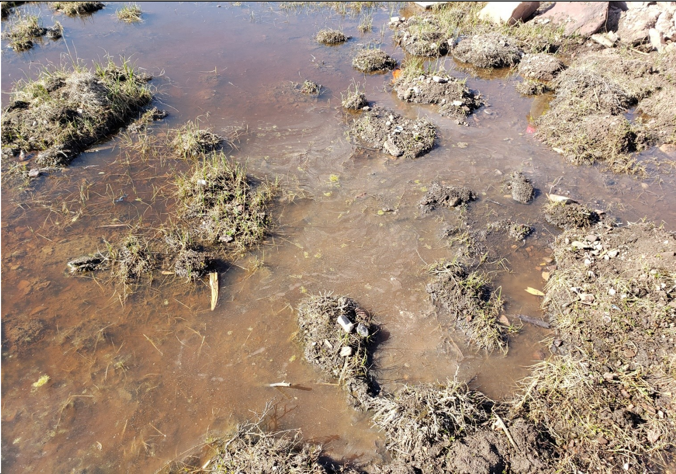
Description: potential oily sheen.