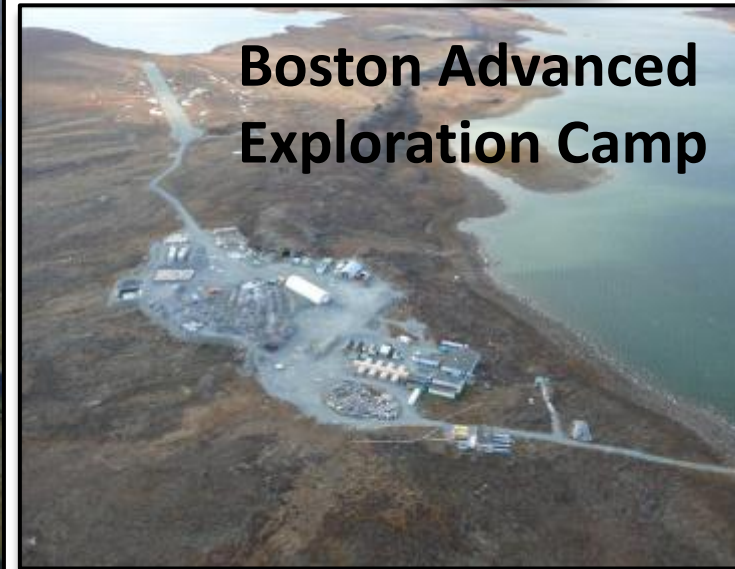
Boston Advanced Exploration Camp