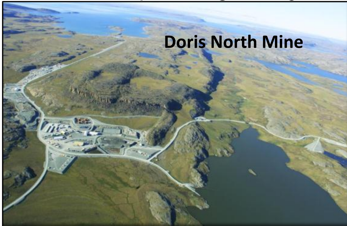
Doris North Mine