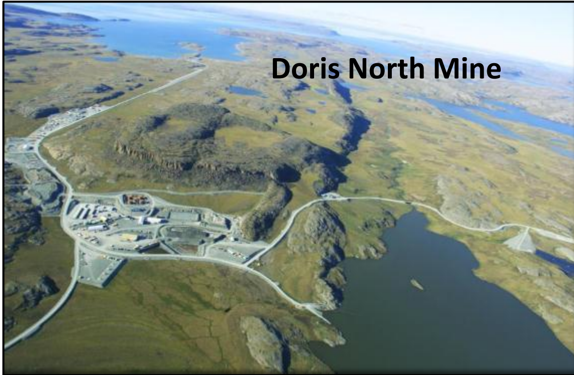
Doris North Mine