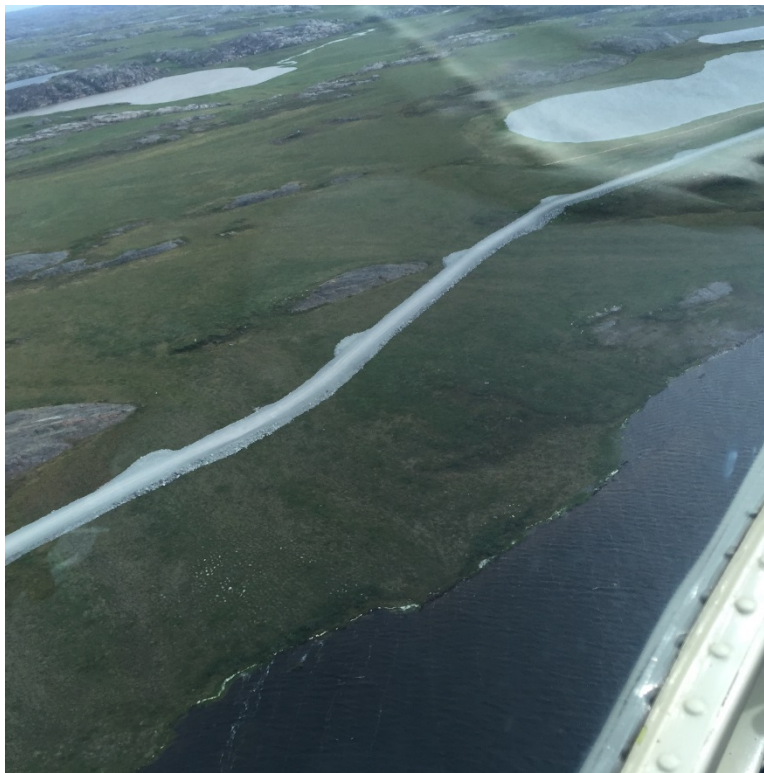
Photo: TIA access road looking northeast – Sampling location 16-QR-02