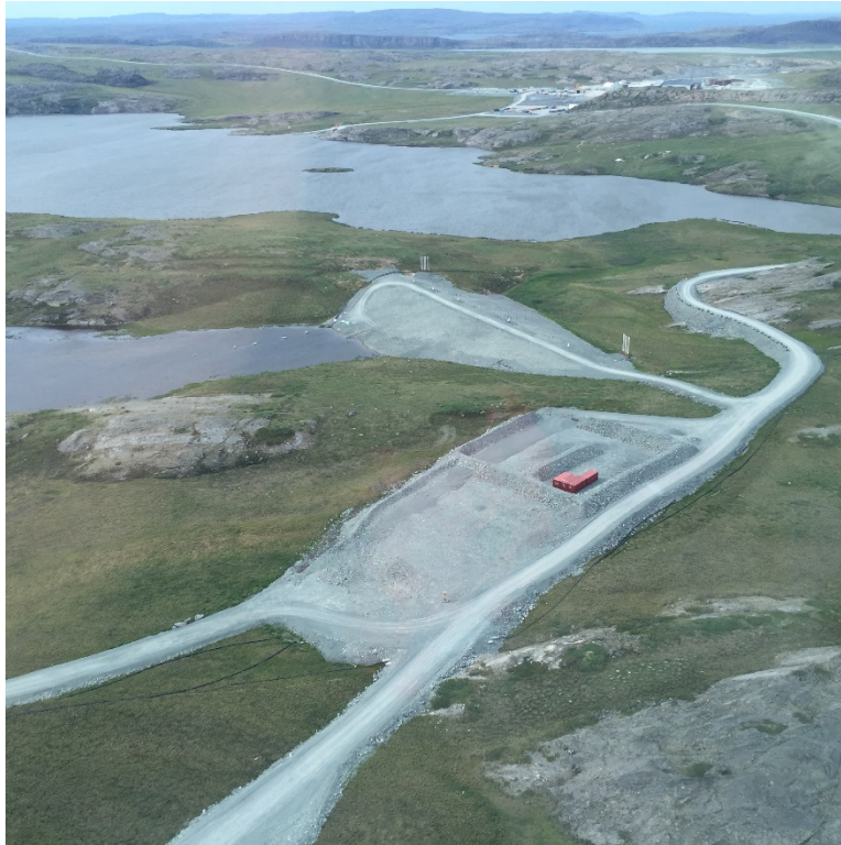
Photo: Temporary explosives berm looking west towards Doris camp – Sampling location 16-QR-01