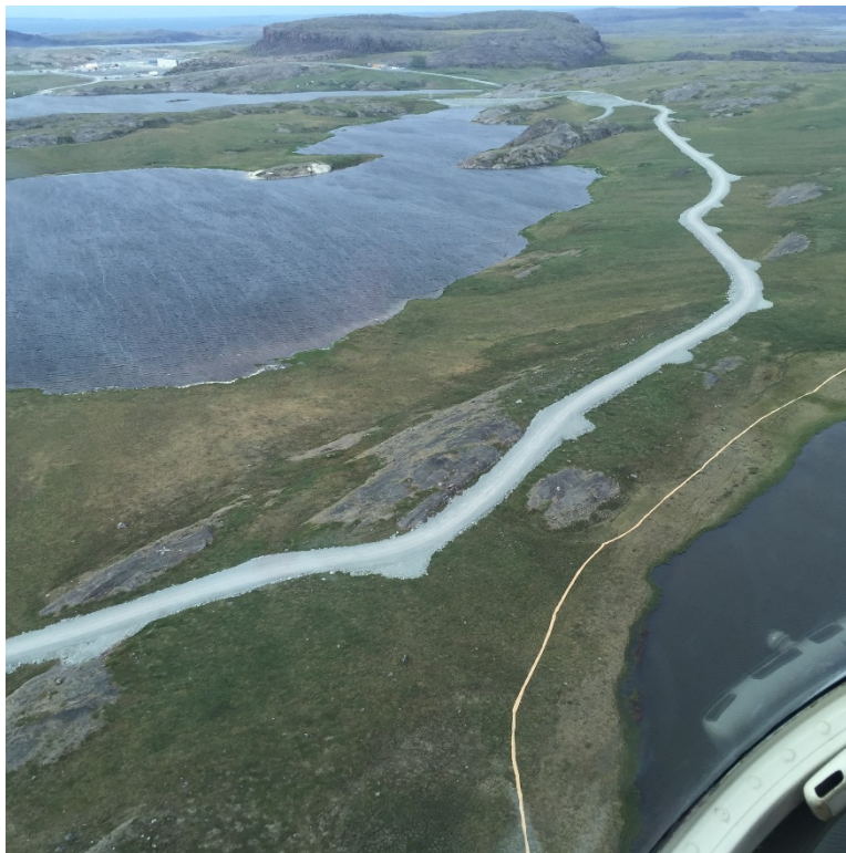
Photo: TIA access road looking northwest towards temporary explosive berm