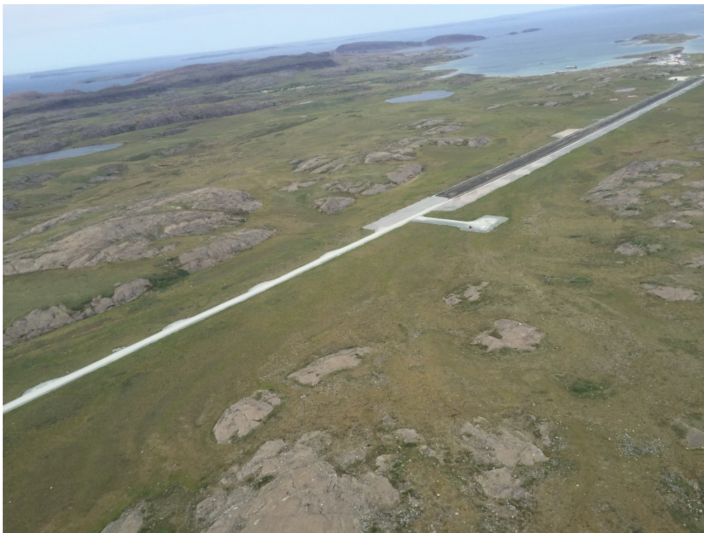
Photo 2: Airstrip looking northwest – Sampling locations 16-QR-10 to -12