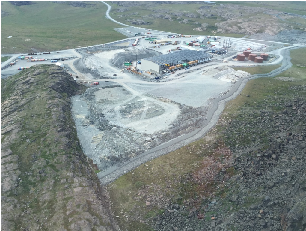
Photo 1: Mine Area looking southwest with Pad T in the foreground – Sampling locations 16-QR-06 to -09 and 16-QR-13 to -17