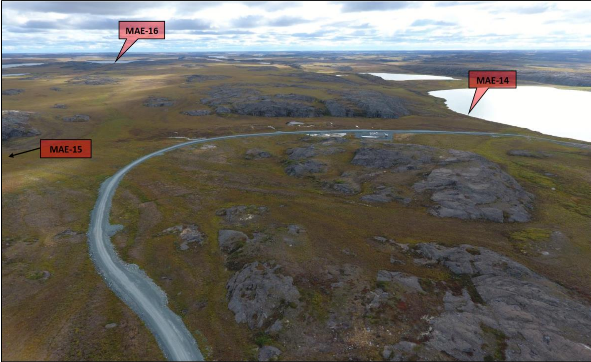
Figure D1. 2BB-MAE1727 Sample Stations Locations