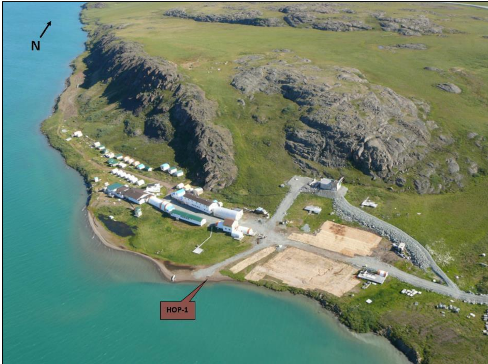
Figure B1. 2BE-HOP1222 Sample Stations Locations