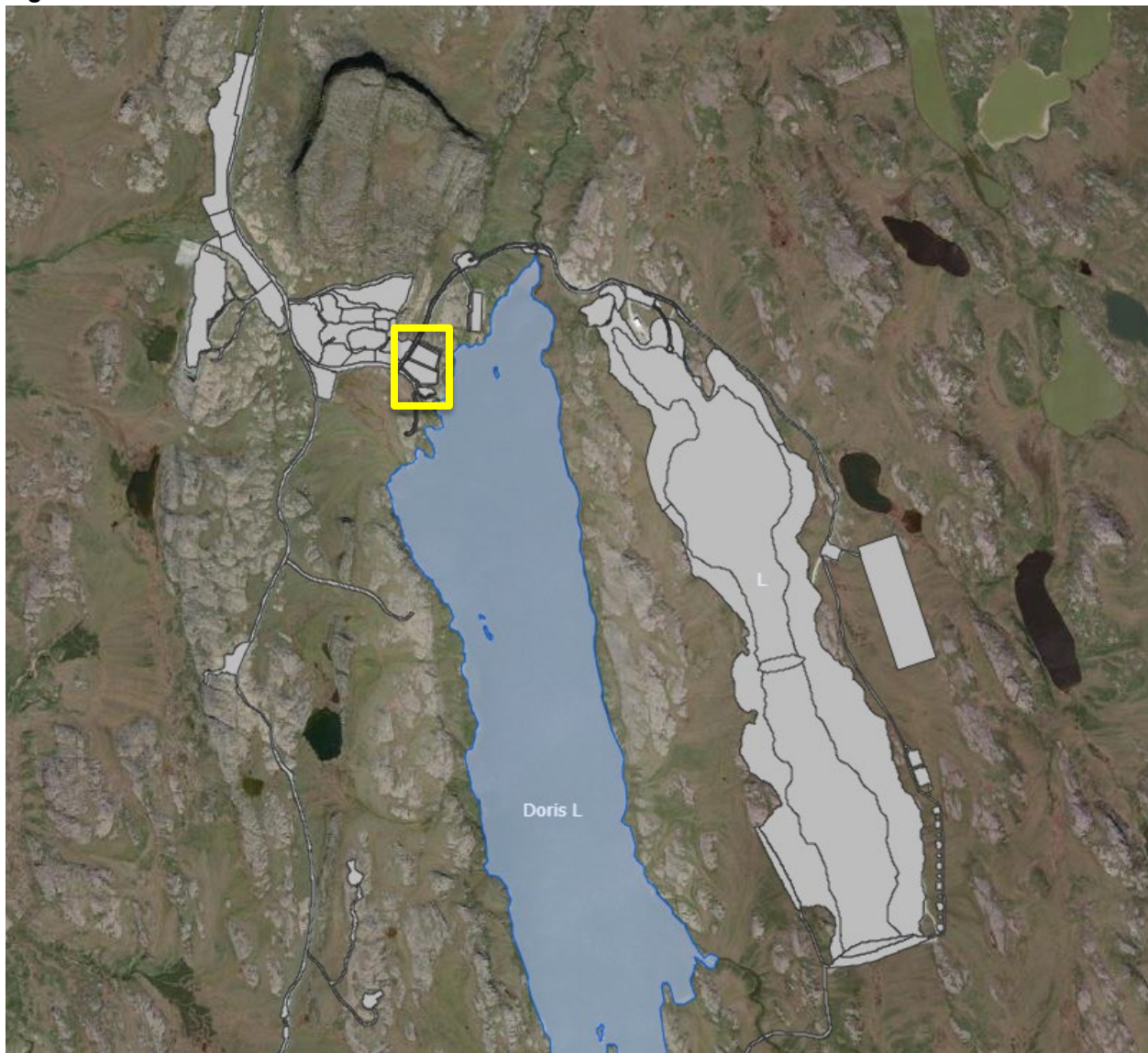
Figure 1 – Pad U Location