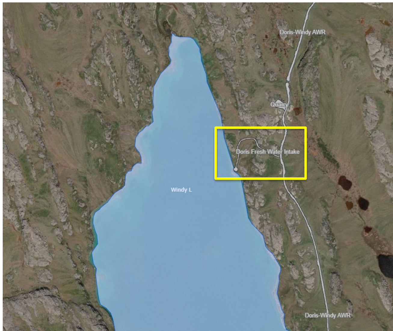
Figure 3 – Windy North Intake Access Road Location