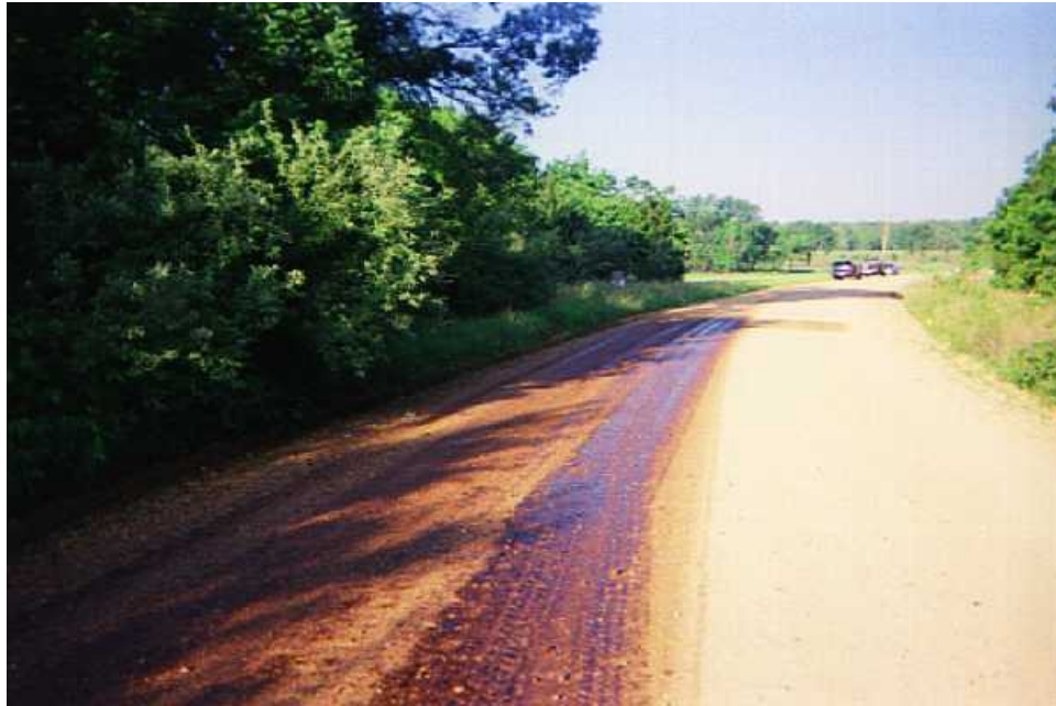
Figure 3. Application of EK35 product at FLW