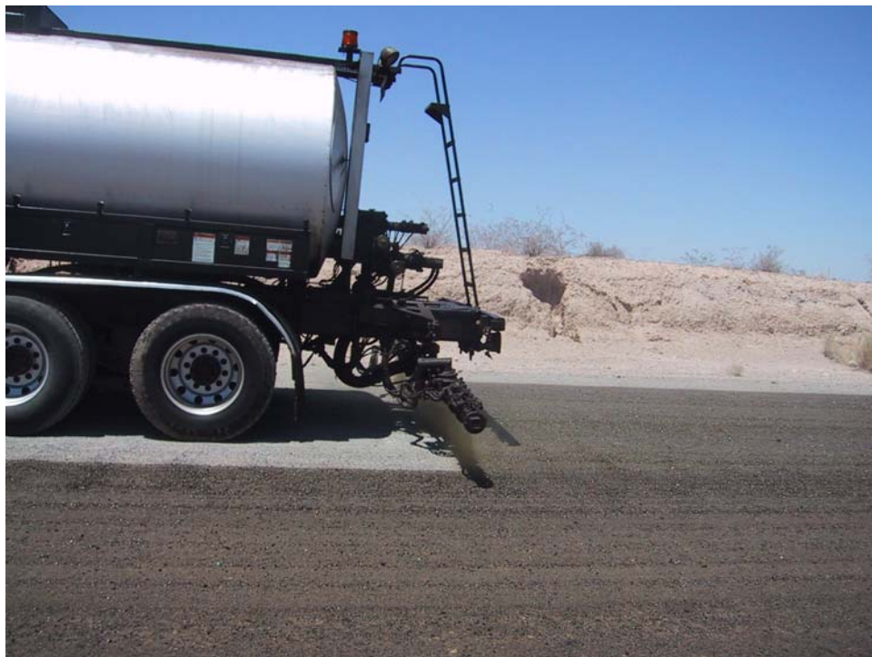
Figure 4. Application of EK35 product at MC