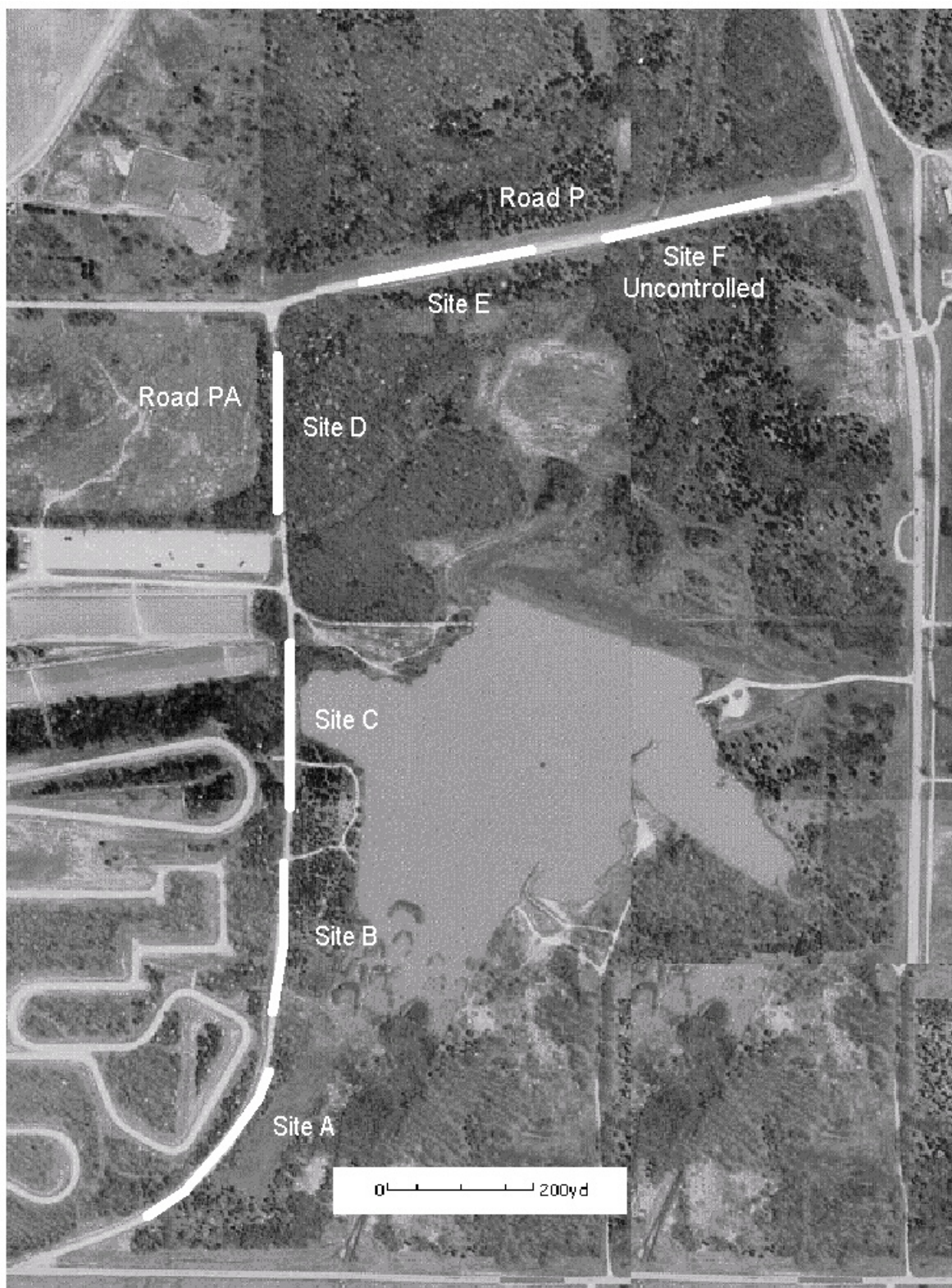
Figure 1. Test locations at FLW