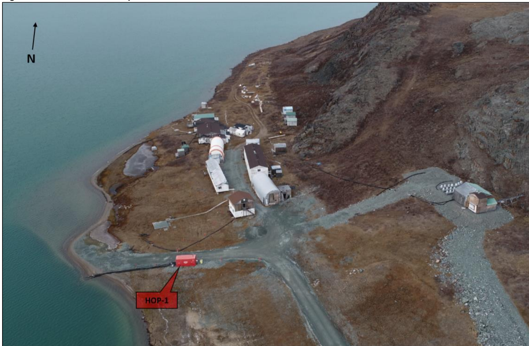
Figure B1. 2BE-HOP1222 Sample Stations Locations