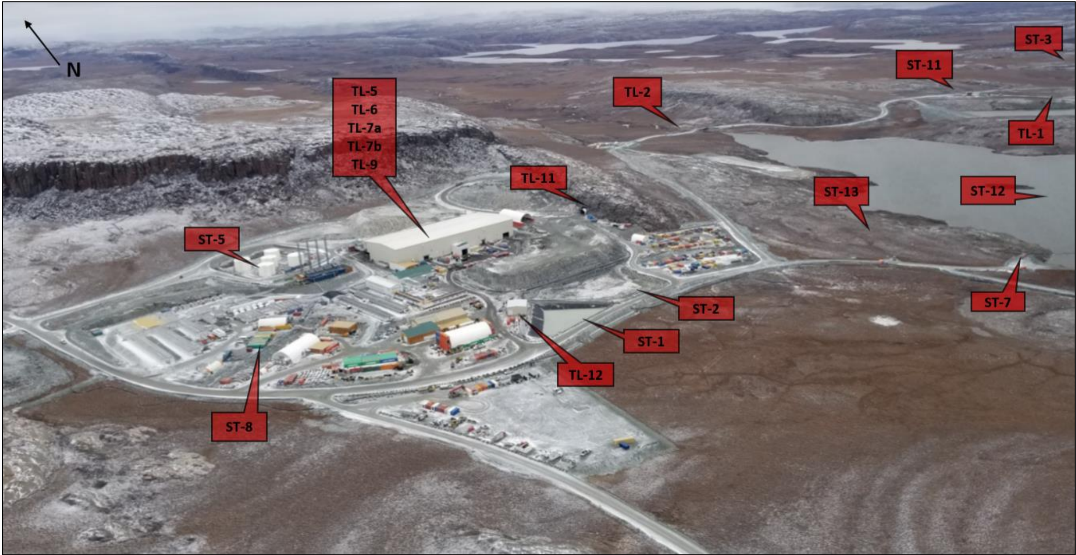
Figure A.1 2AM-DOH1335 Sample Station Locations