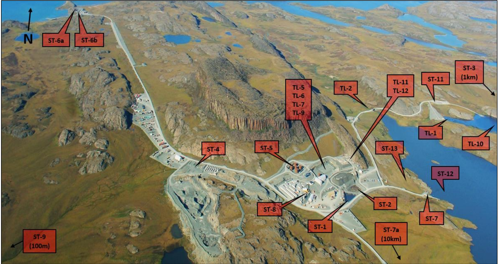
Figure 3. 2AM-DOH-1323 SNP Monitoring Locations