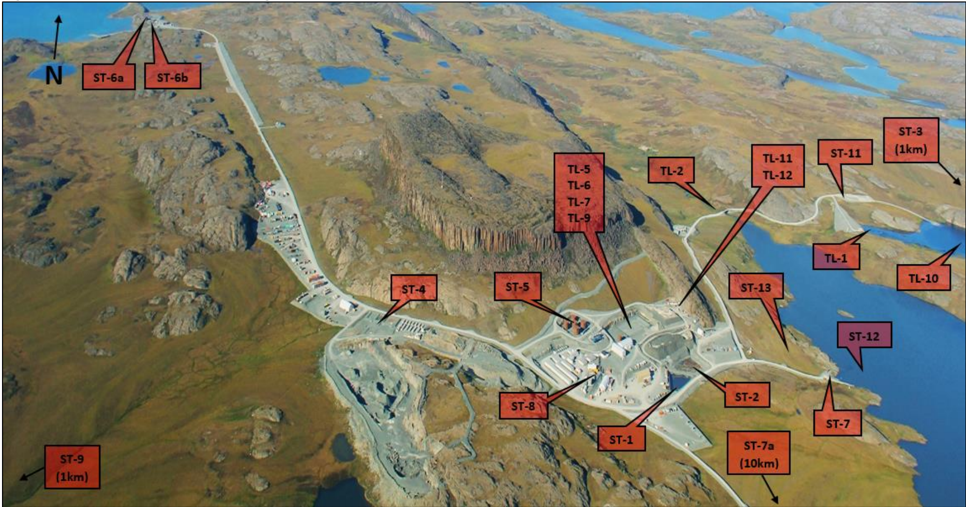
Figure 3. 2AM-DOH-1323 SNP Monitoring Locations