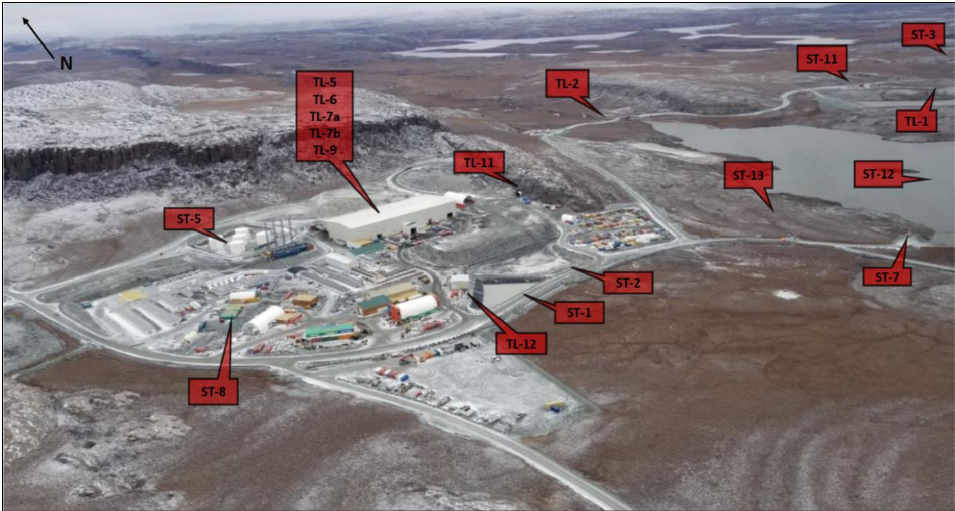
Figure 4. 2AM-DOH1335 SNP Monitoring Locations