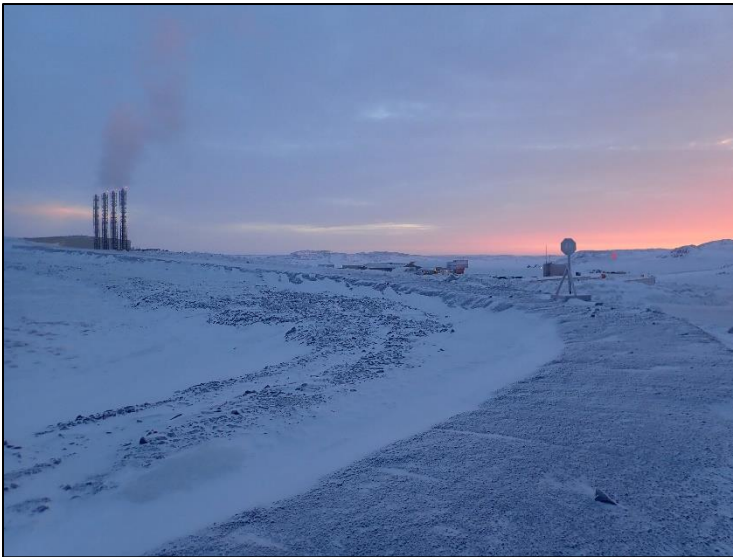
Figure 3. Diversion berm during January 2021