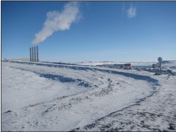
Figure 3. Diversion berm during April 2021