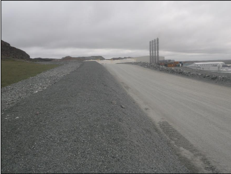
Figure 3. Diversion berm during August 2021