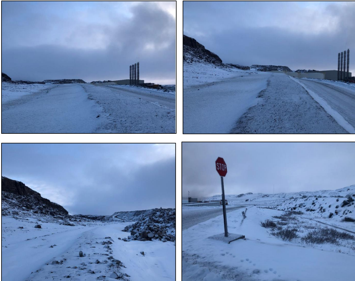
Figure 3. Diversion berm during October 2021