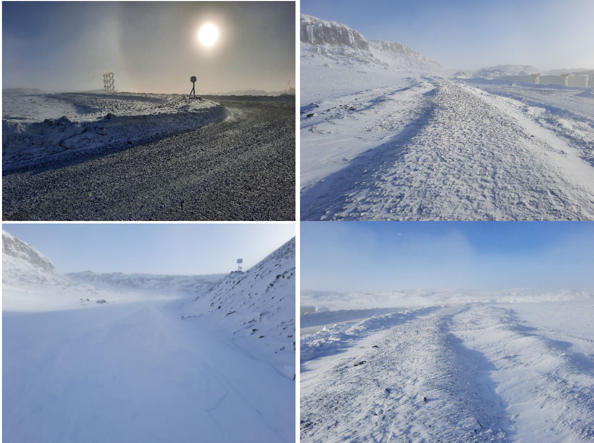
Figure 3. Diversion berm during March 2022