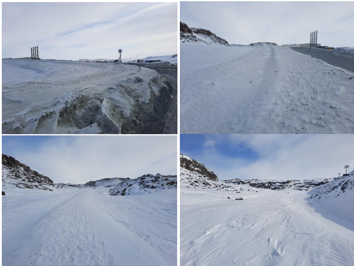
Figure 3. Diversion berm during April 2022