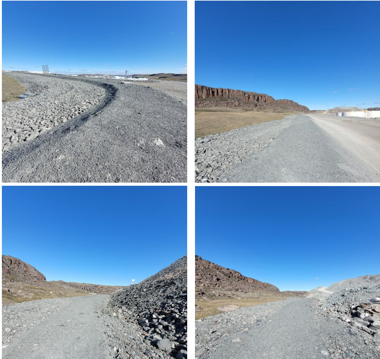
Figure 3. Diversion berm during June 2022