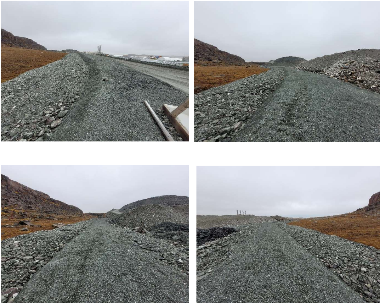
Figure 3. Diversion berm during August 2022