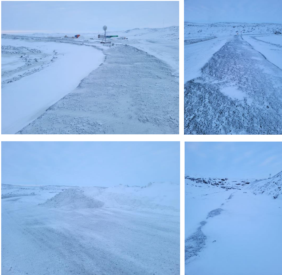
Figure 3. Diversion berm during November 2022