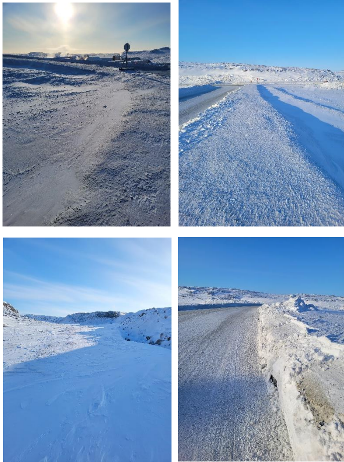
Figure 3. Diversion berm during March 2023