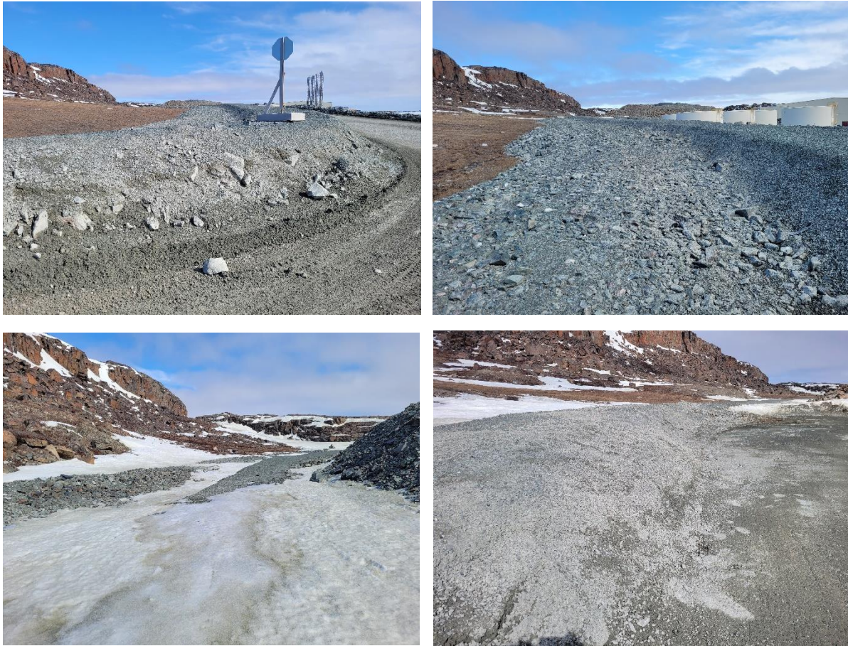
Figure 3. Diversion berm during May 2023