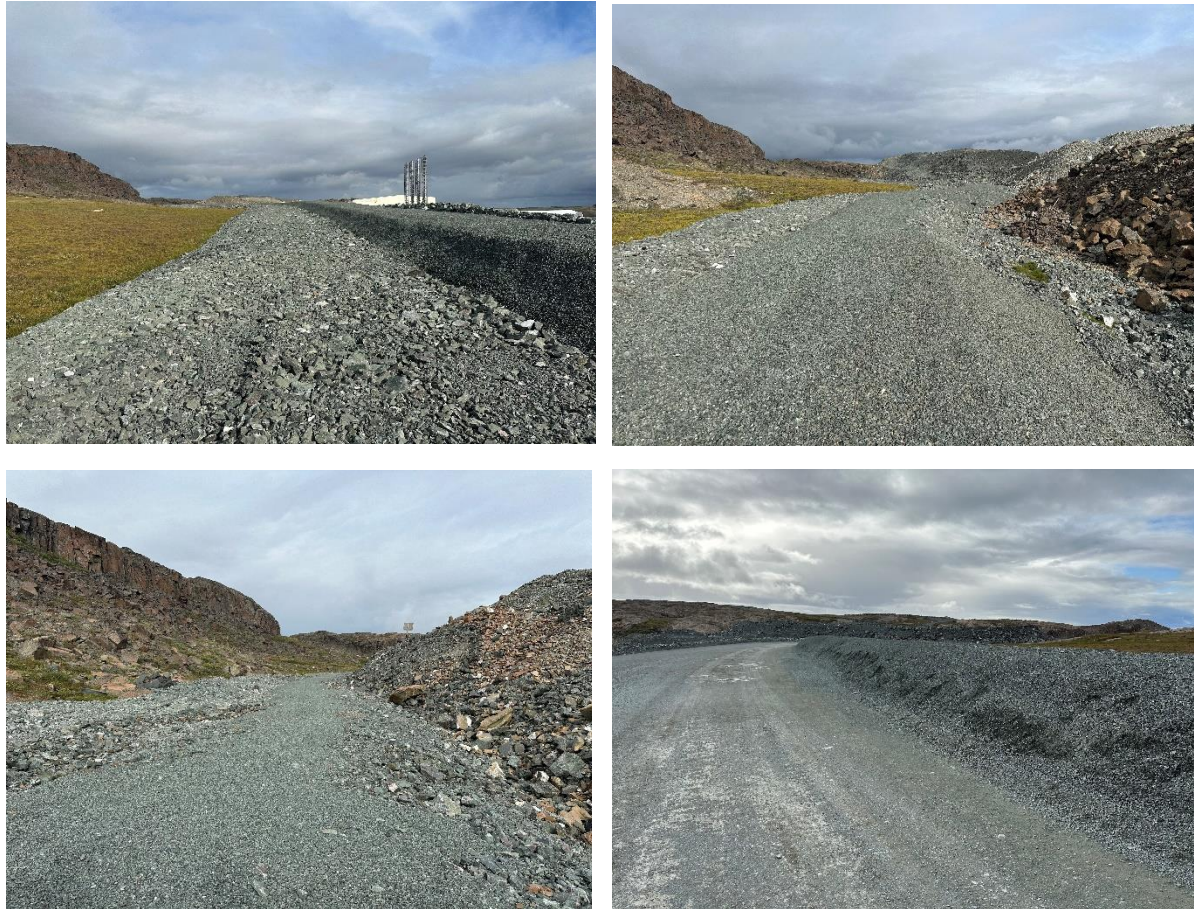
Figure 3. Diversion berm during August 2023

Visual monitoring was conducted at the Diversion Berm this month. No issues were identified at the Diversion Berm and associated check dam. Photos of this infrastructure are provided in Figure 3 below. Inspections of site culverts throughout the month of August were continued.