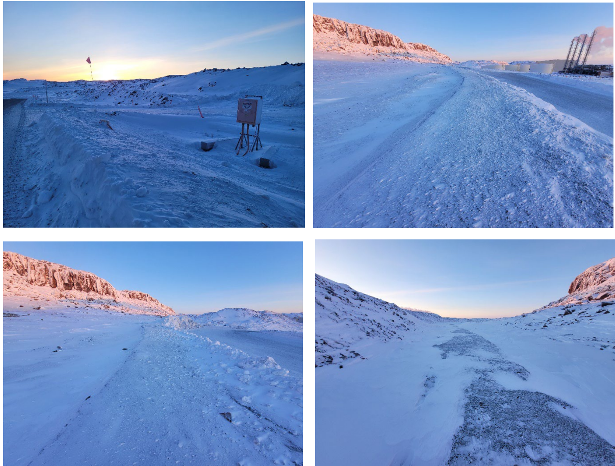
Figure 3. Diversion berm during January 2024