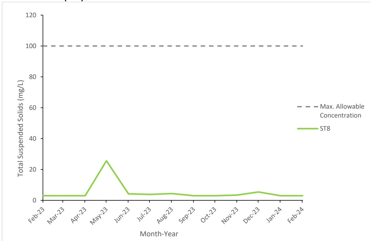
Figure 2. Total Suspended Solids Results Consistently Below Discharge Criteria for Wastewater Treatment Plant (ST8)

Note: Maximum Average Concentration as per Part F Item 4(b).