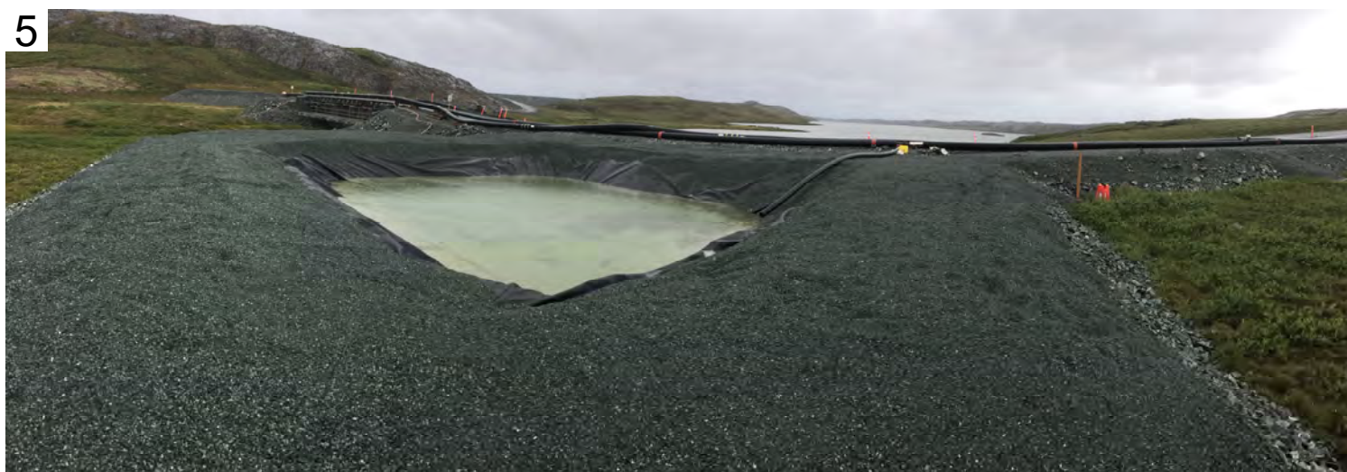
Photos: Photo 1: Photo of North EDCB looking south Photo 2: Photo of the North EDCB looking NE Photo 3: South EDCB looking south, Photo 4: South EDCB looking SE Photo 5: South EDCB looking east over Doris Lake